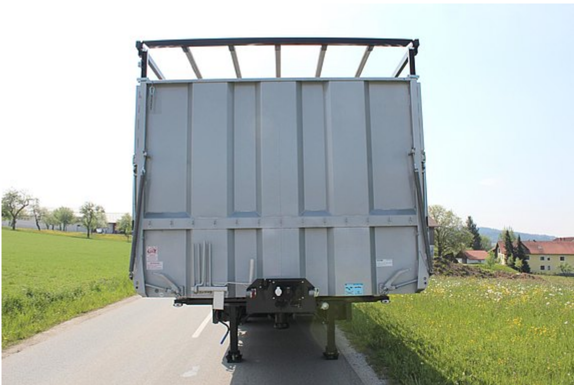
Fixed steel sheet front wall, 3 mm