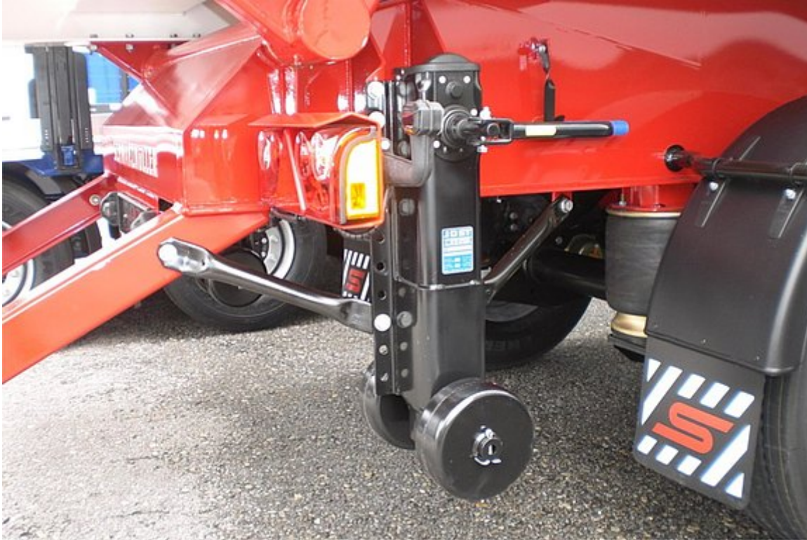
OPTIONAL: 2 mechanical support winches with rollers at frame end