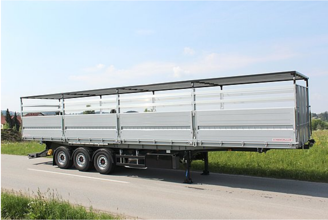
3-axle 3-way tipper semitrailer - long-haul transport