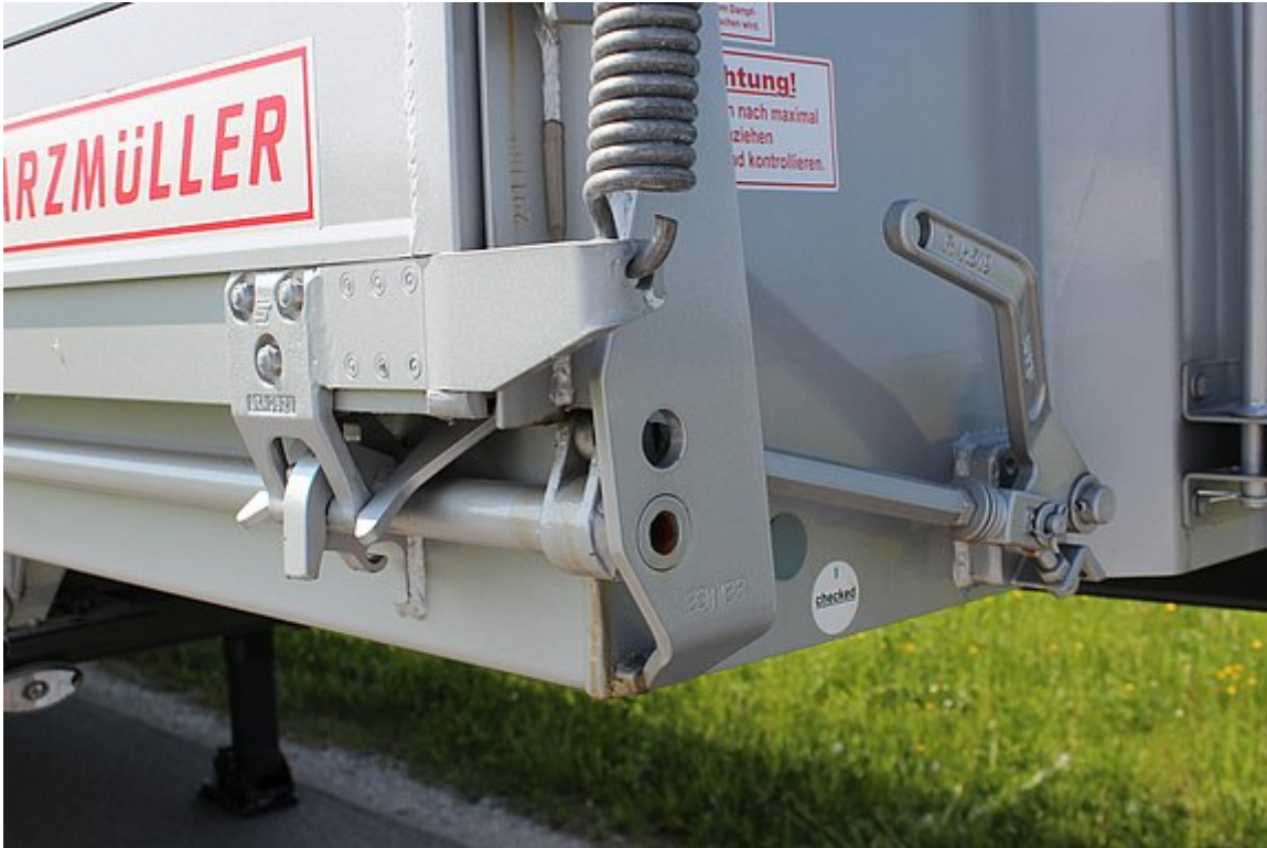
Manual central locking to open the side walls using a lever and central locking shaft