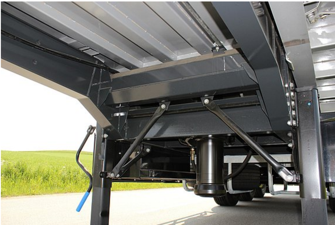
Stable and torsionally rigid chassis design with additional torsion tubes for 3-way tipping