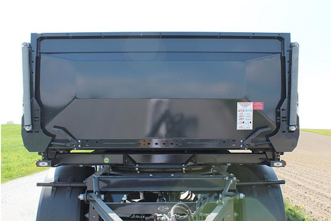
Fixed steel-sheet front wall