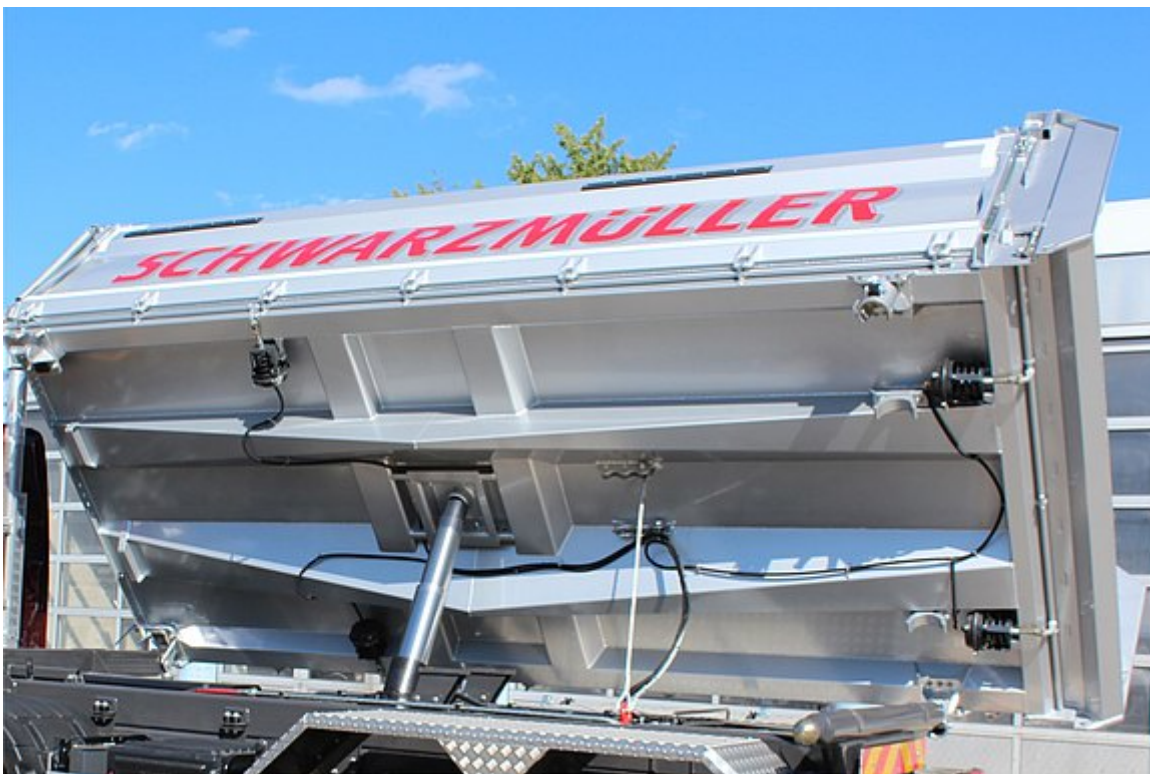
Tipper body design with conical trapezoidal profile side members in high-strength, lightweight design with small bottom panels for high dent resistance and shock absorption