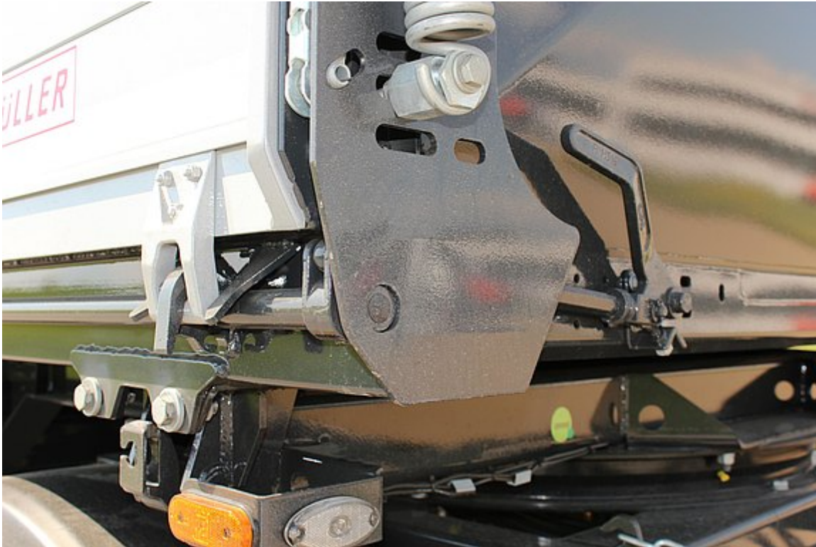
Manual central locking to open the side walls using a lever and central locking shaft