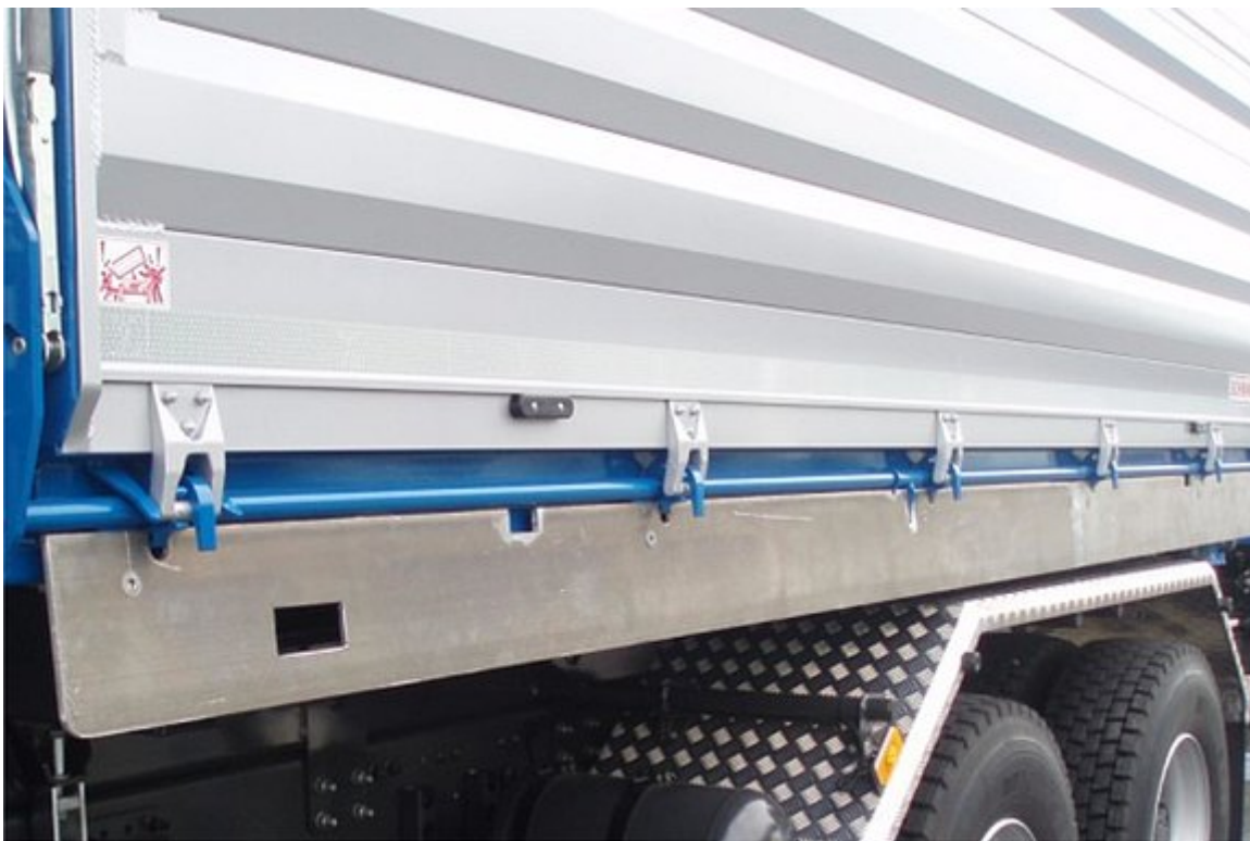
OPTIONAL: Aluminium flap on lateral central locking shaft