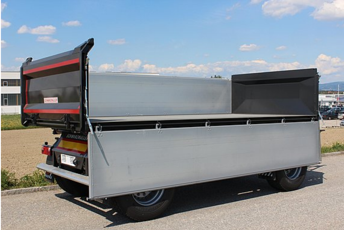
2-axle 3-way tipper trailer with folding side wall