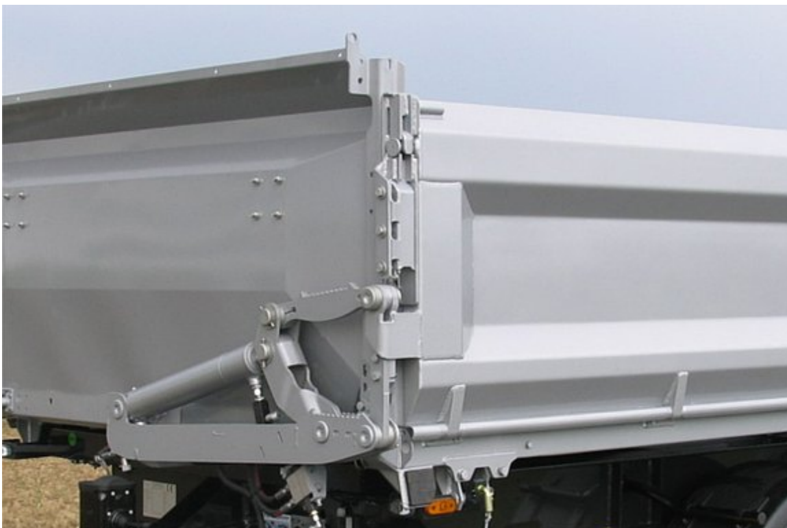
OPTIONAL: Bordmatic (= hydraulically folding side wall) on left side