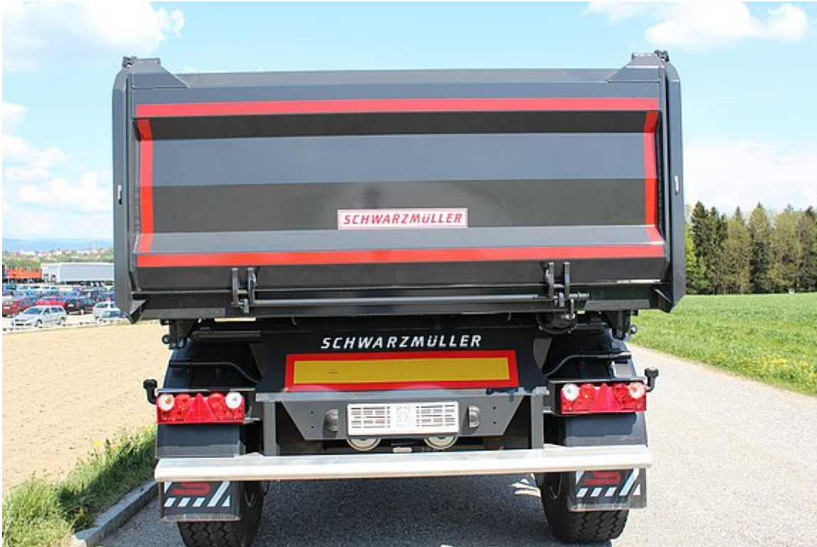
4 mm steel sheet rear wall, hinged with raised bearing and autom. pneumatic lock