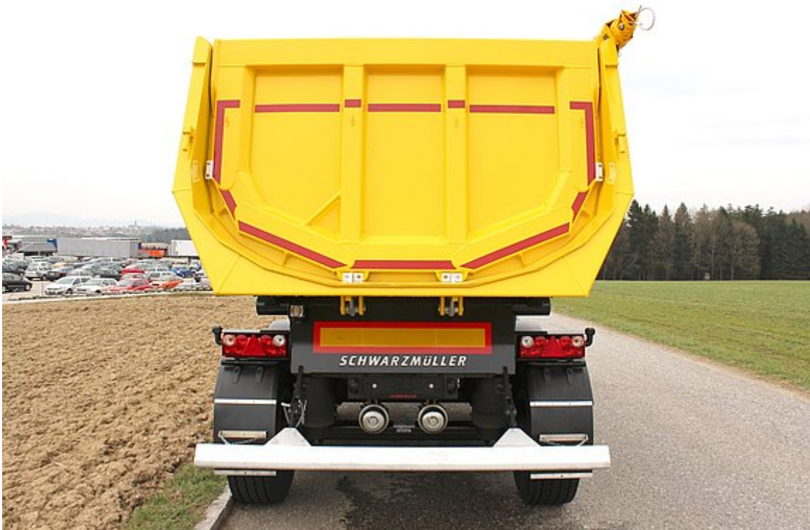
Rear wall = hinged wall with recessed bearing and autom. mech. dual-hook central locking