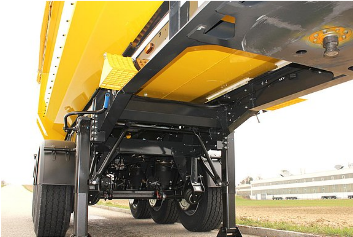
Stable and torsionally rigid chassis design with additional torsion tubes