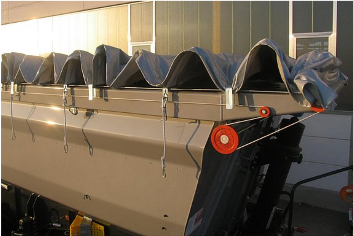
OPTIONAL: Roller cover - operated manually or via electric remote control