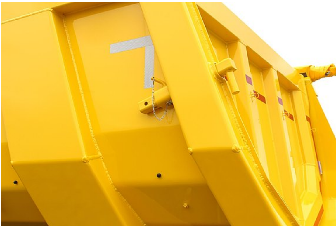
OPTIONAL: Dosing unit for hinged rear wall with pull-out pipe stop