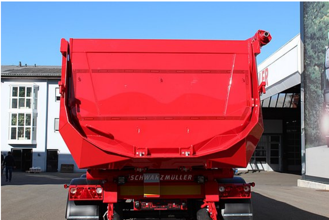
Insulated rear wall = hinged wall with recessed bearing and autom. mech. 2-hook central locking