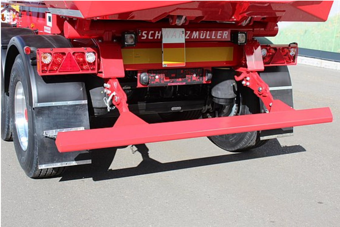
Folding aluminium trapezoidal underride protection, can be folded up pneumatically as an option