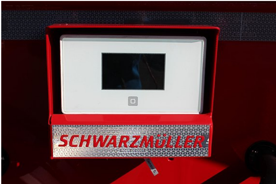
Temperature analysis unit in a sturdy box