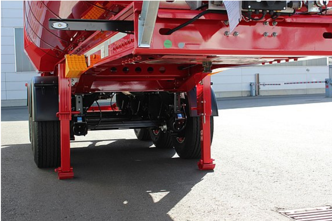
Stable, torsionally rigid aluminium chassis design with additional torsion tubes for high tipping stability