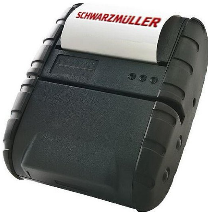
Mobile printer unit