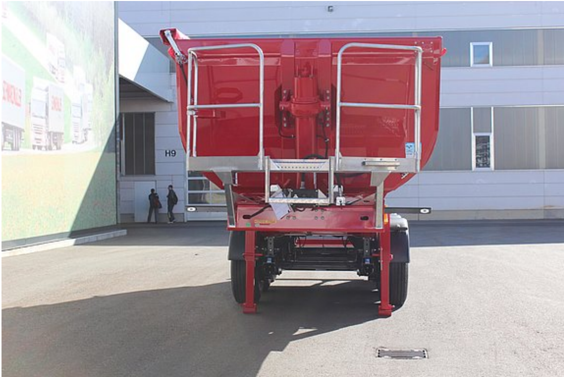
Insulated front wall with hard chrome-plated, high-grade front tilt cylinder