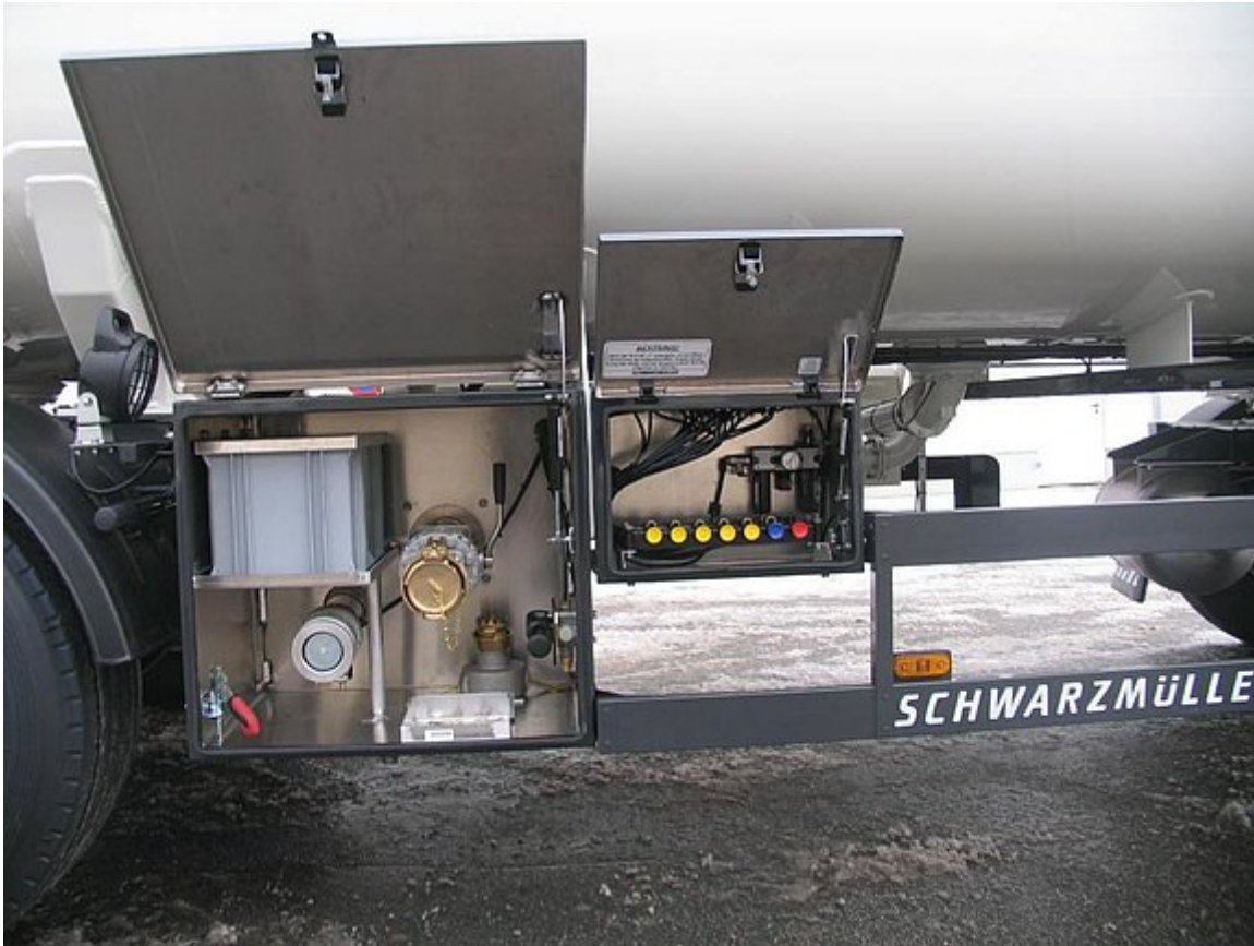
Discharge box with upward-opening door to protect the fittings incl. box for pneumatic valve control