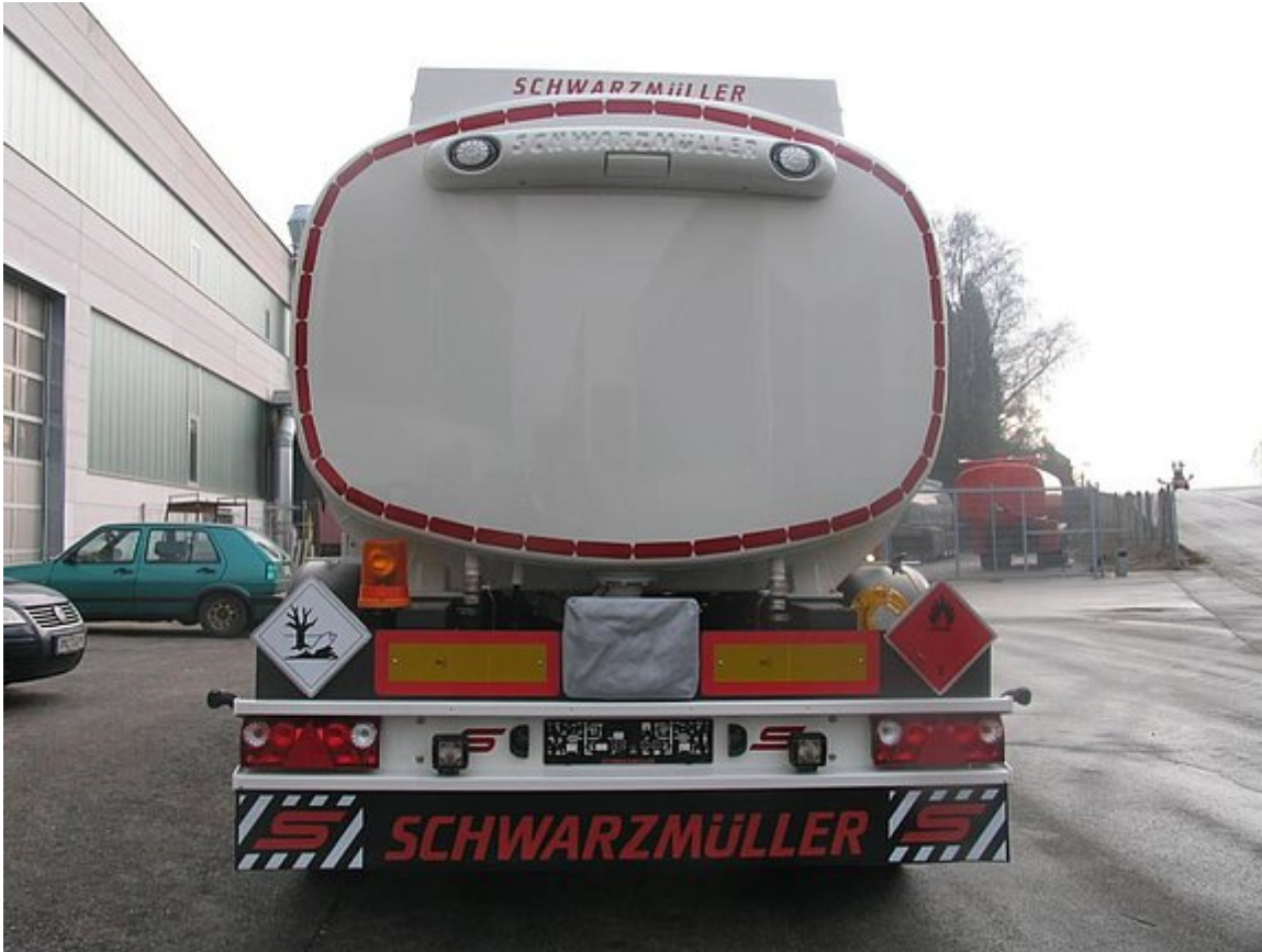
OPTIONAL: High-set LED light holder with optional integration of reversing camera