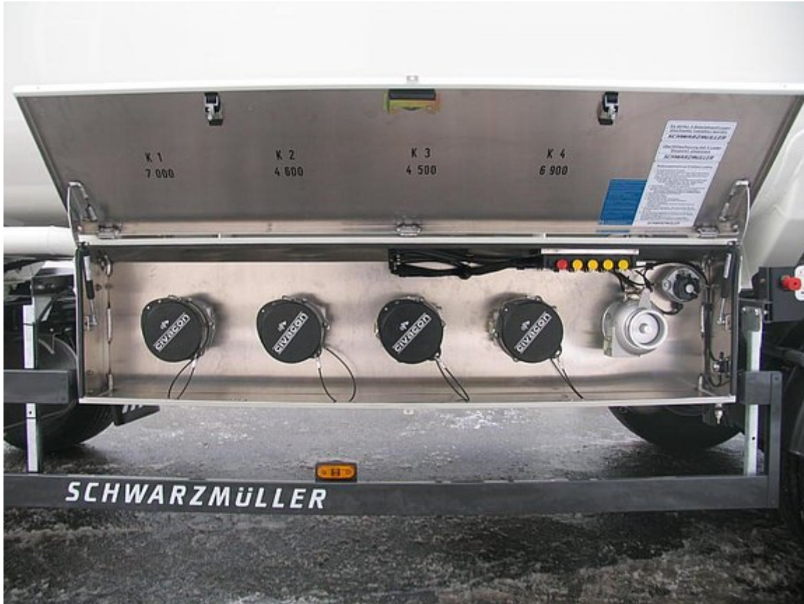
Structured and clear arrangement of fittings for efficient and fault-free operation