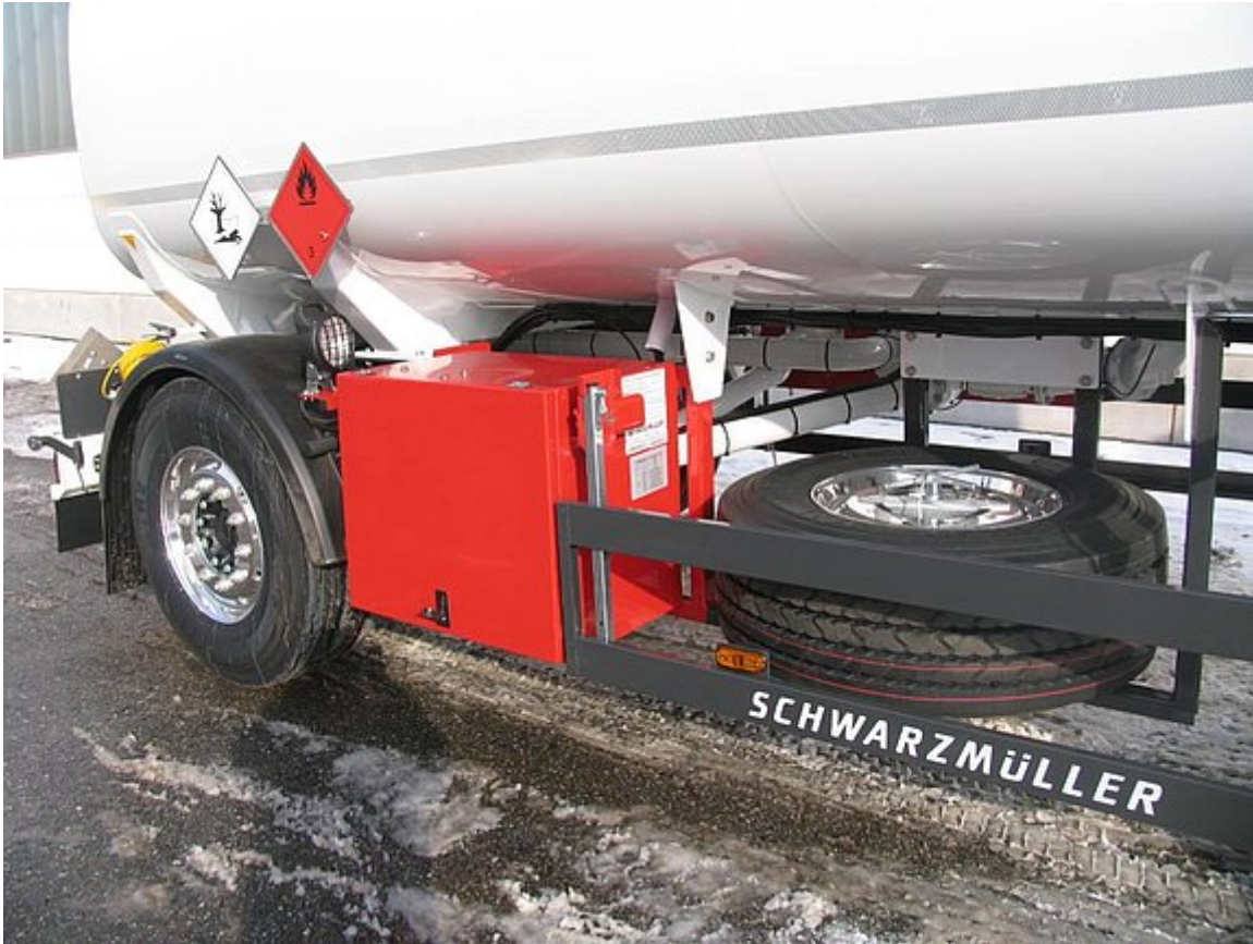
OPTIONAL: Facility for mounting spare wheel bracket