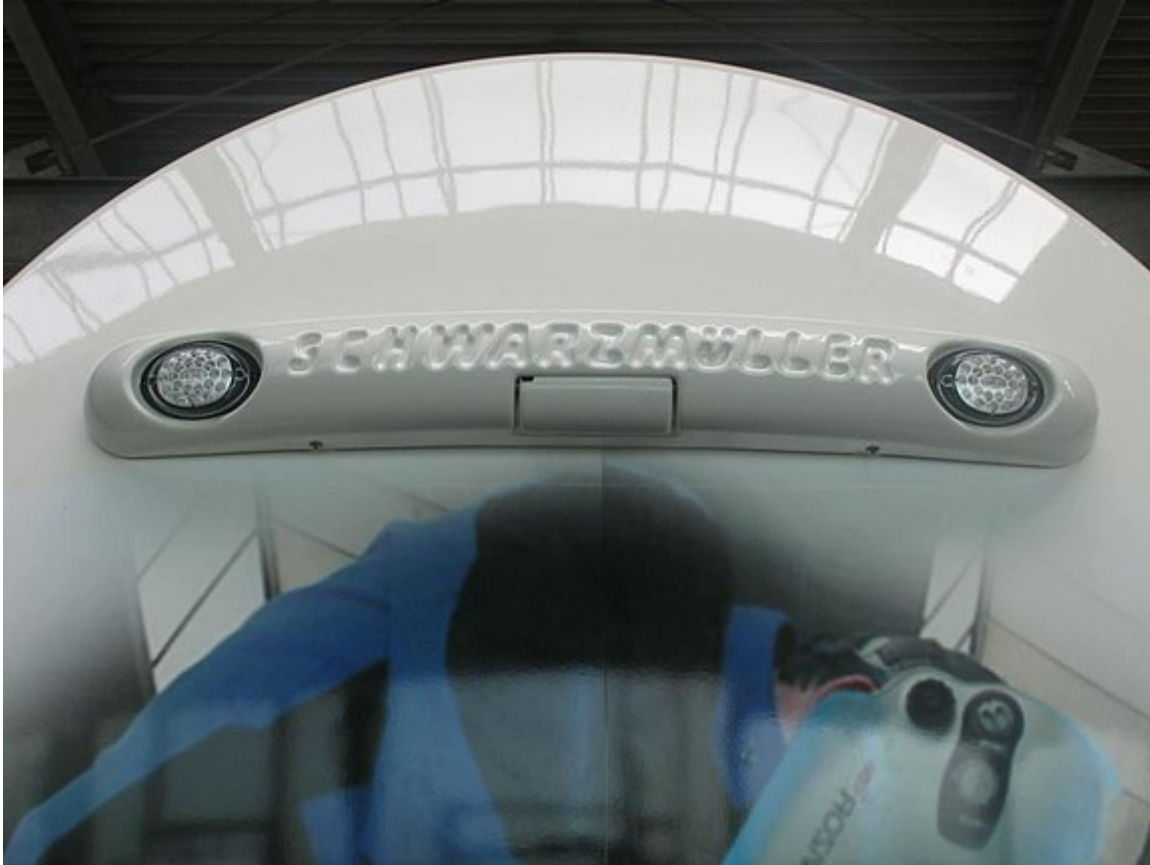
OPTIONAL: High-set LED light holder with optional integration of reversing camera