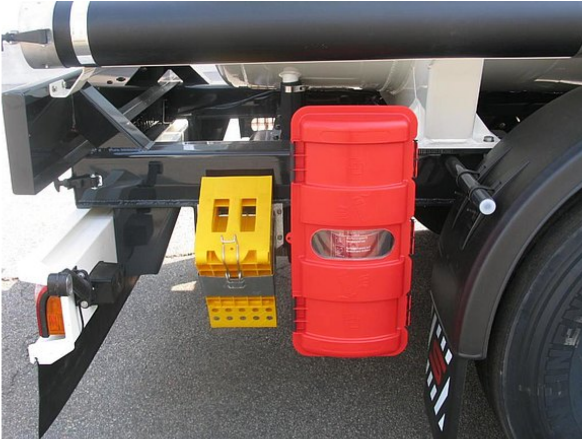
OPTIONAL: Fire extinguisher box with viewing window