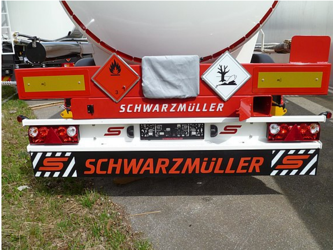
Hose cabinets integrated into the chassis frame