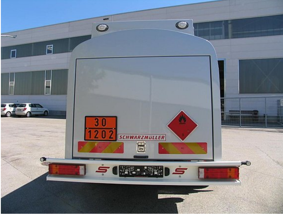
OPTIONAL: 2 high-set tail lights recessed in rear cabinet