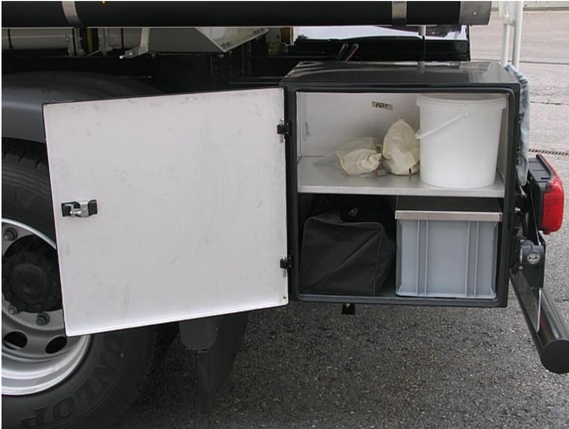
Accessories box with side-opening door offers plenty of storage space