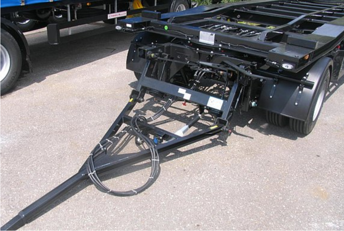
OPTIONAL: Pneumatically lowering drawbar, for loading roll-off containers from the front