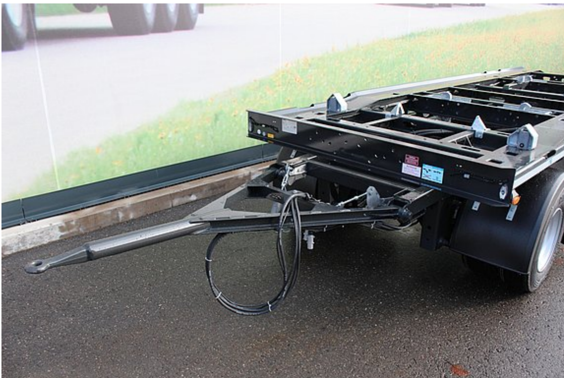
Bogie at front incl. fitted drawbar