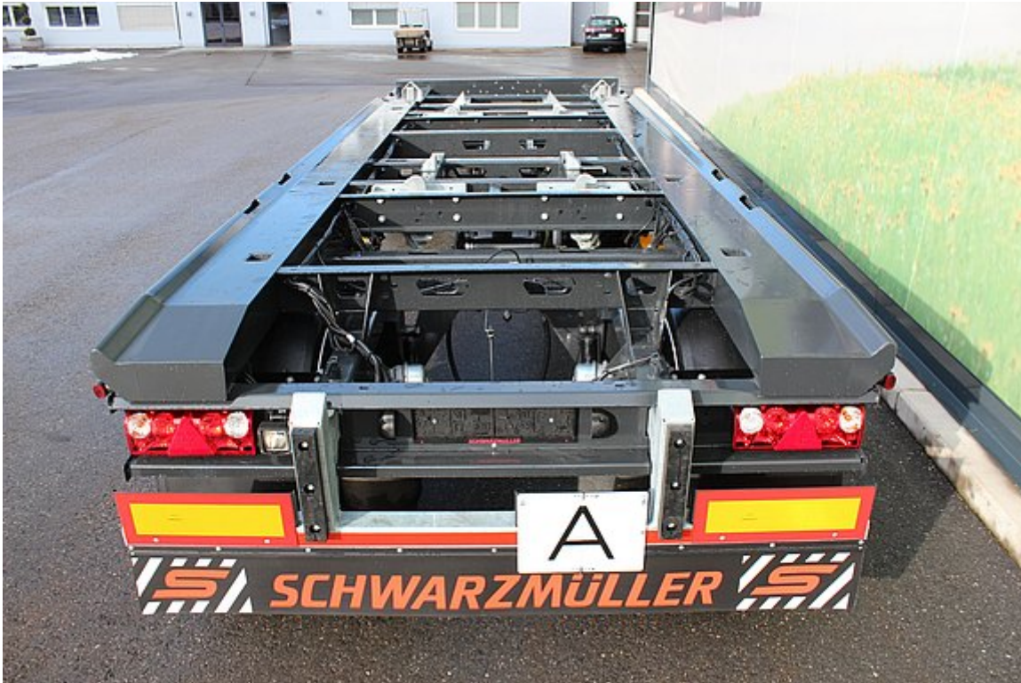
Frame length approx. 7,000 mm for container lengths of 5,500 - 7,000 mm