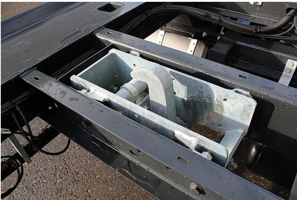
Pneumatic lock hooks with switch on trailer