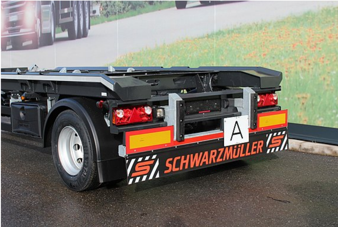
Bolted steel underride protection, with vertical rubber buffers