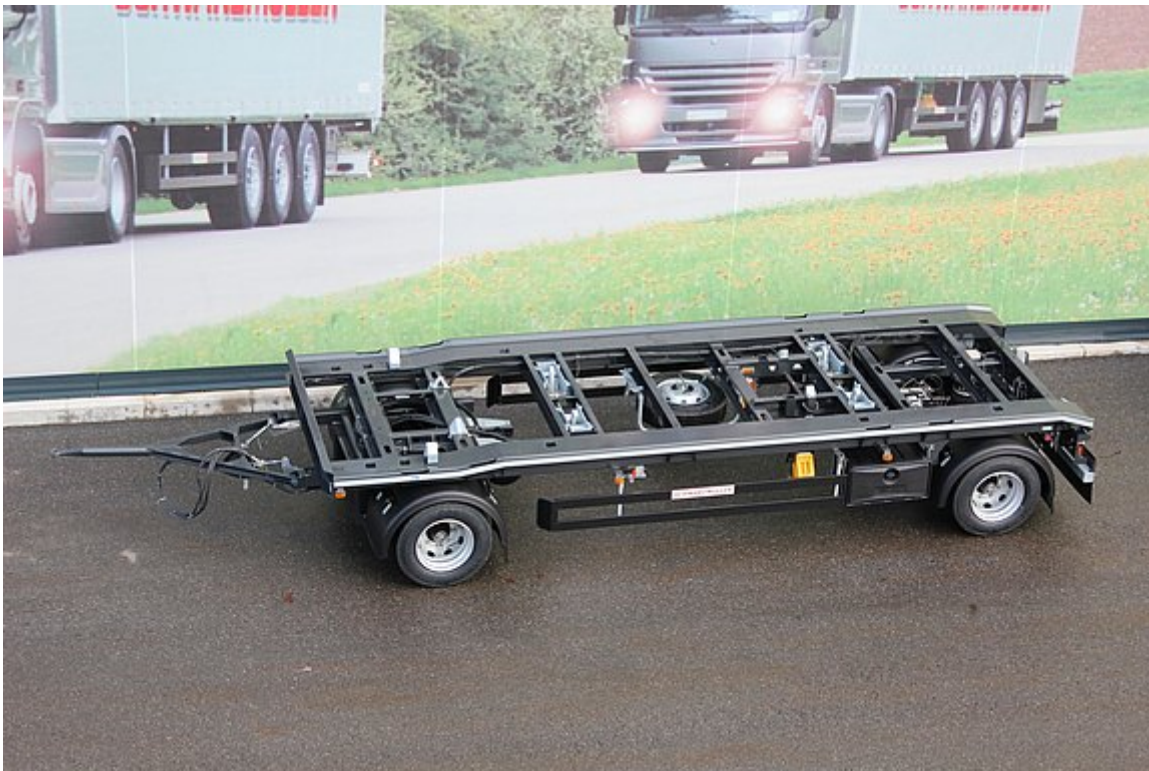
2-axle low loader trailer chassis for roll-off containers