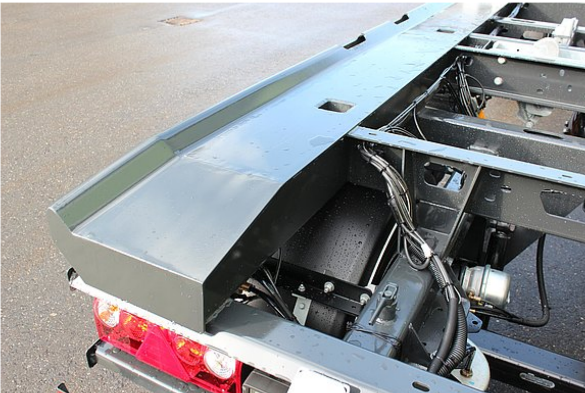
External centring for precise entry and guidance of container rollers