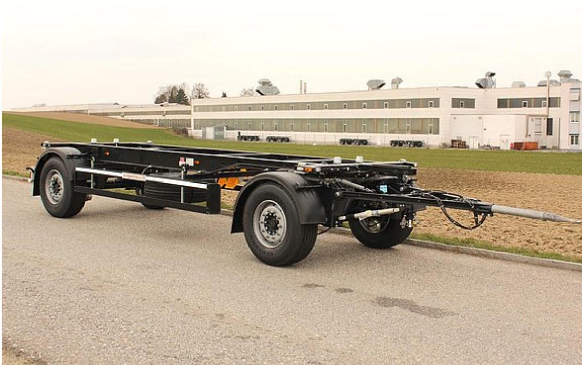
2-axle BDF trailer chassis