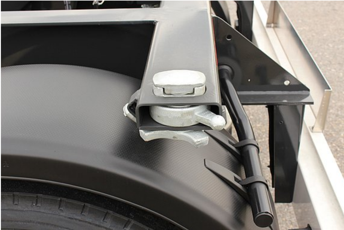
Support cross member incl. container lock in accordance with EN 284