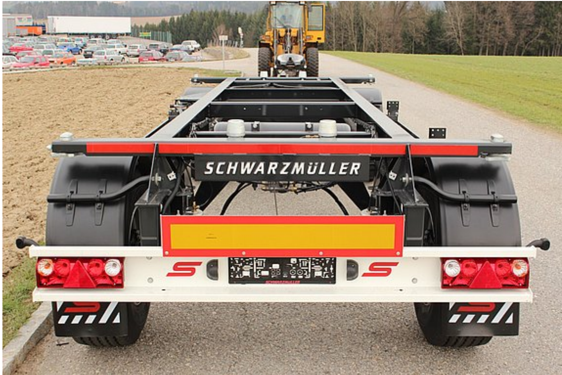
Underride protection incl. integrated light system