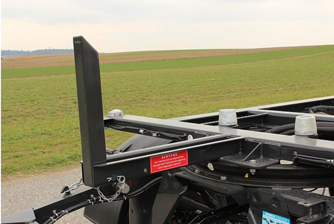
Stop support at front, tiltable and relocatable