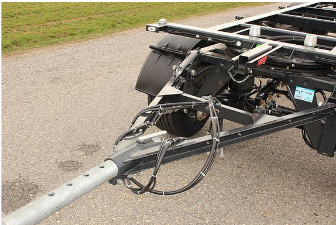
Pull-out drawbar, max. 600 mm adjustment, with Getofix drawbar support