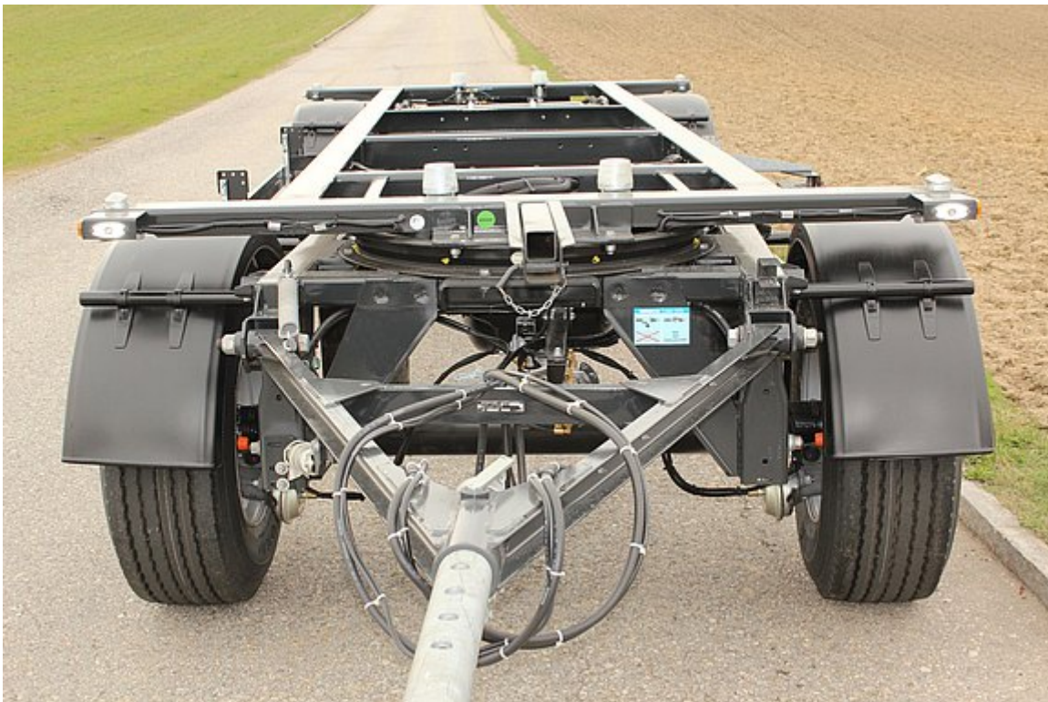
Bogie with front arm