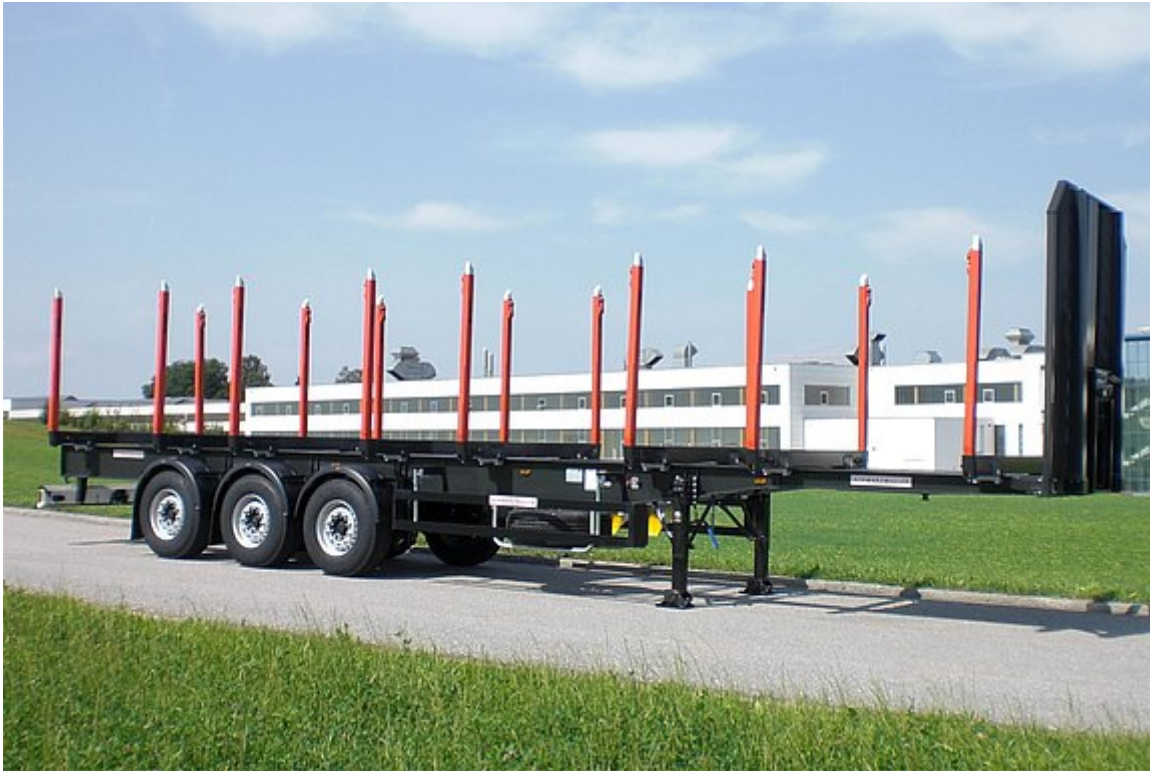
3-axle stanchion semitrailer - without platform