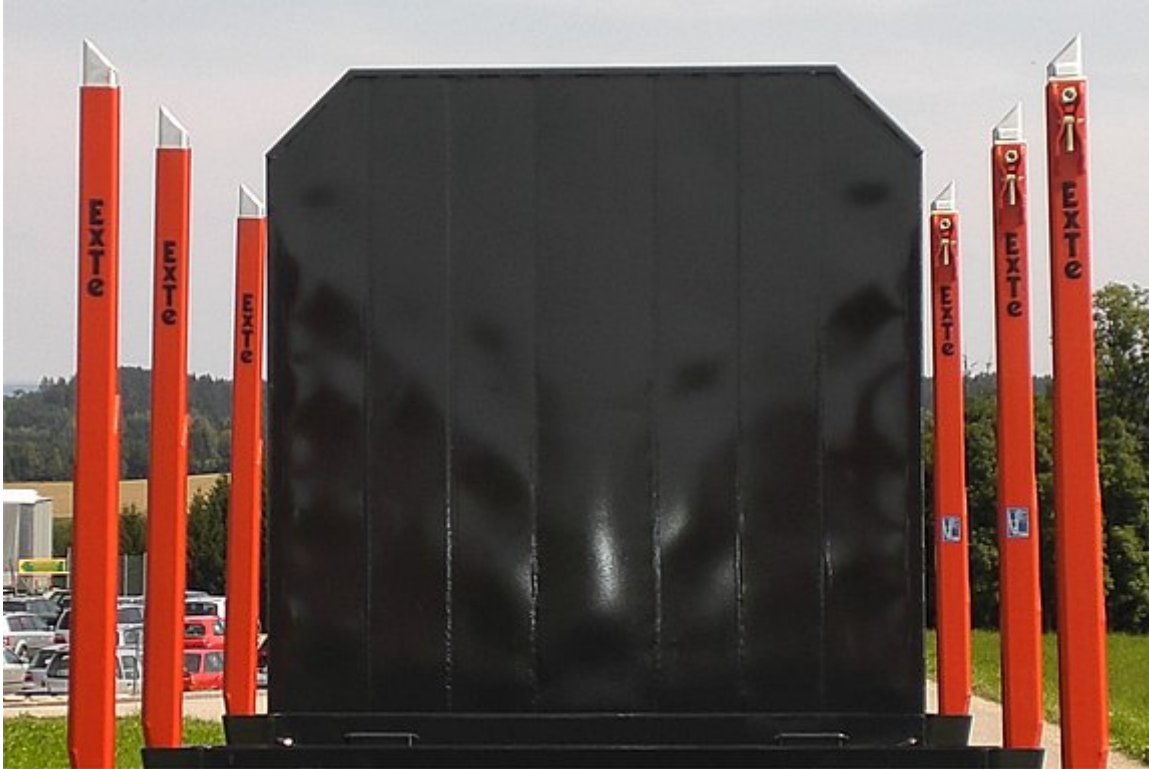
OPTIONAL: Extra-strong steel profile front wall, approx. 2,500 mm high with centre supports