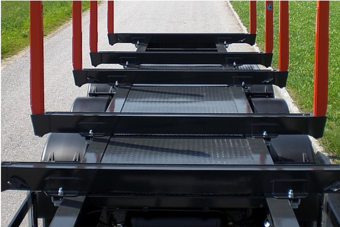
Chequered steel plate cover between frame side members over the chassis and at the front