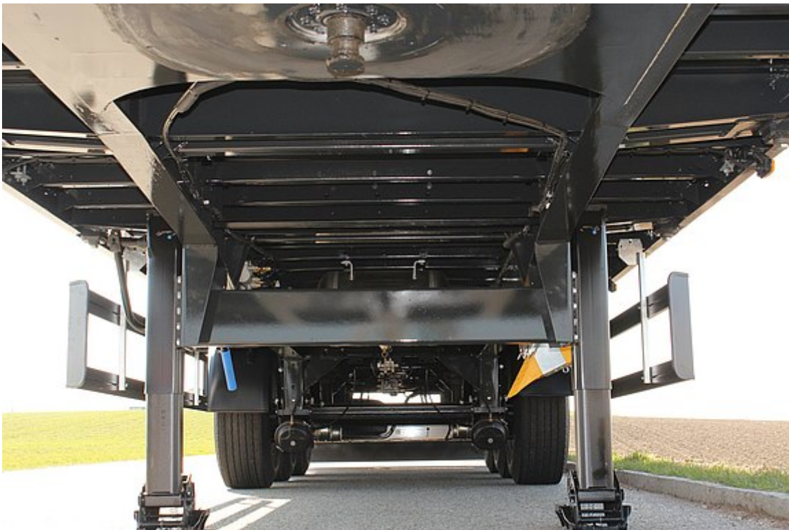
Lightweight frame made from special high-strength NAXTRA steel provides payload advantage of up to 500 kg