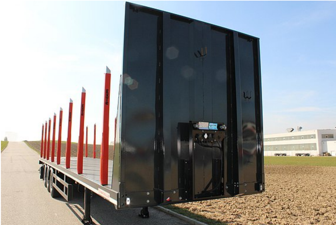
Extra-strong steel profile front wall with centre supports