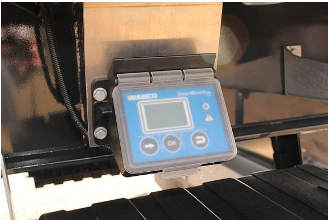
OPTIONAL: SmartBoard for reading data on vehicle display (mileage, axle assembly load, brake diagnostics etc.)