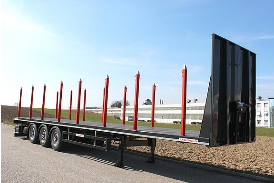
3-axle stanchion platform semitrailer