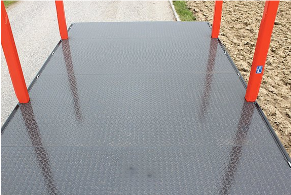
Steel stud plate floor, 5/7 mm, tack-welded