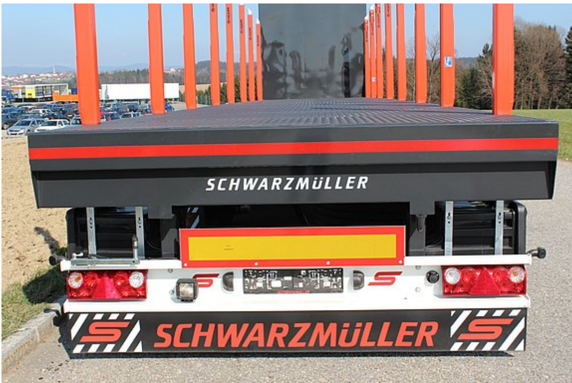
Rear closing element incl. fitted aluminium underride protection