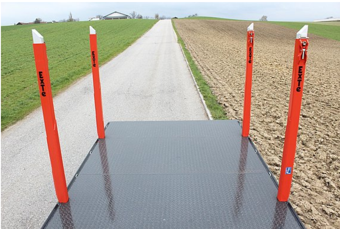
ExTe stanchion pockets with reinforcement brackets incl. 2-part ExTe stanchions 144-S with bolt fastening (load capacity: 7 t/pair)