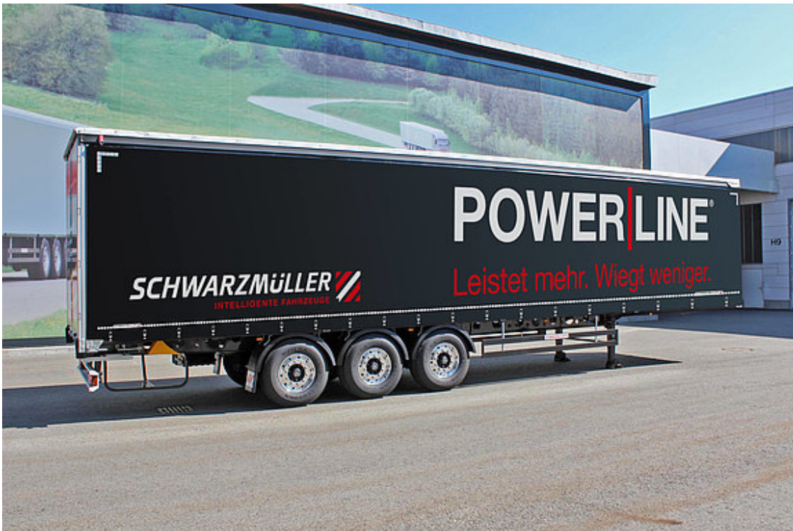
3-axle light weight sliding tarpaulin platform semitrailer - paper rolls