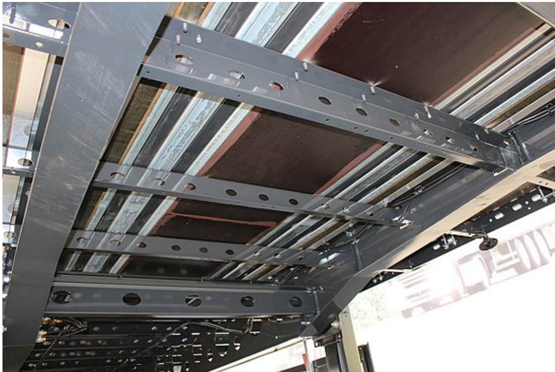
27-mm resin-coated panel floor, alongside side members and with 12-mm resin-coated surface on top, rear 300 mm made from aluminium button sheet 7/9 mm, flush with external frame (7 t stacker axle load according to CSC)