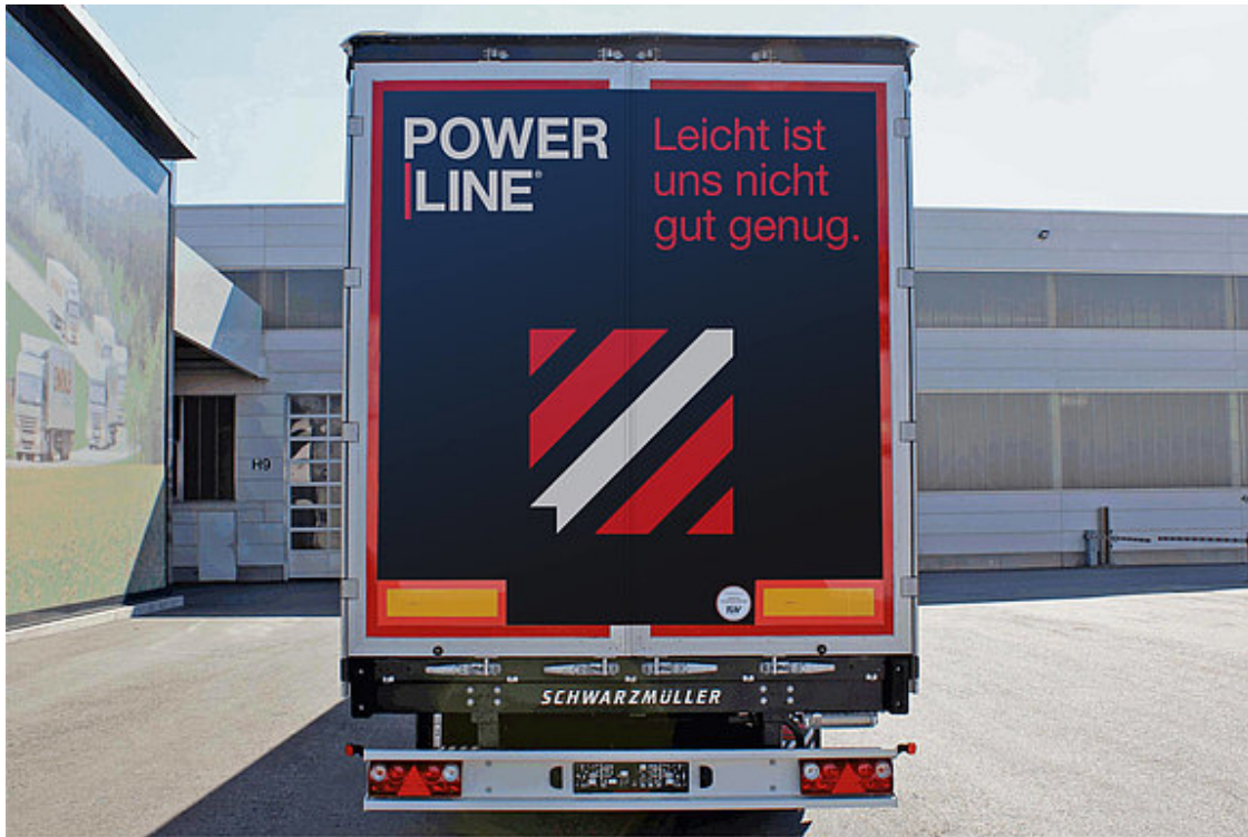
Bolted portal at rear with aluminium corner posts and fully opening double door