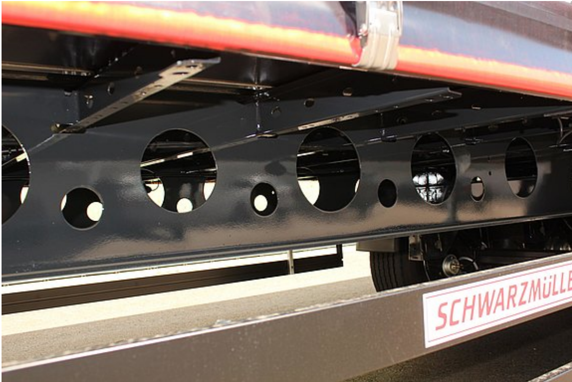
Lightweight construction with perforated side members made from special high-strength Naxtra steel