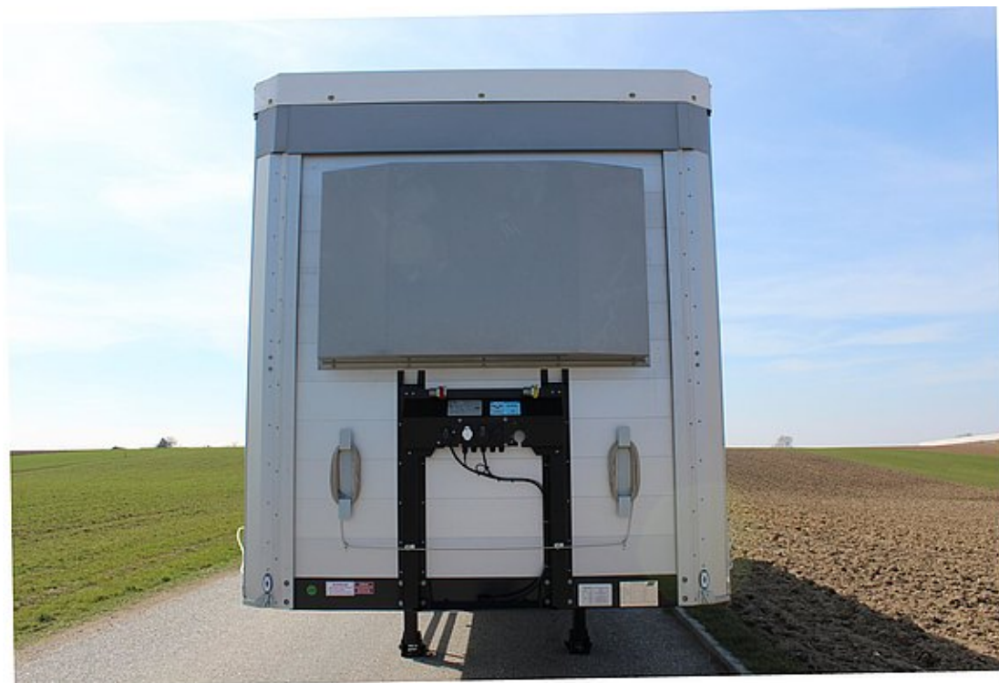
Wedge box on front wall with space for wedges, pallet rollers, lashing straps and non-slip mats