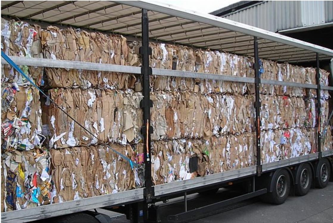
OPTIONAL: Special load securing certificate for recovered paper bales, cardboard pulp, vertical paper rolls =