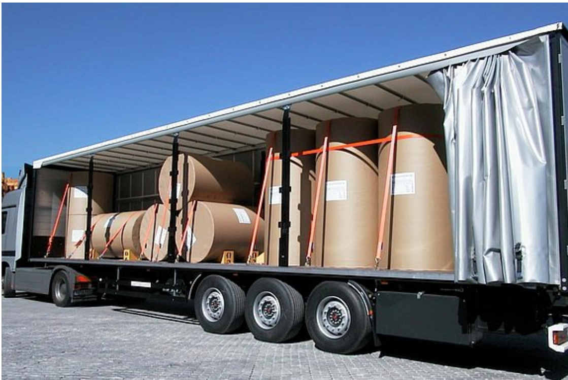
Transport of upright paper rolls