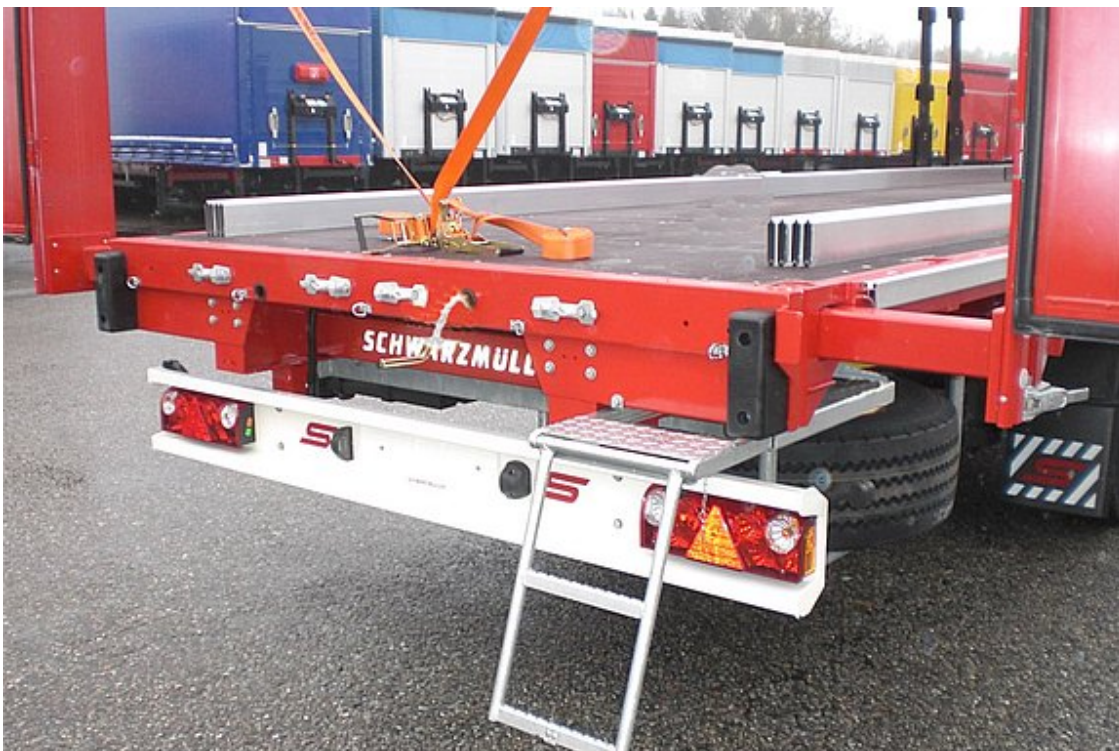
OPTIONAL: Extendible portal columns (each by approx. 400 mm) for easier loading and unloading