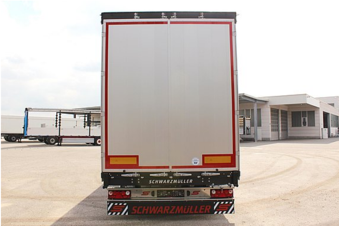
Bolted portal at rear with aluminium corner posts and fully opening double door in profile design