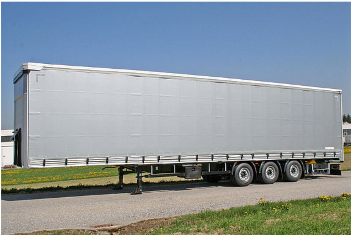
Low corrosion, high-quality aluminium body components, tested according to EN 12642