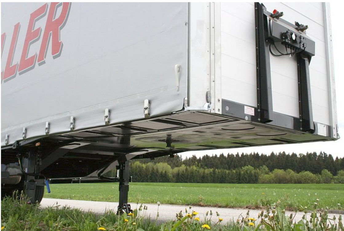
Low frame structure height of 80 mm for Lowliner tractors and up to 3,000 mm internal height