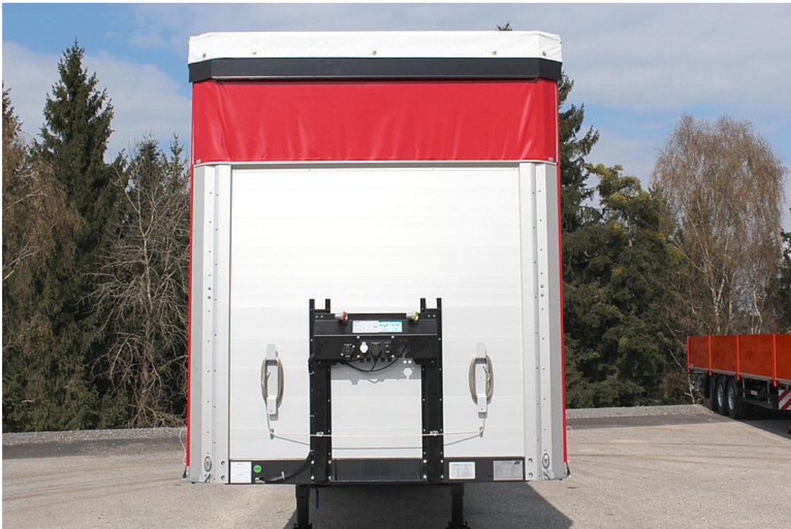
Reinforced aluminium hollow profile front wall with integrated equipment bracket