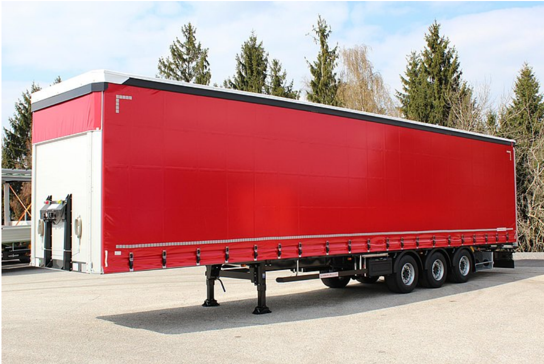
Low corrosion, high-quality aluminium body components, tested according to EN 12642