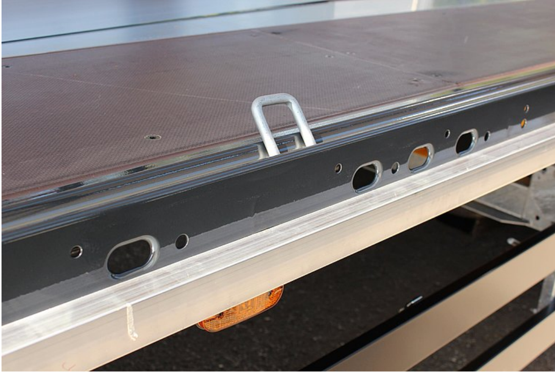
Perforated external frame (starting approx. 3,000 mm from front wall) with approx. 100 mm hole spacing, 40/25 mm slot according to DIN EN 12640 and 23 pairs of recessed 2,5 t lashing points