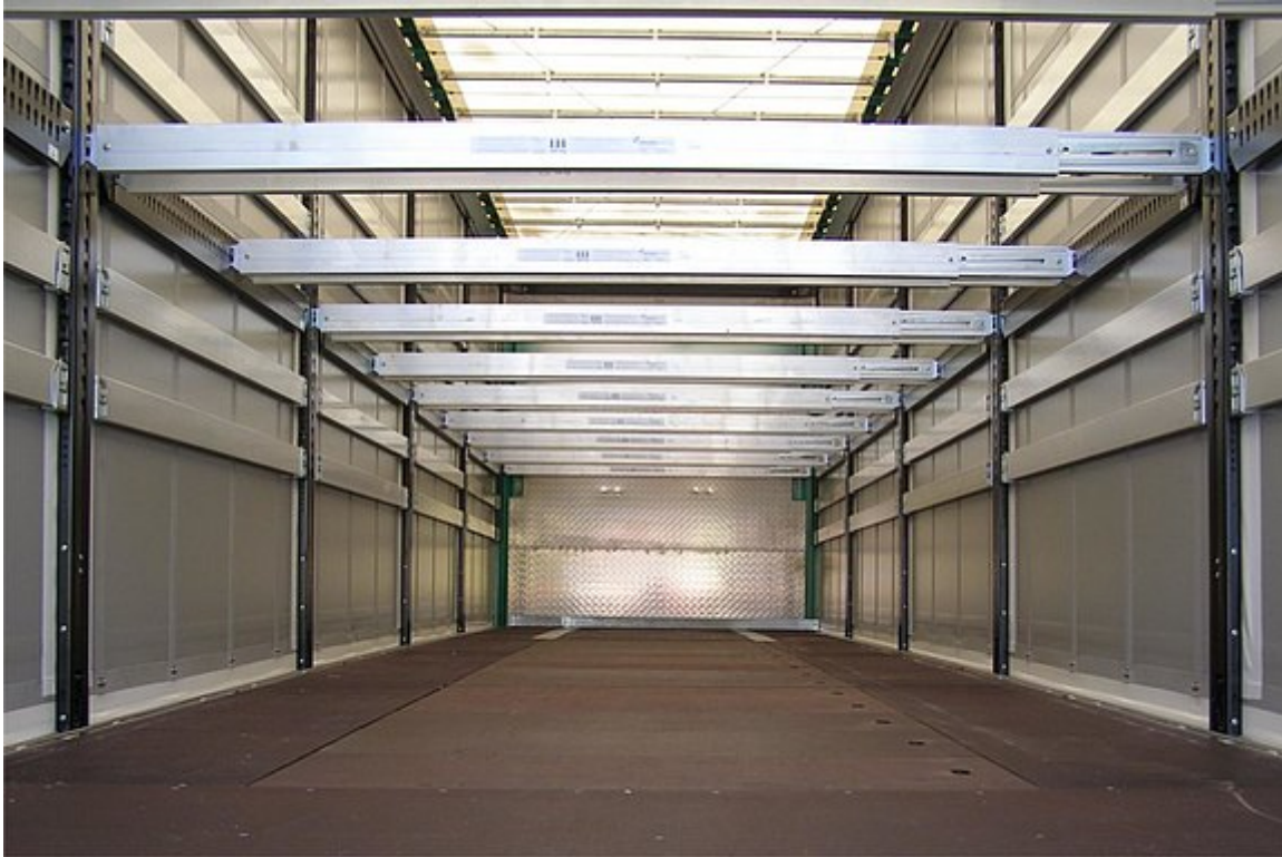
Twin-level loading system CTD for 33 Euro pallets on the 2nd loading level