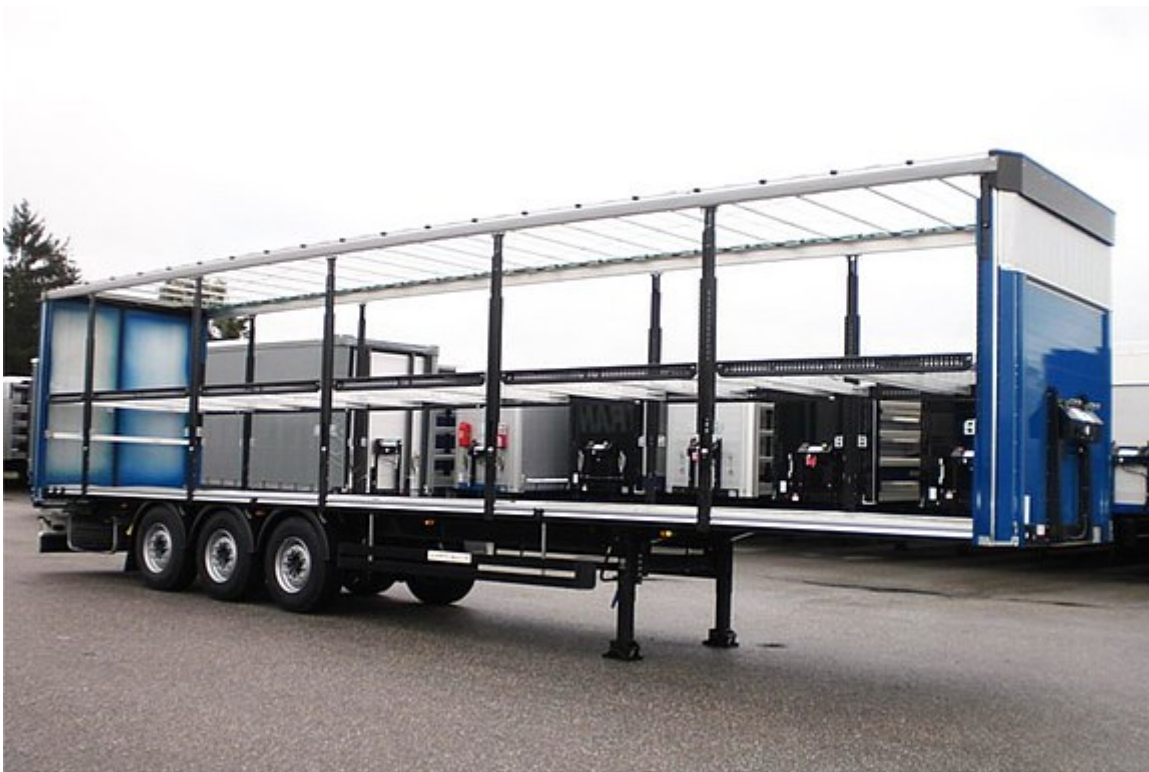
3-axle sliding tarpaulin platform semitrailer with twin-level loading system