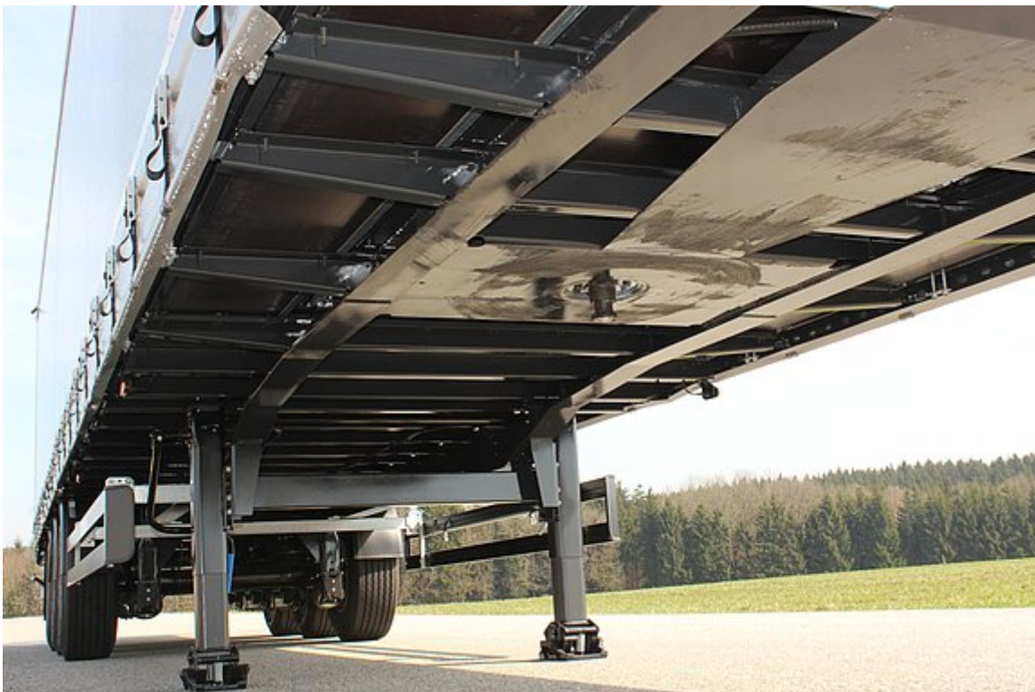
Torsionally rigid, welded ladder frame structure