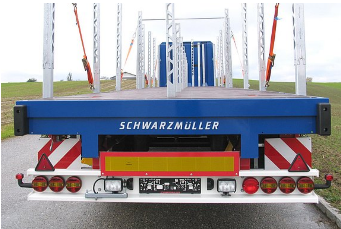
Underride protection with integrated rear light system and rubber buffers