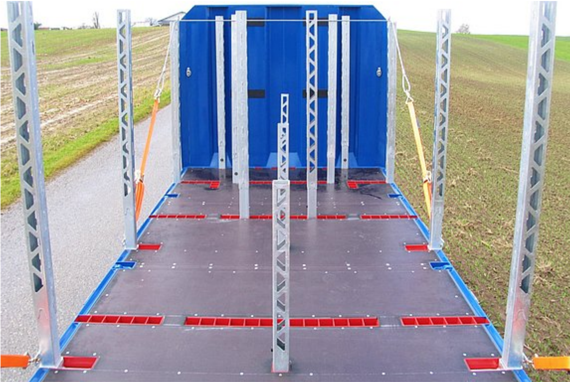
Rack positions for securing stacked construction steel mats, each with a length of 6,000 mm