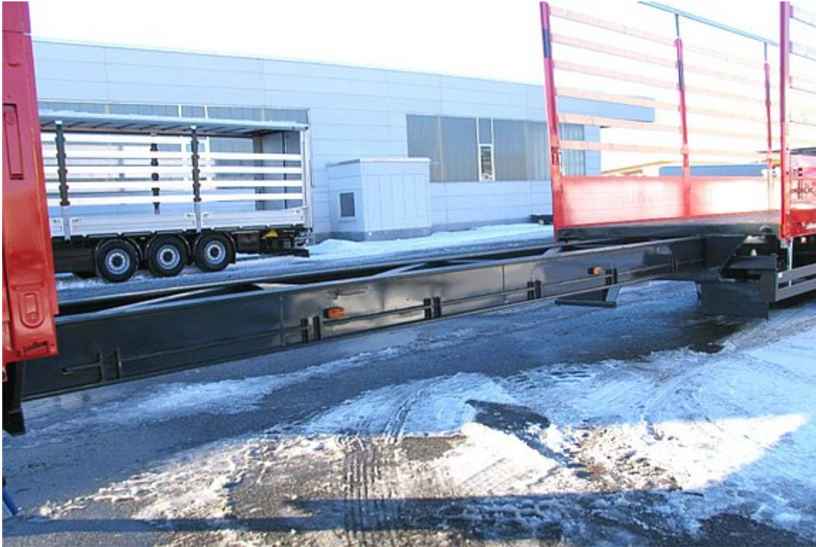
Torsionally rigid, pull-out welded steel frame design, with 7-step pneumatic locking