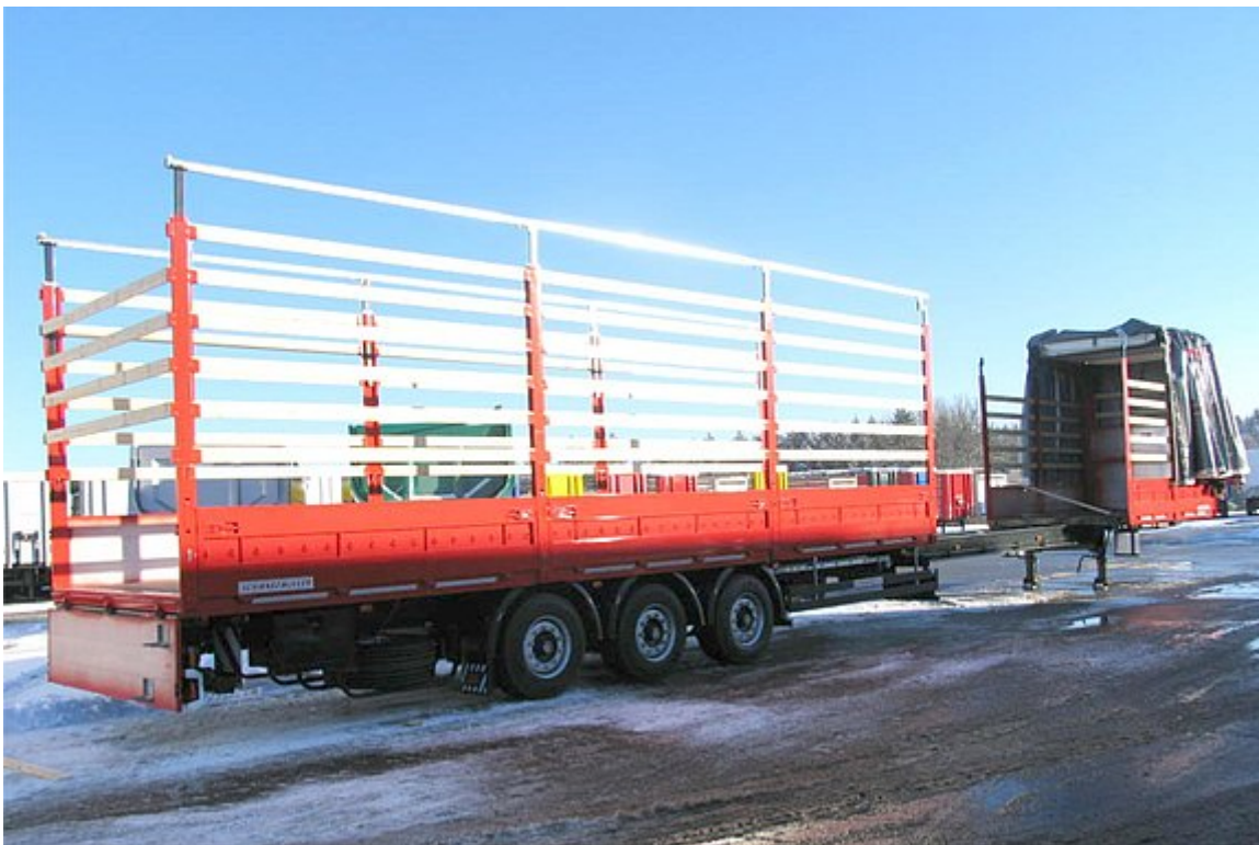
3-axle platform semitrailer - extendible