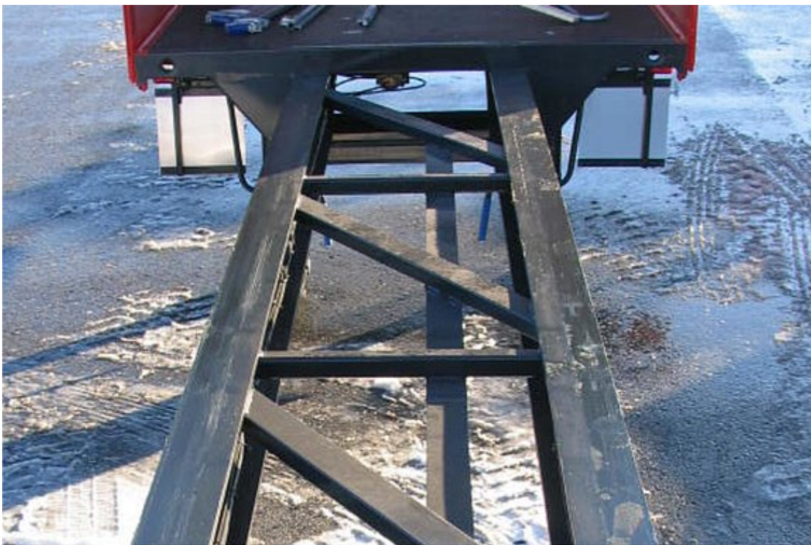
Extendible lightweight frame with an extension length of 6 m for long materials transport up to 22 m