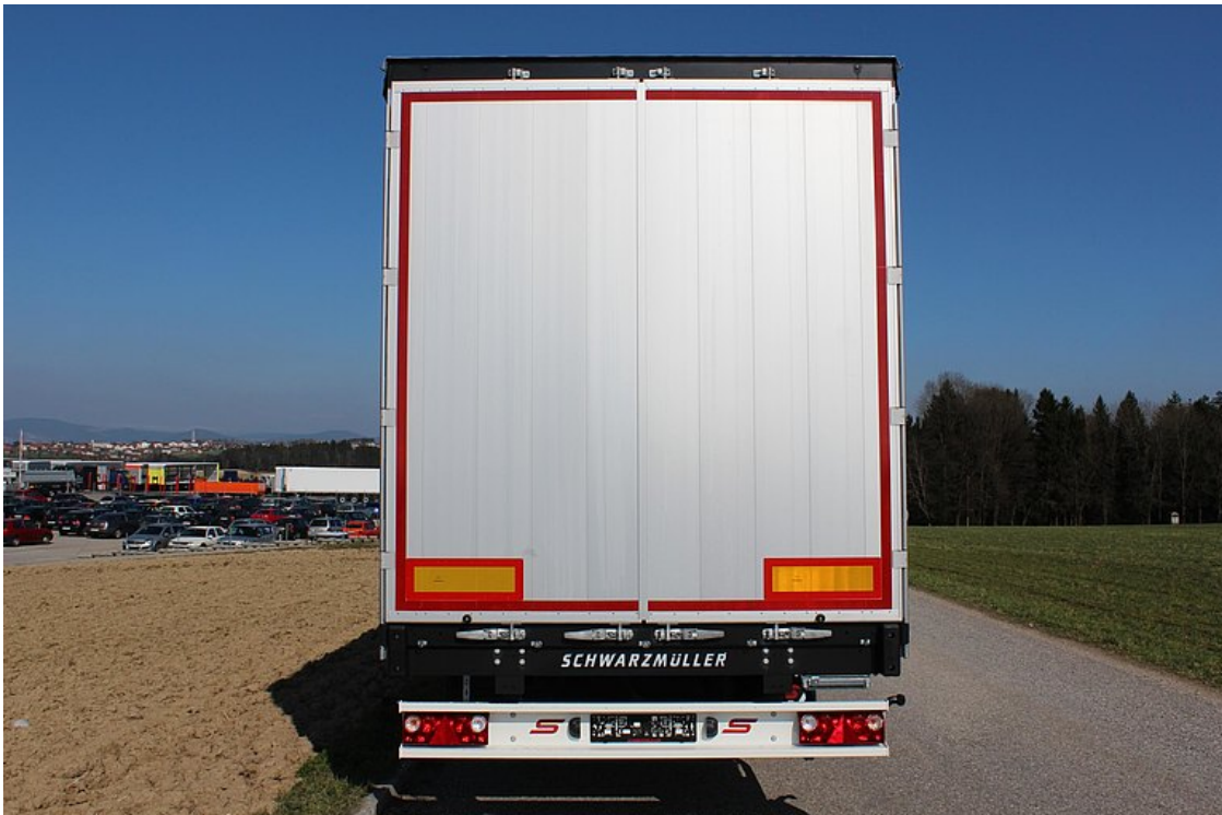
Bolted portal at rear with aluminium corner posts and fully opening double door in profile design