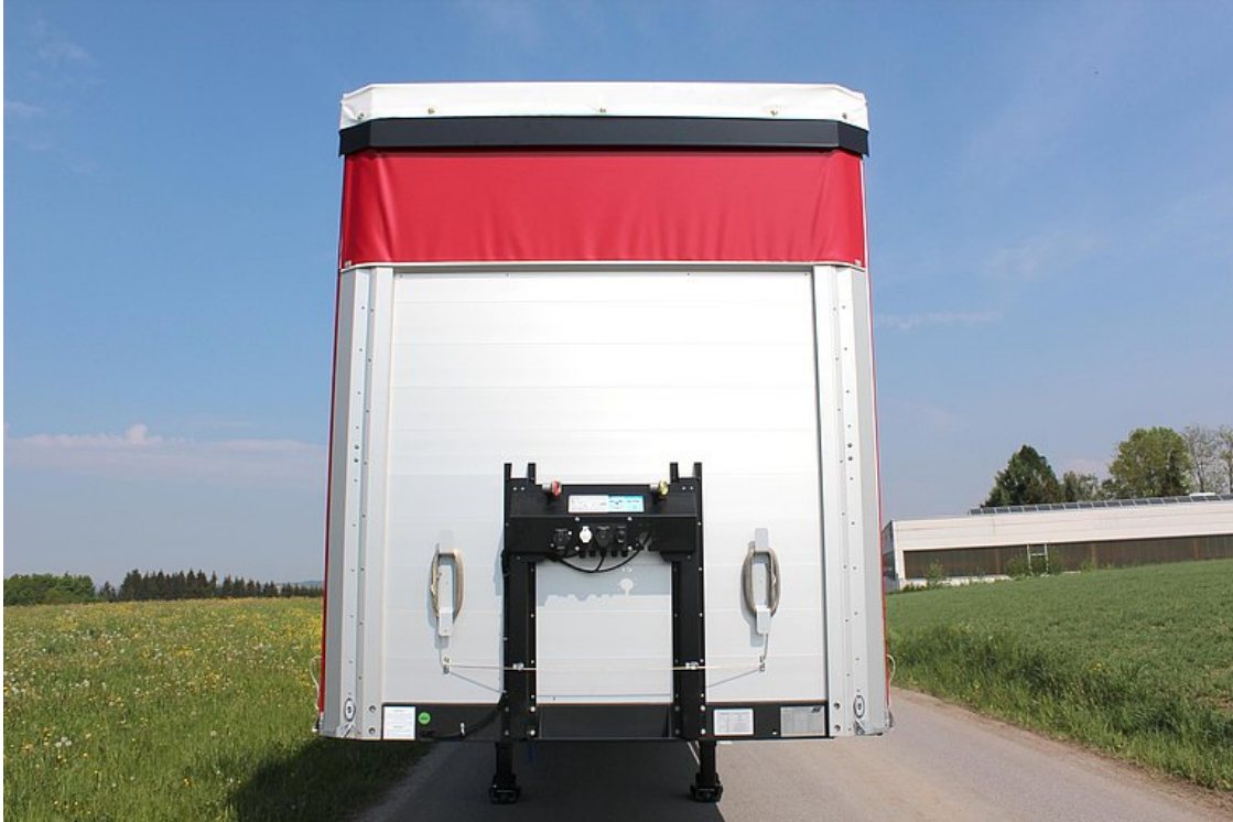
Reinforced aluminium hollow profile front wall with integrated equipment bracket