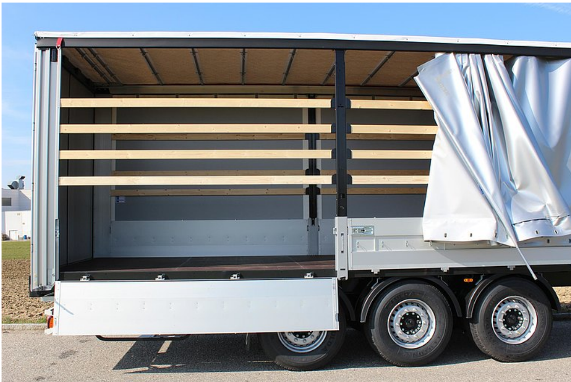
OPTIONAL: Version with sliding tarpaulin + side walls