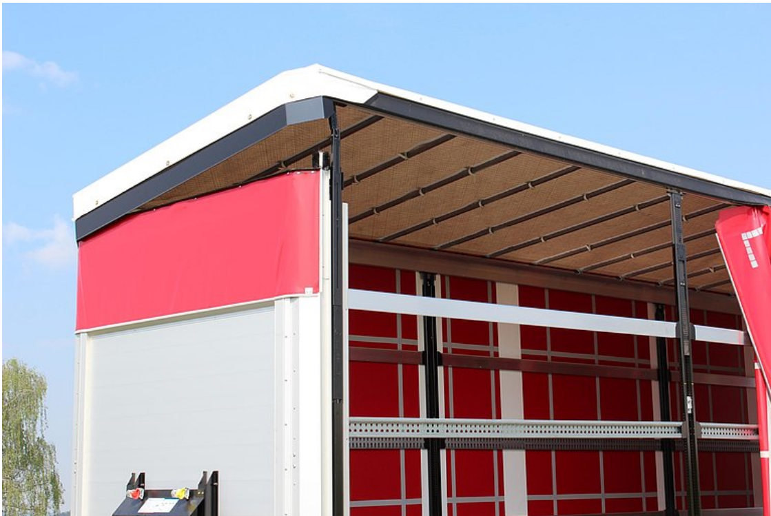
OPTIONAL: Manually operated hydraulic lifting roof, 400 mm elevation for rapid loading and unloading