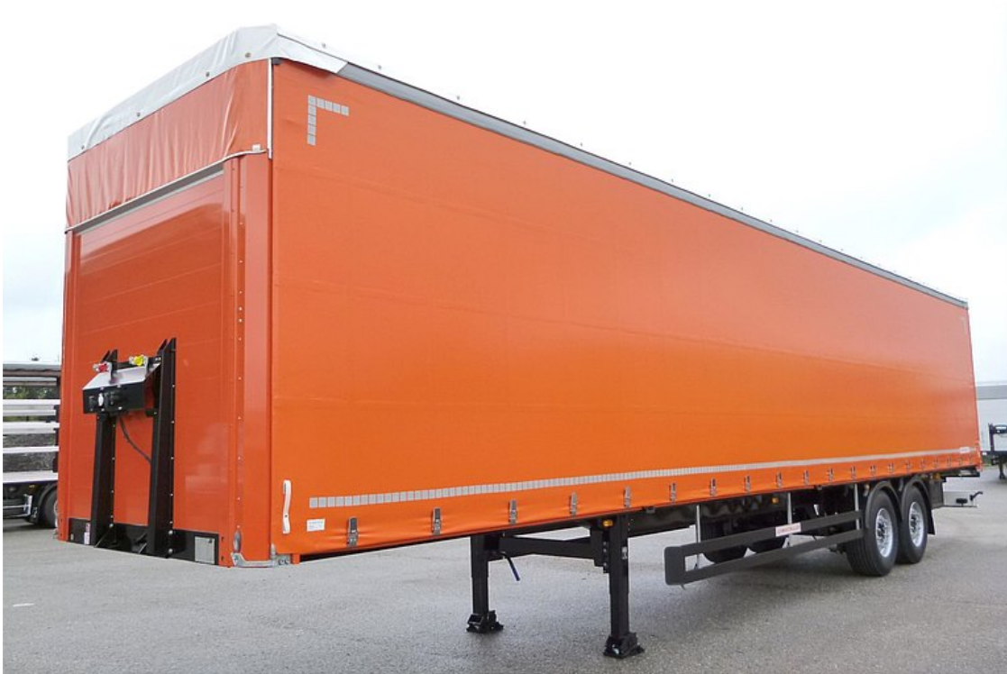
Low corrosion, high-quality aluminium body components, tested according to EN 13642 XL