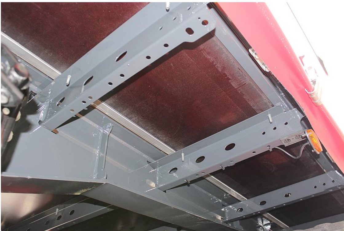
27-mm resin-coated panel floor, flush with external frame and with 2 steel top-hat profile rails above the side members (stacker axle load 7 t)