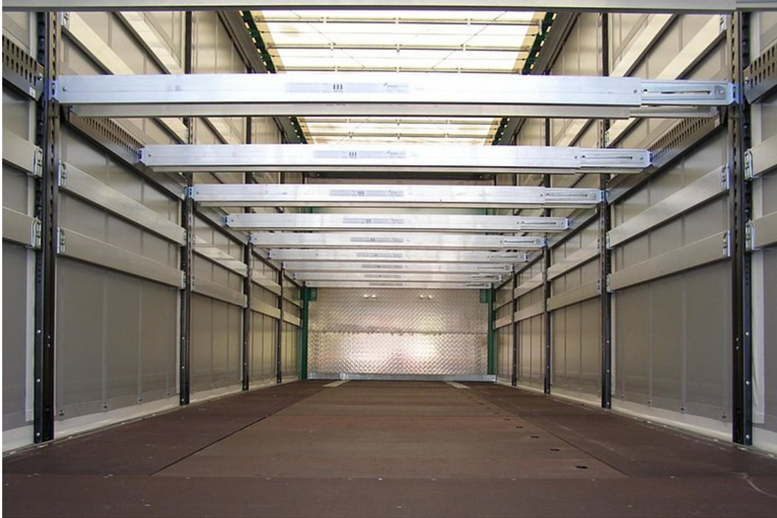
OPTIONAL: Twin-level loading system CTD III for 11 x 3 EURO pallets, load capacity: 400 kg/pallet