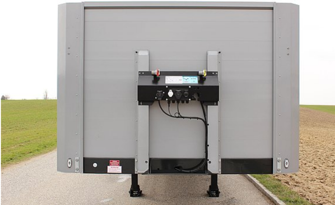
Fixed aluminium hollow profile front wall with 2 centre supports, inside with 2 lashing eyes for load securing and reinforced with steel sheet