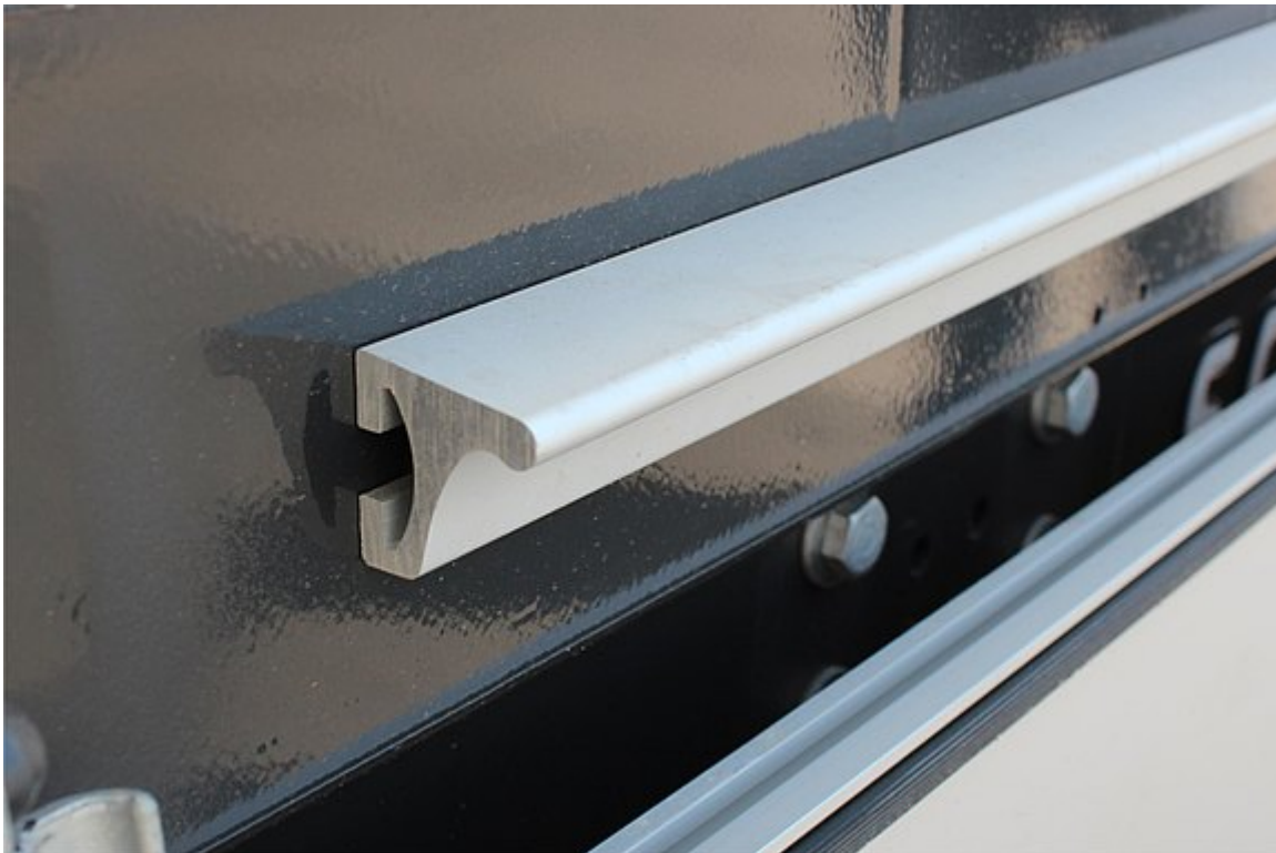
OPTIONAL: Anodised aluminium stacker protection strip, on both sides of the external frame