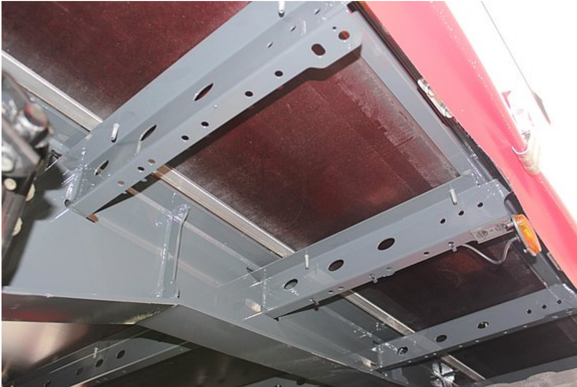
27-mm resin-coated panel floor, flush with external frame and with 2 steel top-hat profile rails above the side members (stacker axle load 7 t)