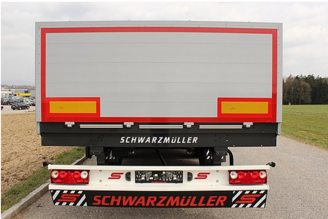
Foldable aluminium hollow profile rear wall, with rubber seals on the horizontal and vertical planes