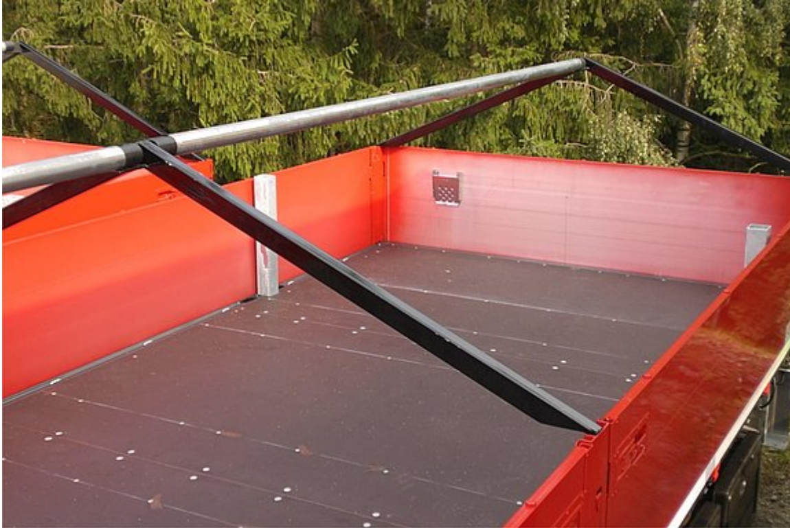
OPTIONAL: Cement cover - 4 roof arches directly inserted into the central and rear corner posts and 1 central row of roof planks (roof inclination 500 mm)