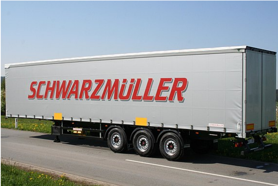
3-axle sliding tarpaulin platform semitrailer - coil - combined transport