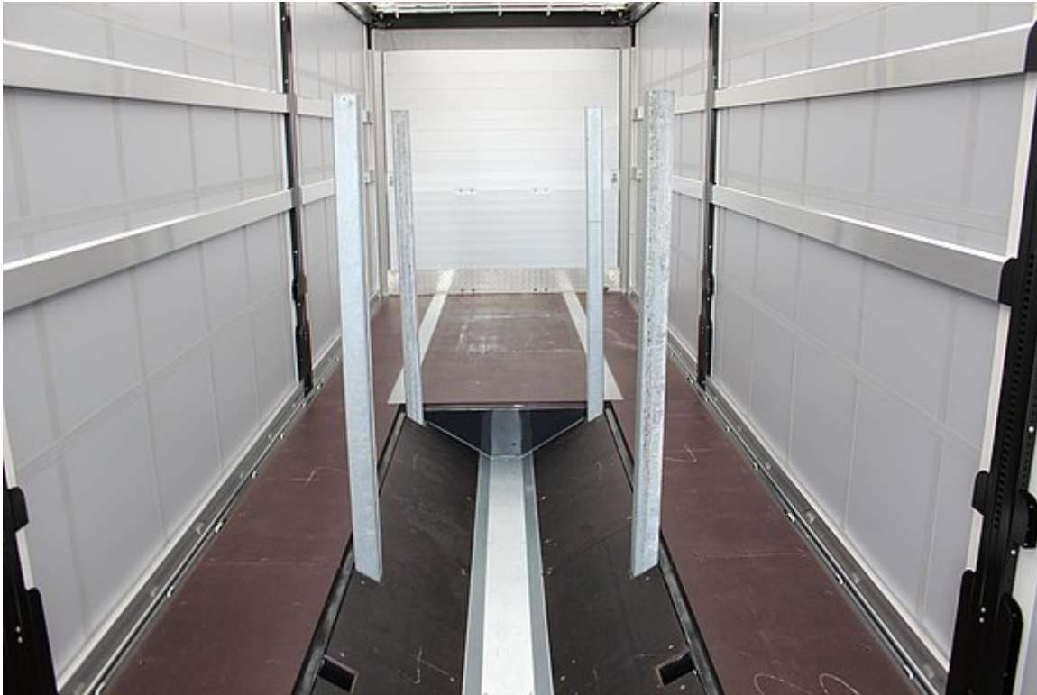
Coil recess with useful length of approx. 7,400 mm, with 5 pairs of integrated racks, for coil diameters up to 2,100 mm