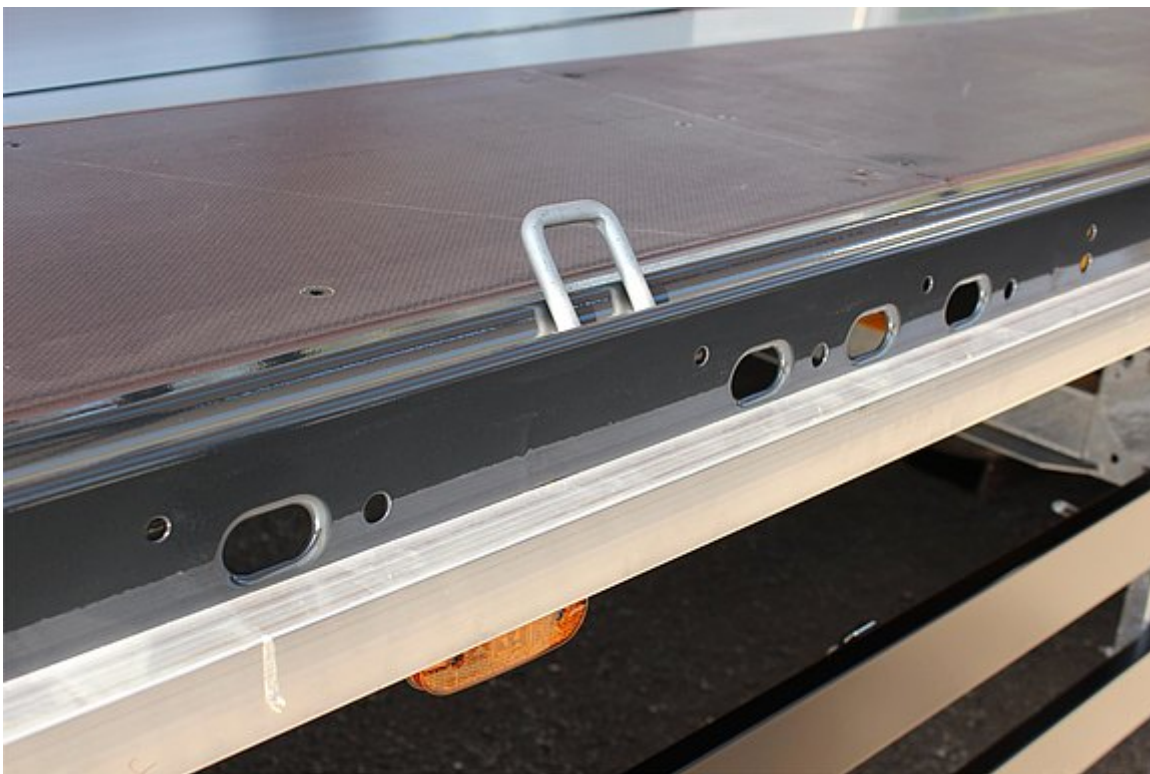
Perforated external frame (starting approx. 3,000 mm from front wall) with approx. 100 mm hole spacing, 40/25 mm slot according to DIN EN 12640 and 21 pairs of recessed 2.5 t lashing points/rings, and an additional 5 pairs of 4 t lashing points in the recess area on the external frame