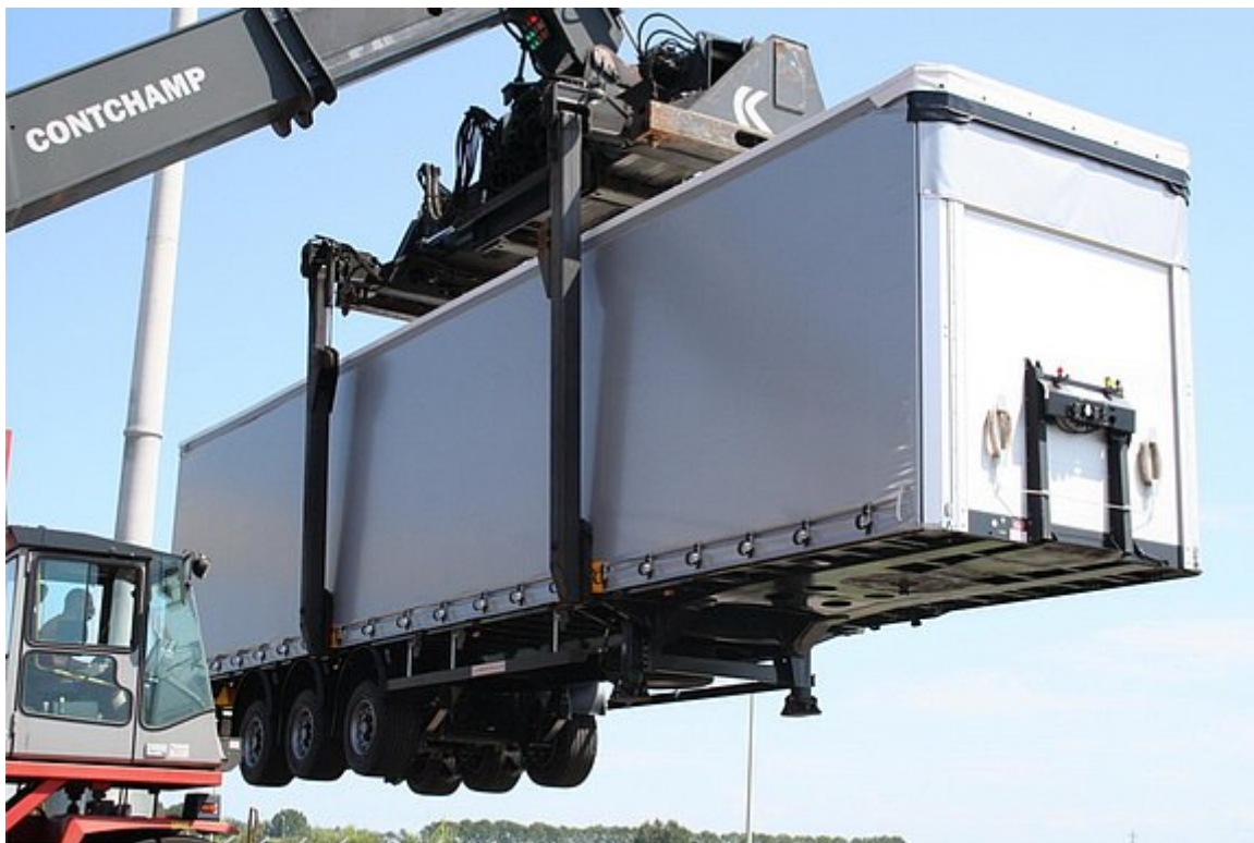
Loading example at the railway terminal