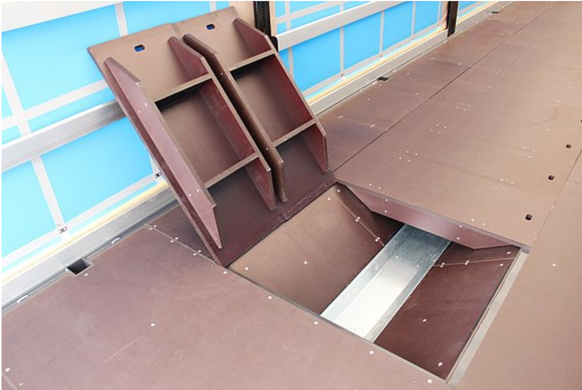
Stacker-bearing recess cover made from 27 mm resin-coated plywood with trussing