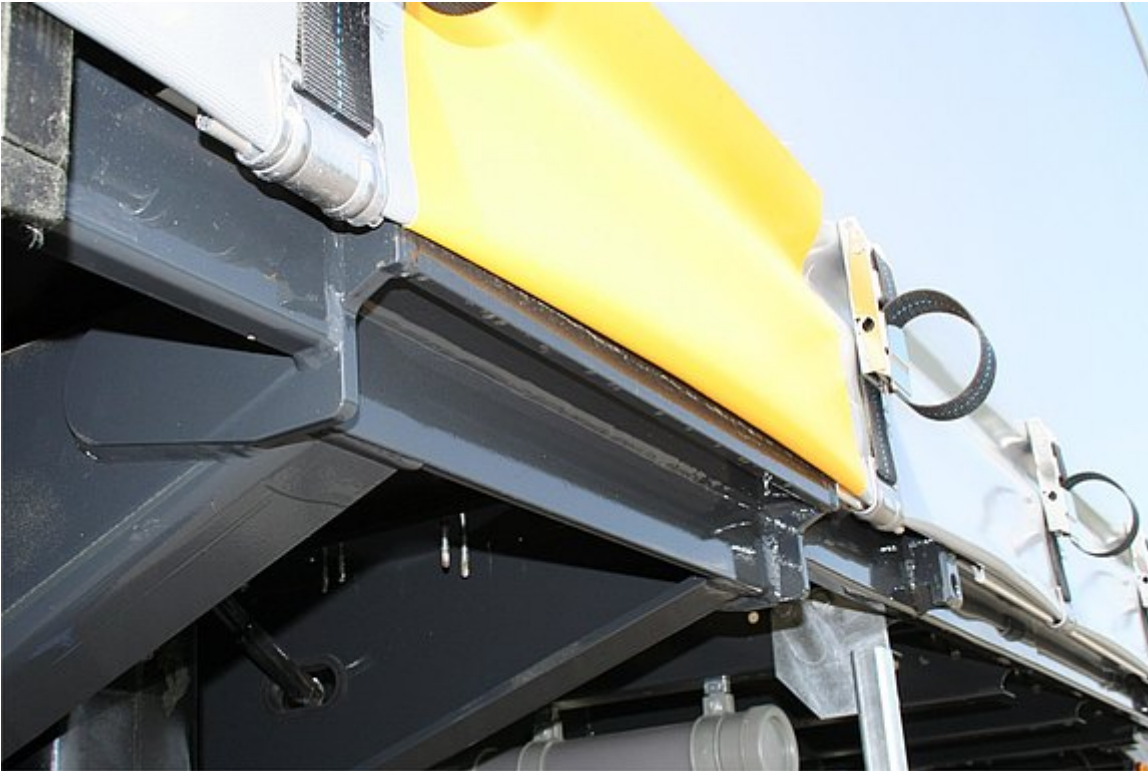
Reinforced frame construction with 4 grip edges for crane-based rail loading