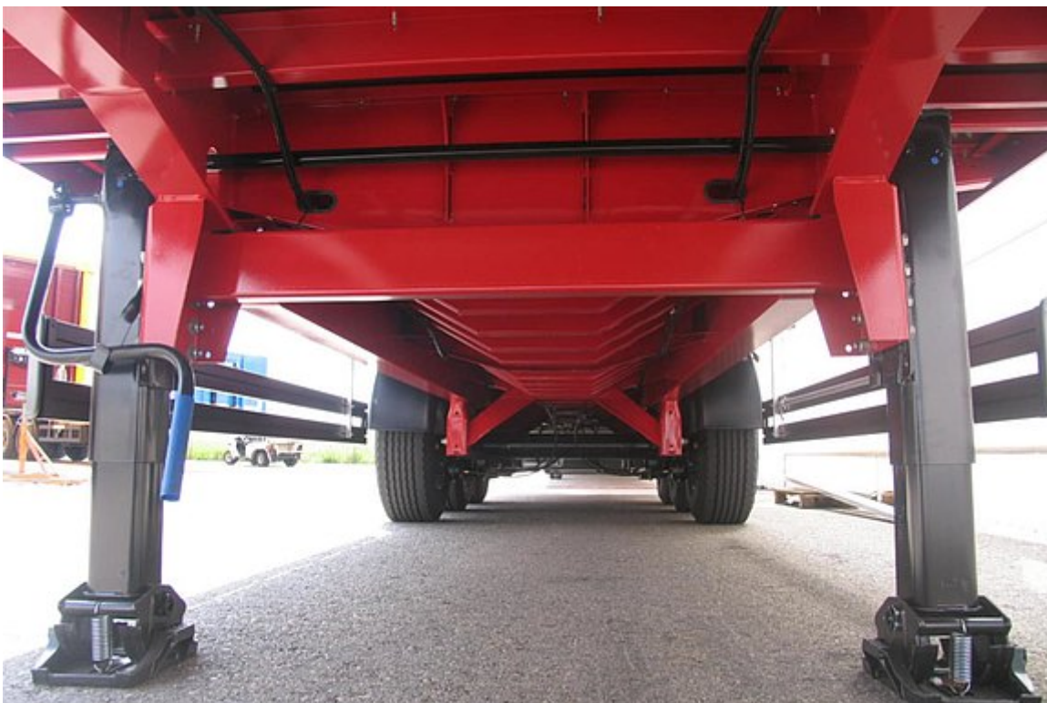
Reinforced frame construction for coil transports of 30 t at centre of gravity across minimum of 1,500 mm load length