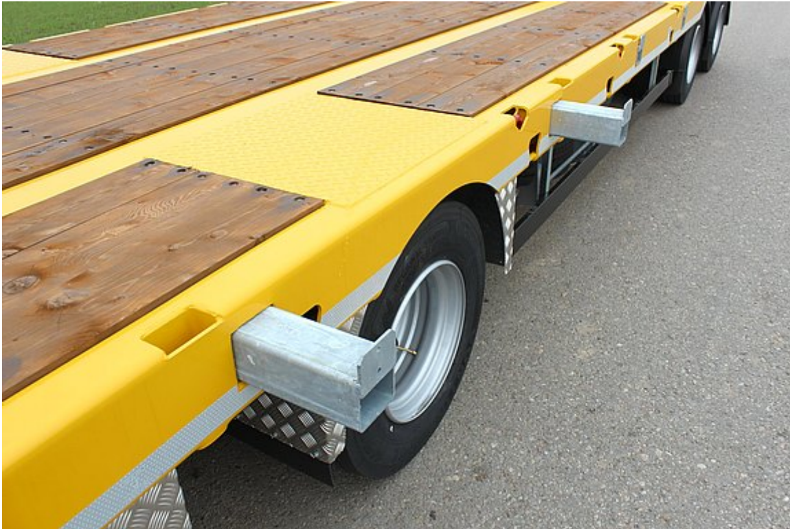
Pull-out extensions, on both sides of drop deck and rear taper, incl. extension planks for transporting wide loads