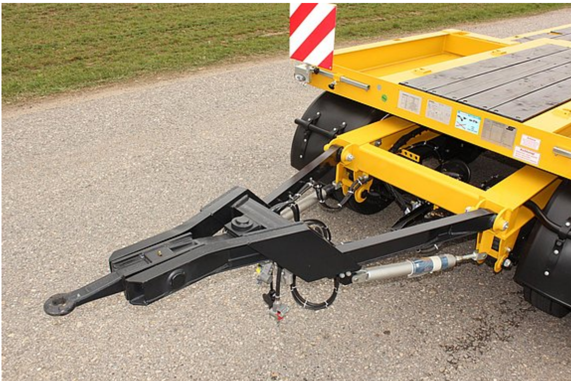
OPTIONAL: Offset drawbar with pivoting eye, 40 + 50 mm