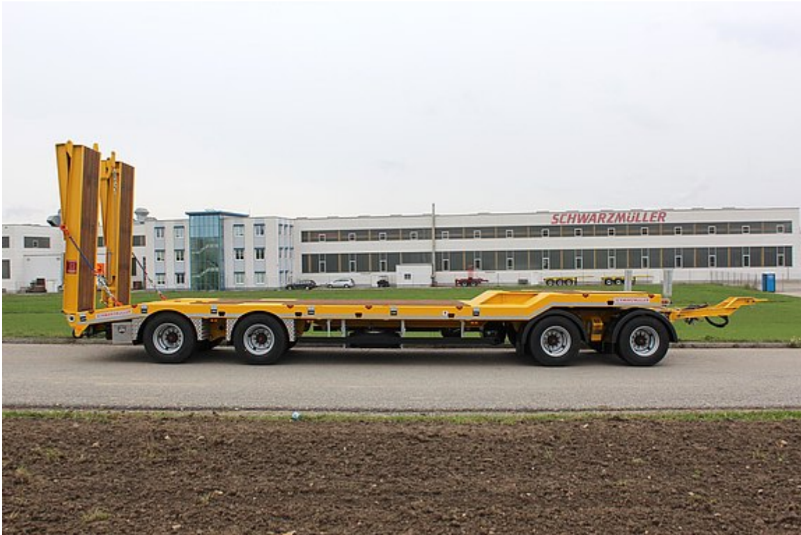
4-axle low loader trailer with offset platform