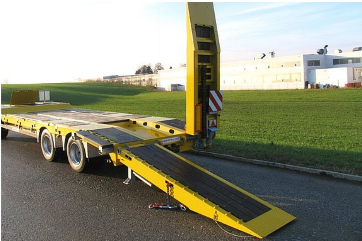
2 folding single-part loading ramps with hardwood flooring