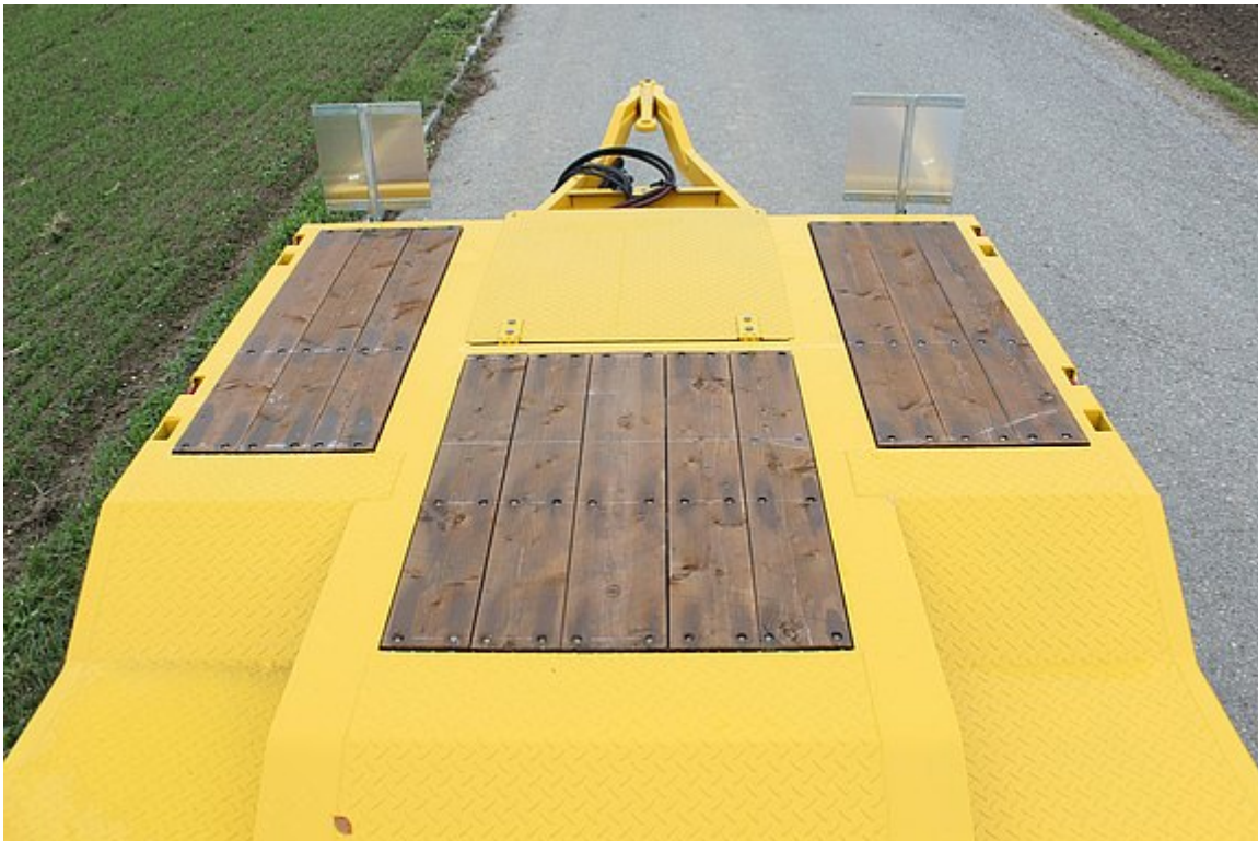
Raised platform at the front incl. offset frame, tapered corners