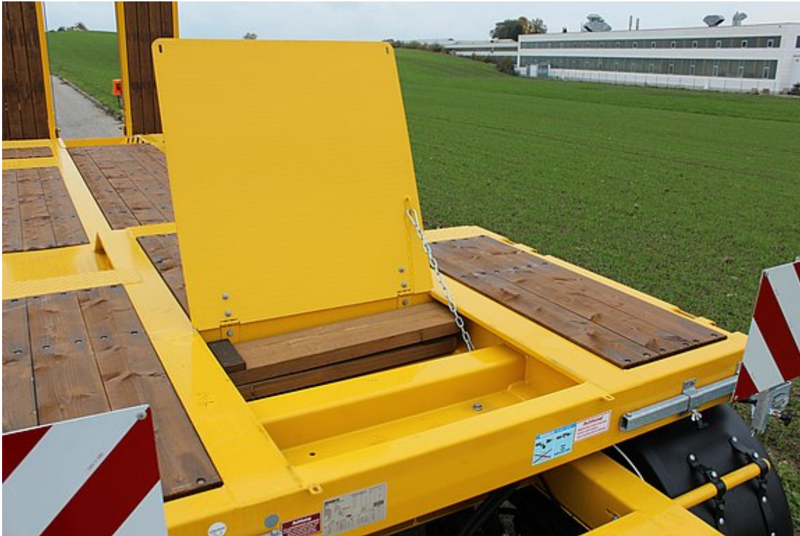
1 accessory compartment at front centre of raised platform, with folding lid