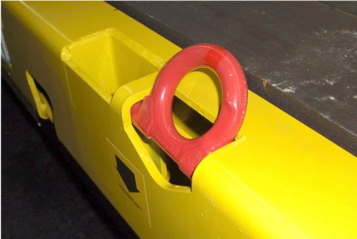
8 pairs of recessed foldable 10 t lashing rings in floor (6 in drop deck and 2 on raised platform)