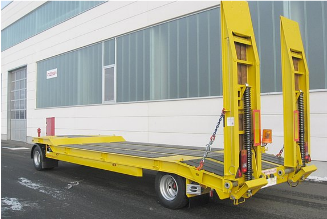
2-axle low loader trailer with offset platform