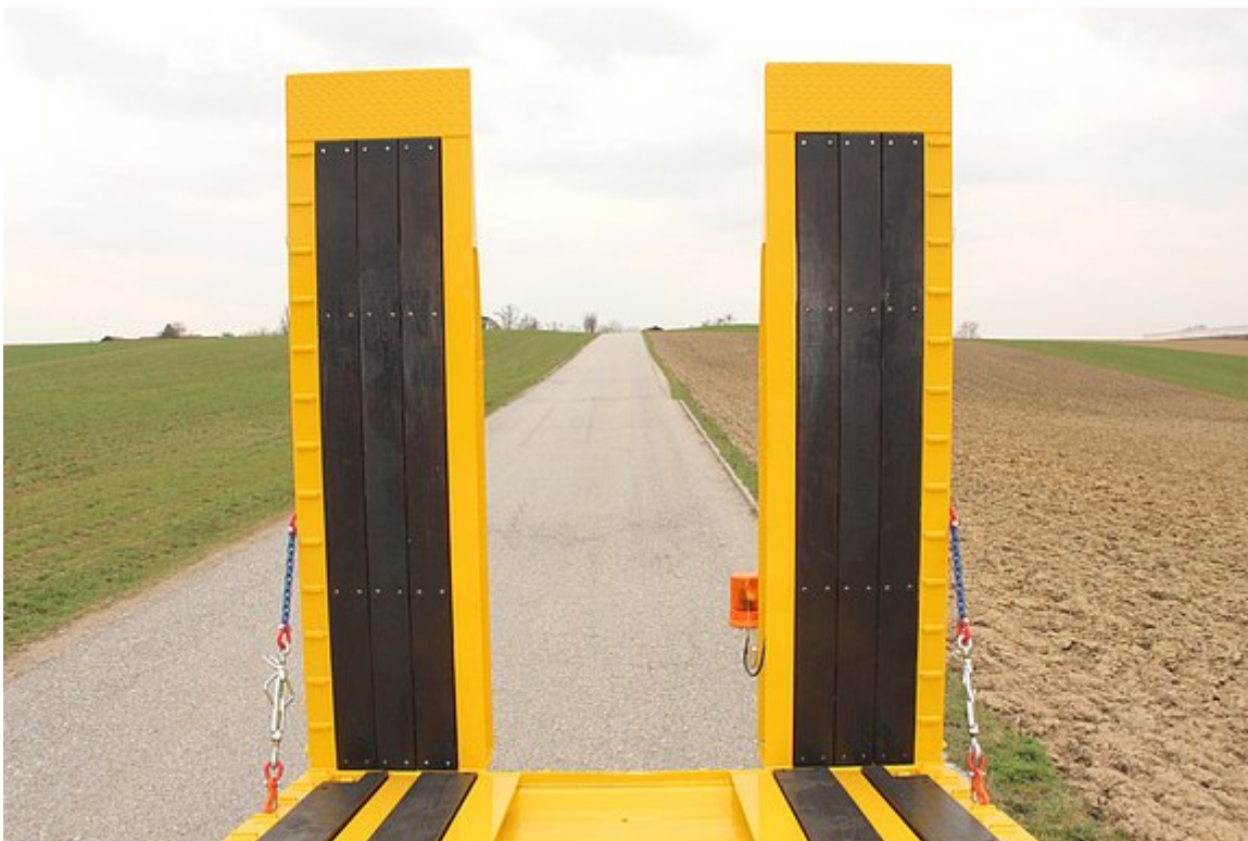
2 folding single-part loading ramps with hardwood flooring