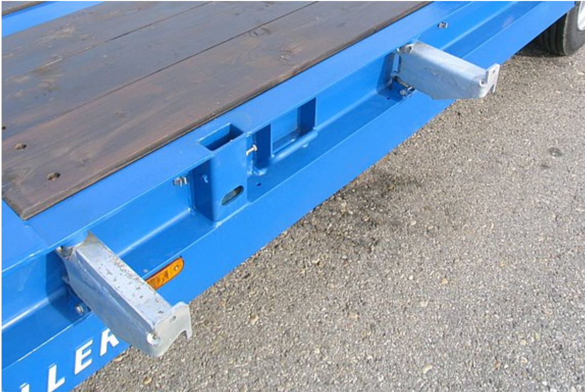
OPTIONAL: Foldable, pivoting extensions, incl. extension planks for transporting wide loads