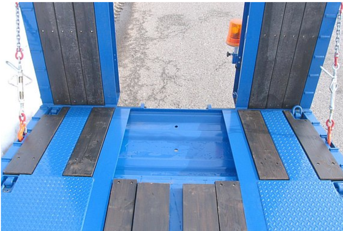
OPTIONAL: Excavator shovel recess between side members at rear