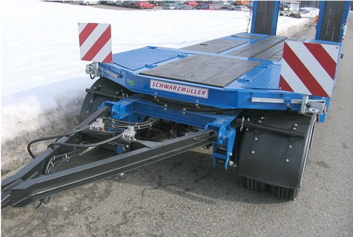
Bogie at front incl. drawbar - OPTIONAL: Pull-out warning signs for transporting wide loads