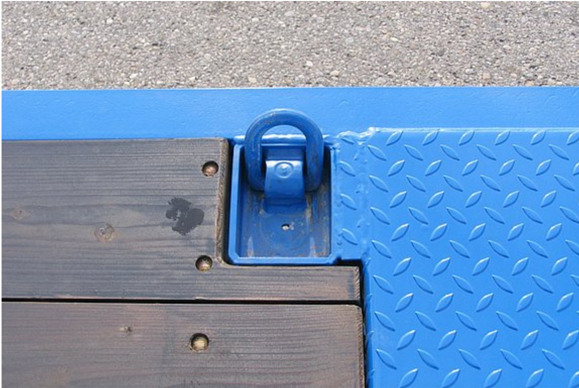
2 pairs of recessed, foldable lashing eyes on the platform