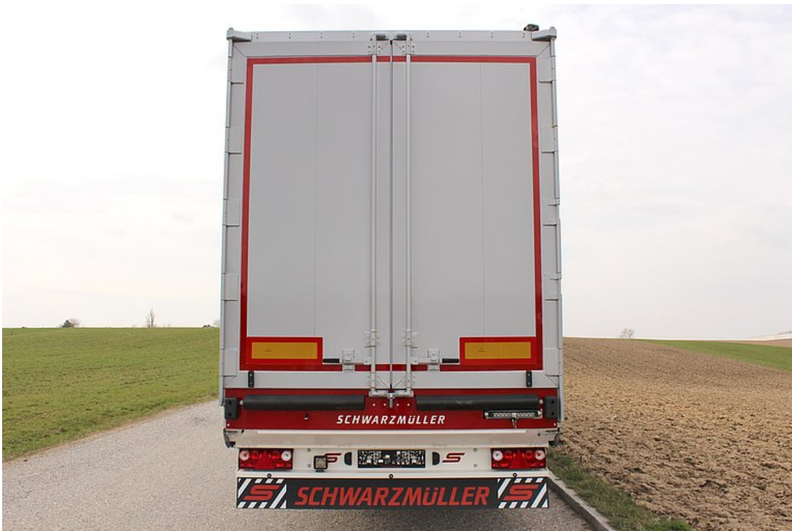
Rear wall = two-leaf door with one espagnolette on the outside of each door leaf and additional pneumatically operated safety lock