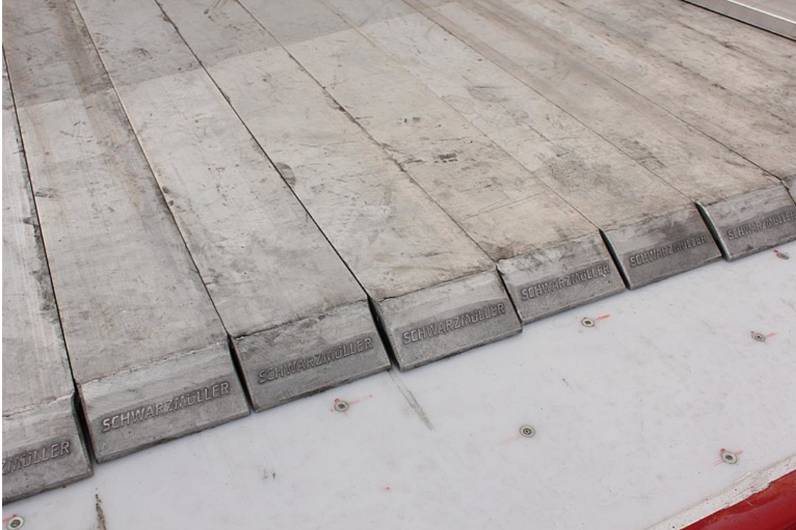
Cargo Floor sliding floor, hydraulic movement with 21 floor profiles for loading and unloading