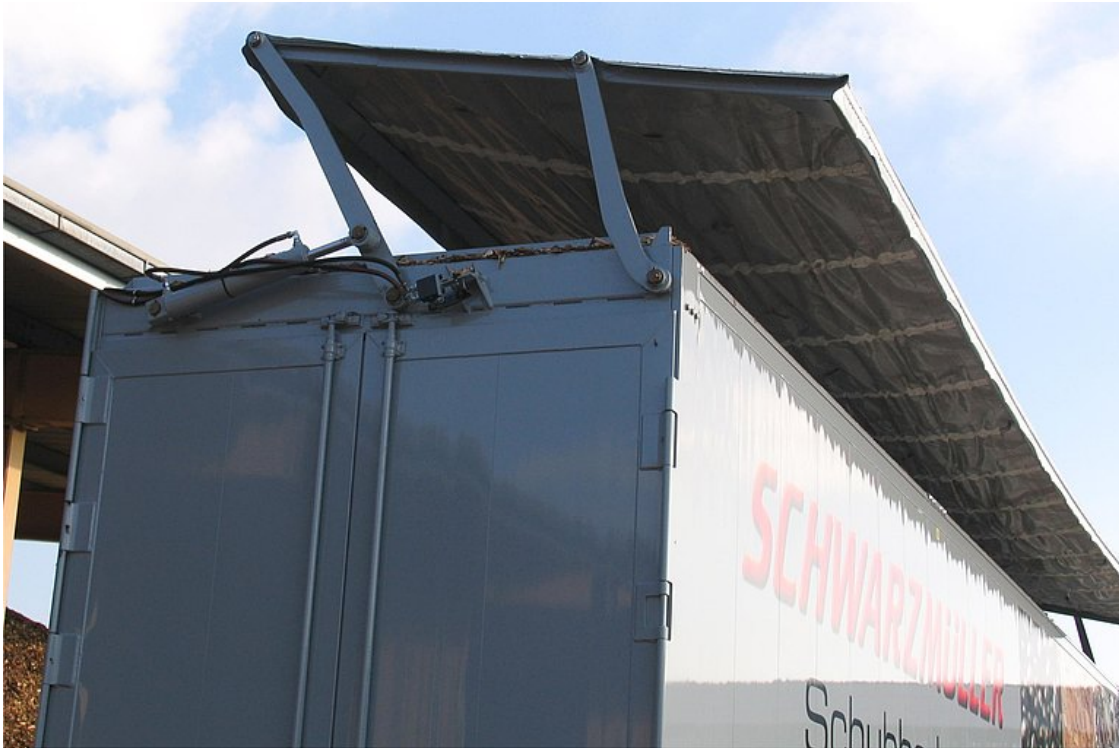
OPTIONAL: Hydraulic folding roof with all-round frame and plastic tarpaulin