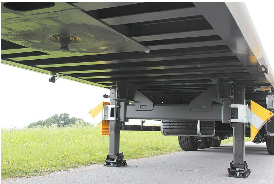
Aluminium lightweight design and therefore a payload advantage of up to 500 kg