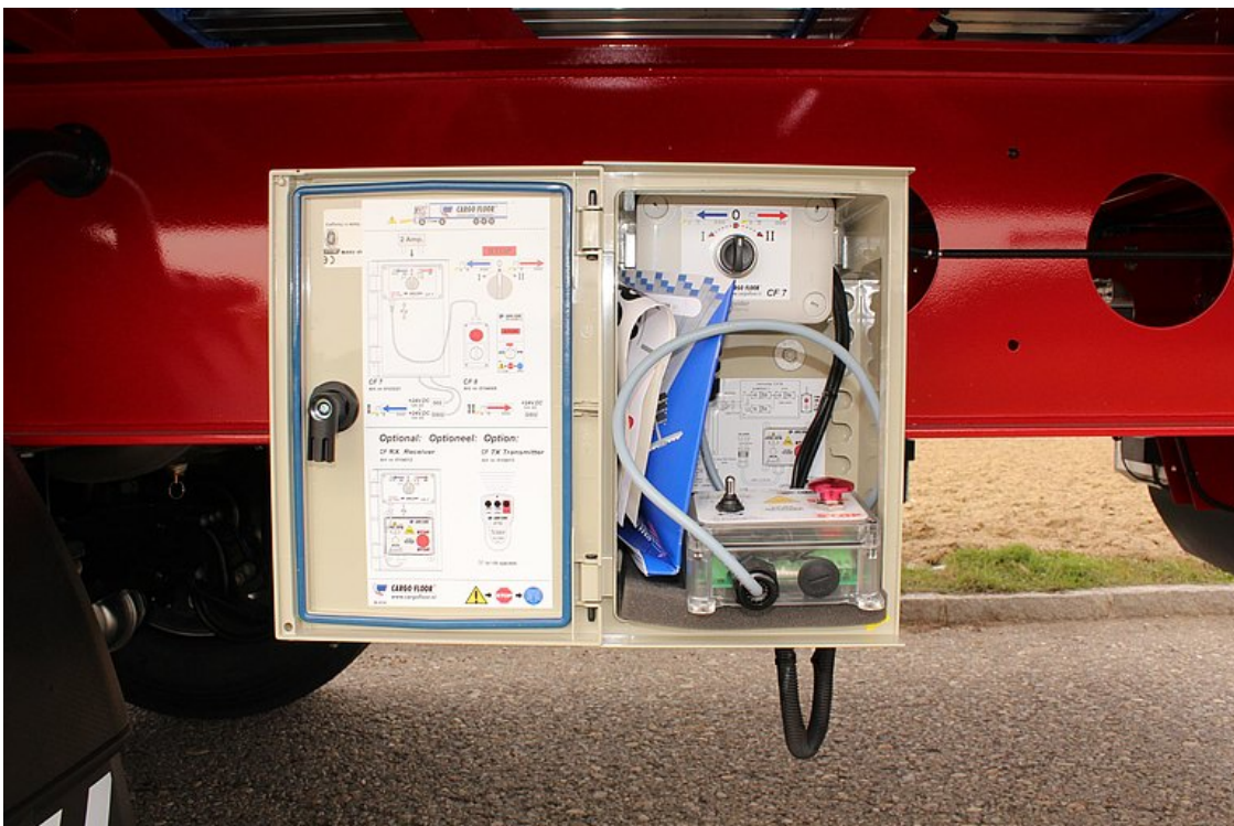
Floor control unit housed in waterproof box, incl. remote control with 10 m cable