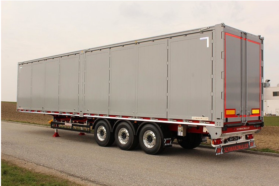
3-axle sliding floor semitrailer with side doors