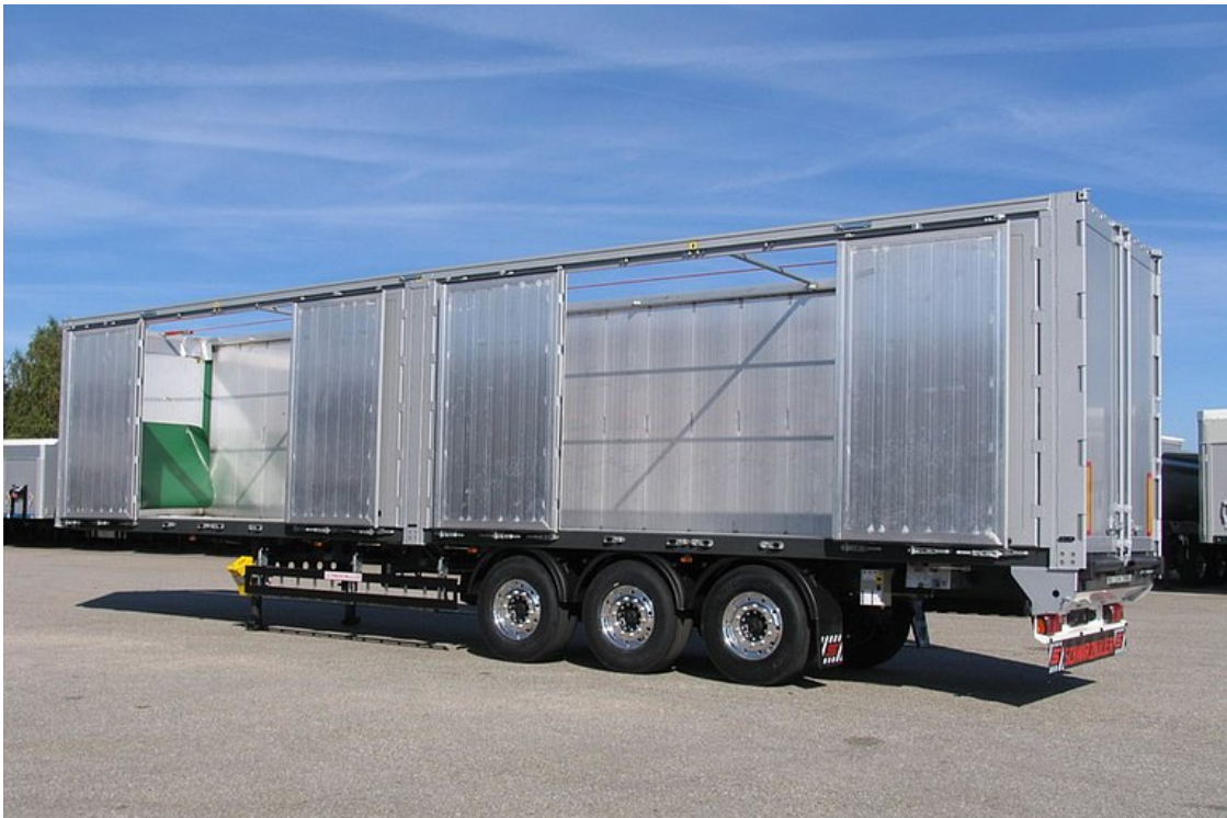
Left side with 2 4-leaf doors, for (un)loading on the side