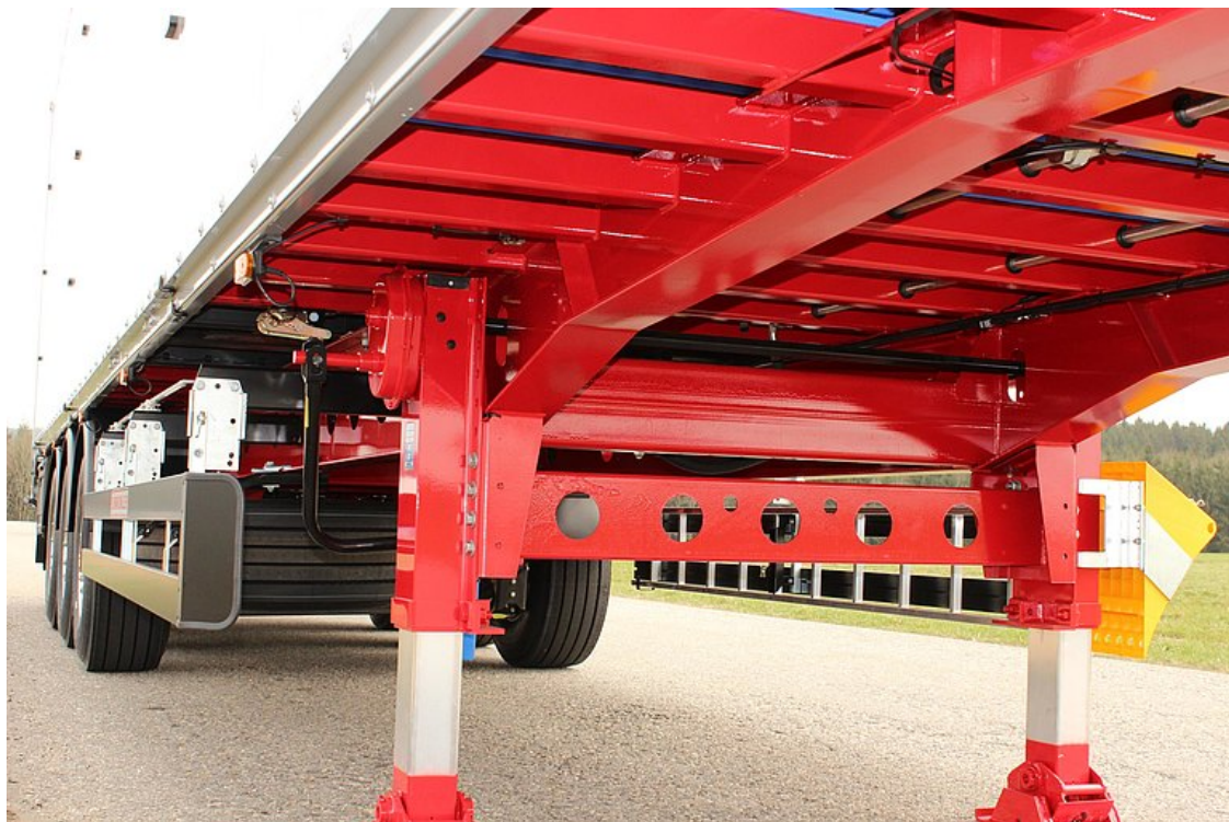
Torsionally rigid, continuous steel frame construction