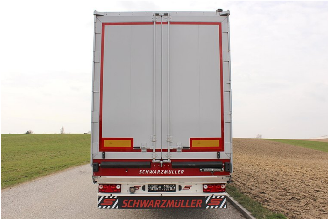
Rear wall = two-leaf door with one espagnolette on the outside of each door leaf and additional pneumatically operated safety lock