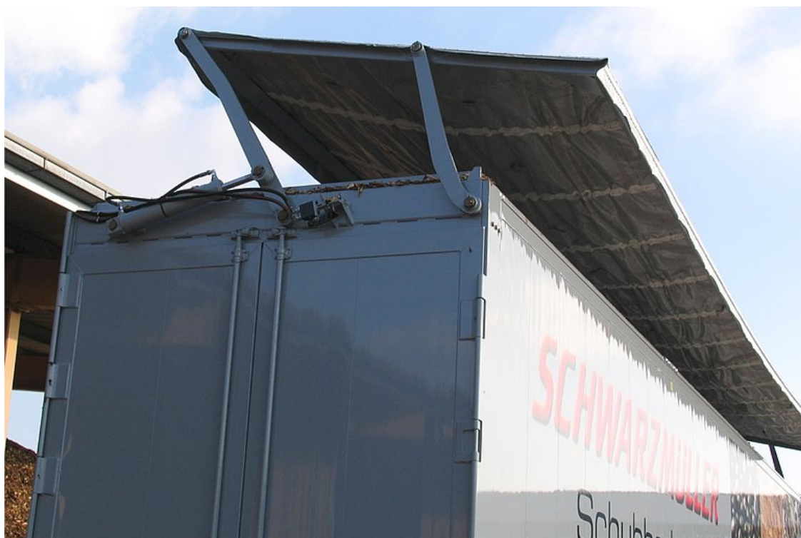
OPTIONAL: Hydraulic folding roof with all-round frame and plastic tarpaulin