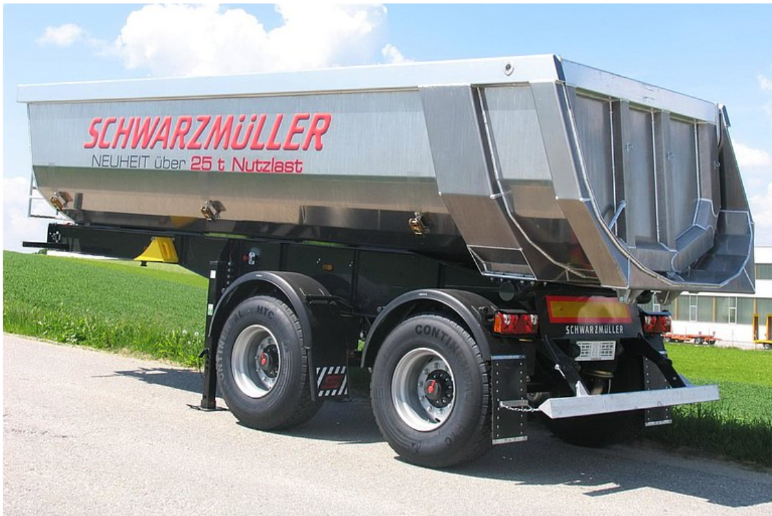
2-axle aluminium segment tipper semitrailer - wheelbase 1,810 mm