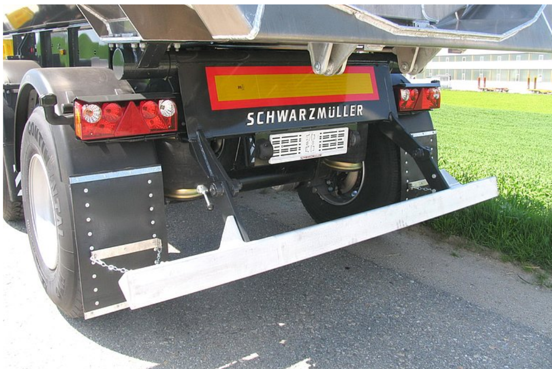
Foldable aluminium trapezoidal underride protection