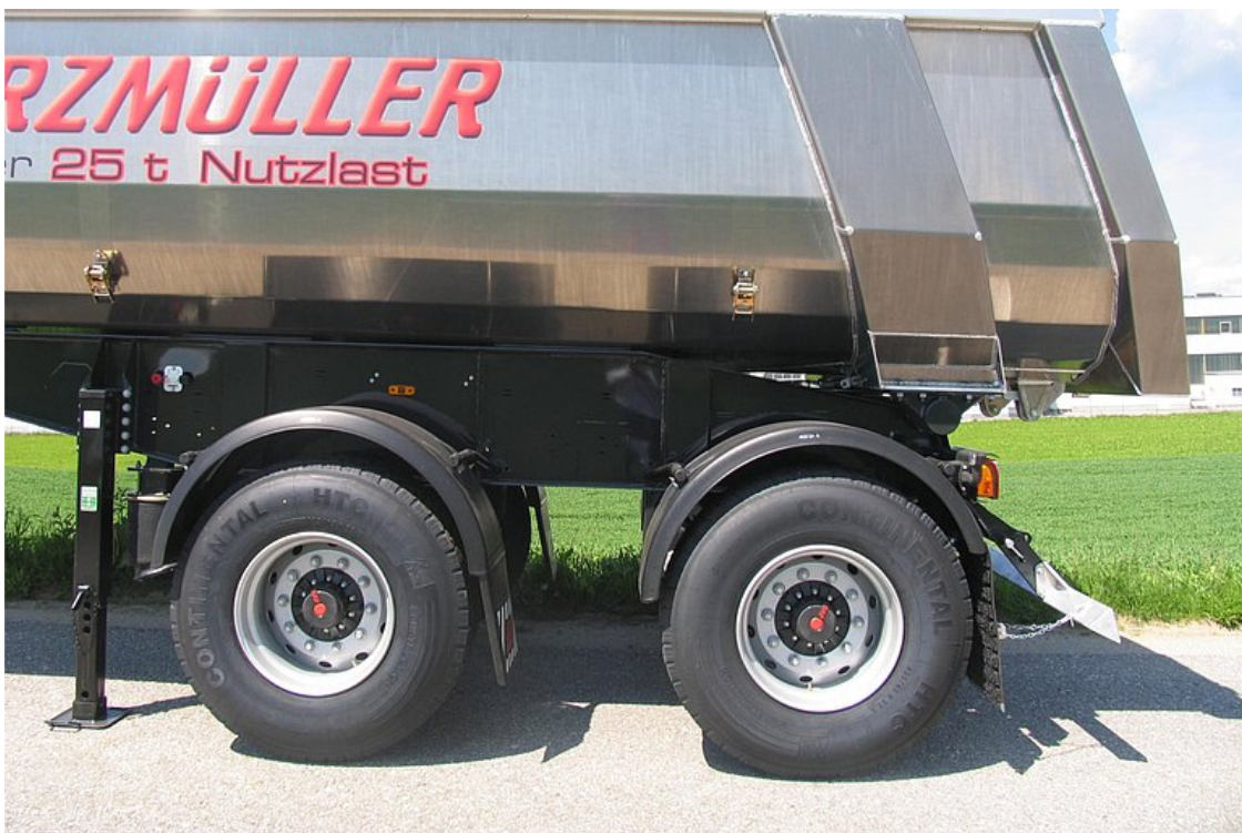
Axles with a wheelbase of 1,810 mm