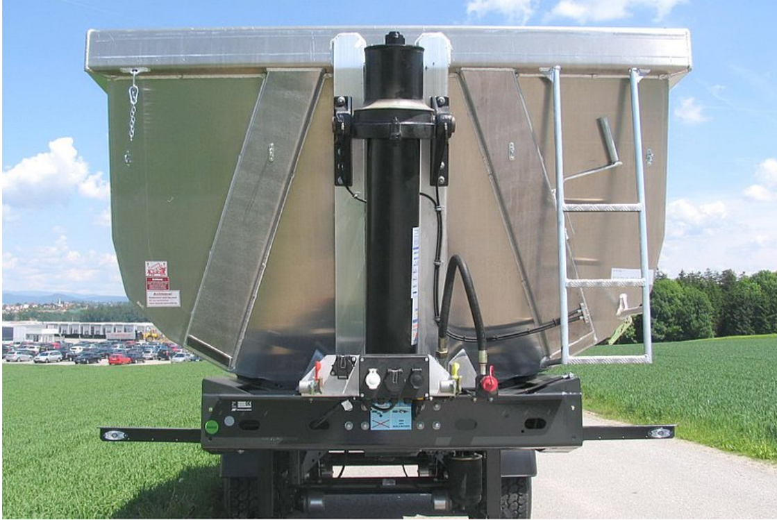
Inclined front wall with hard chrome-plated, high-grade front tilt cylinder