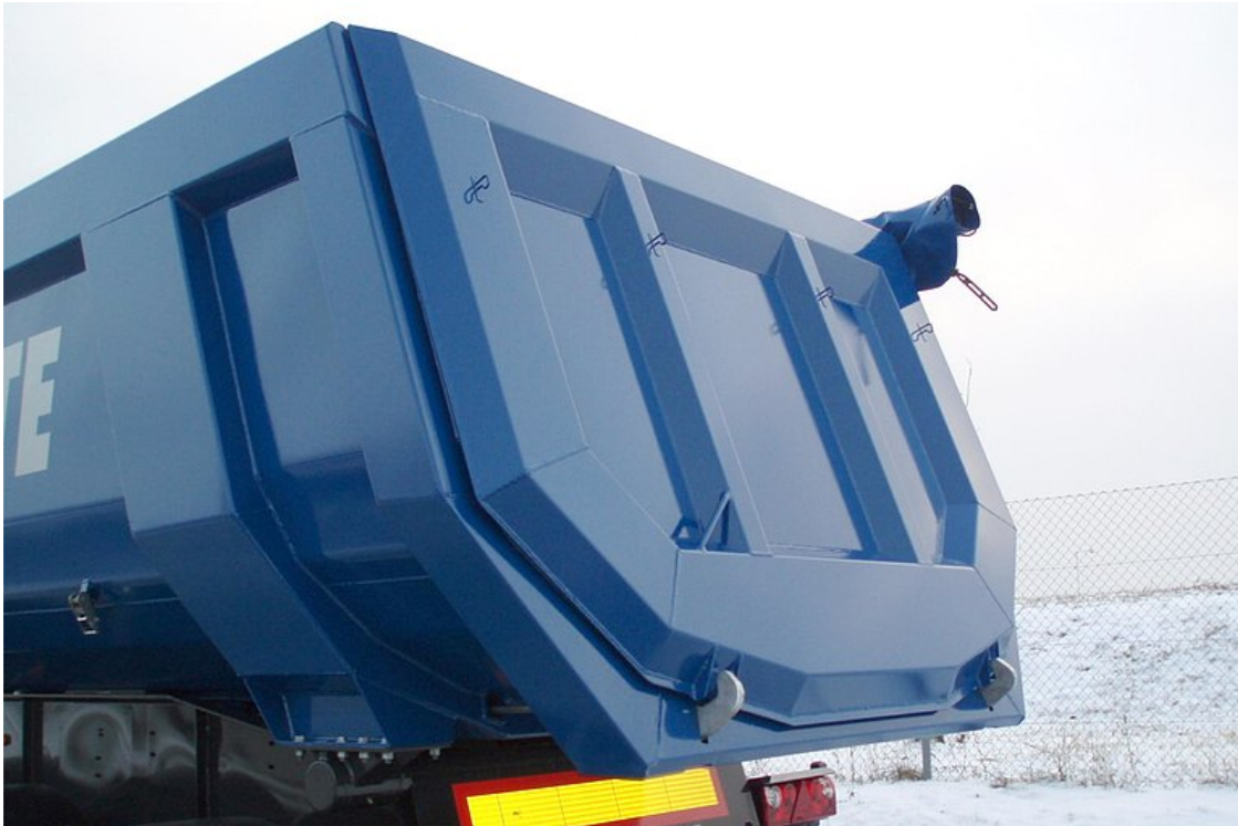
OPTIONAL: External rear wall for higher load volume