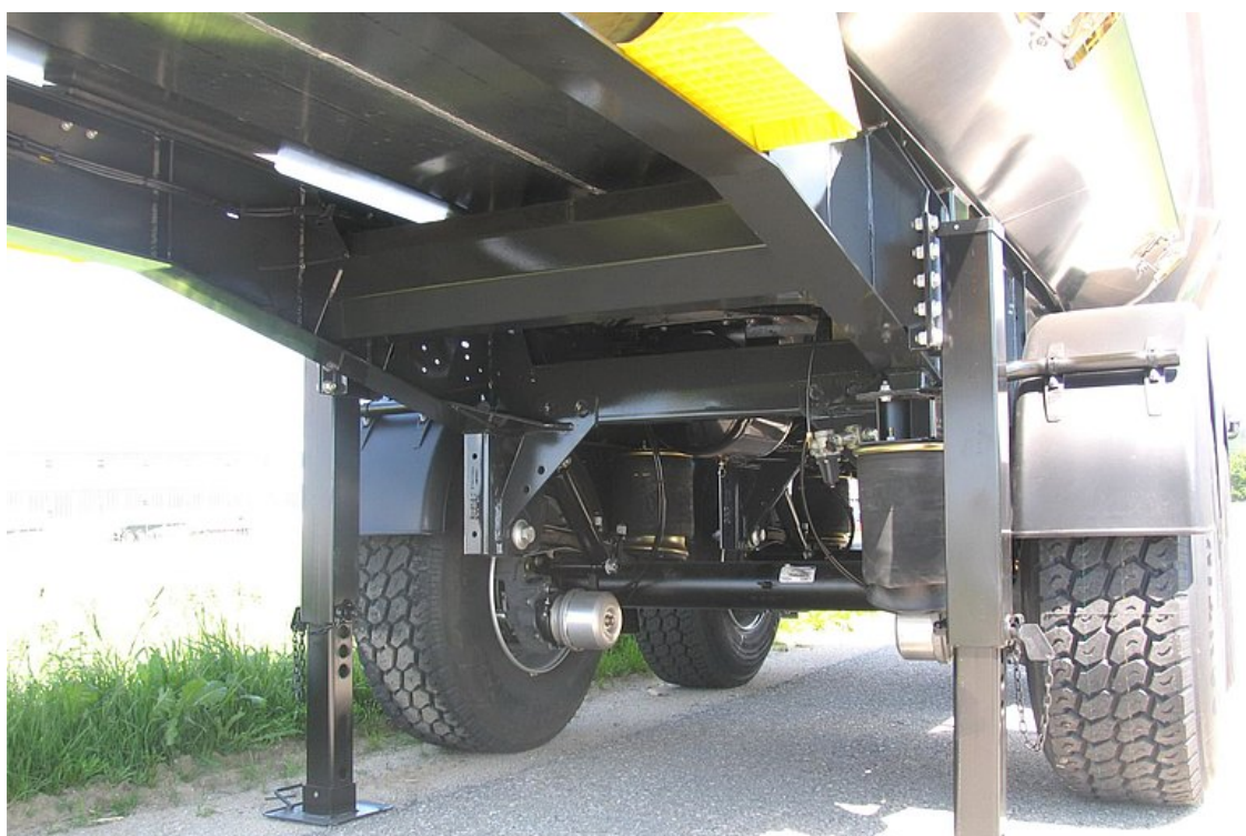
Stable and torsionally rigid chassis design with additional torsion tubes