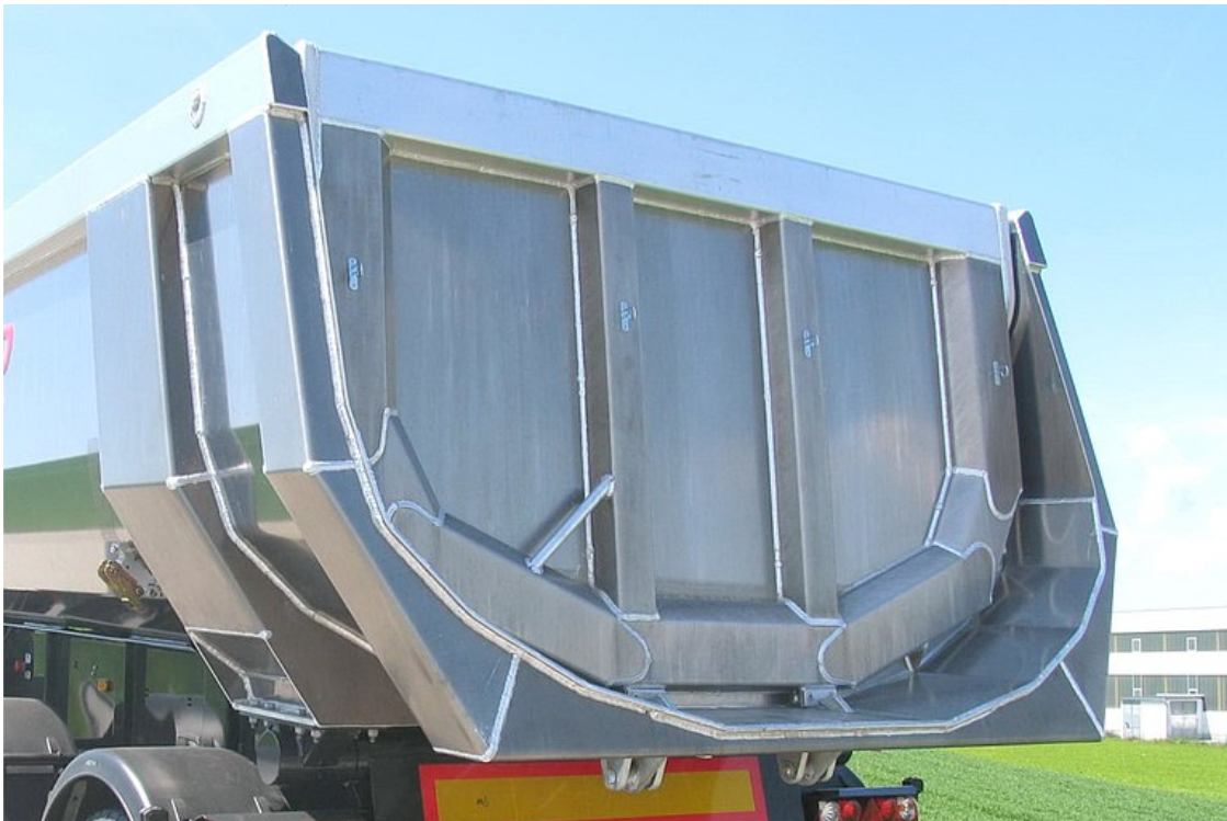
Rear wall = hinged wall with recessed bearing and autom. mech. dual-hook central locking