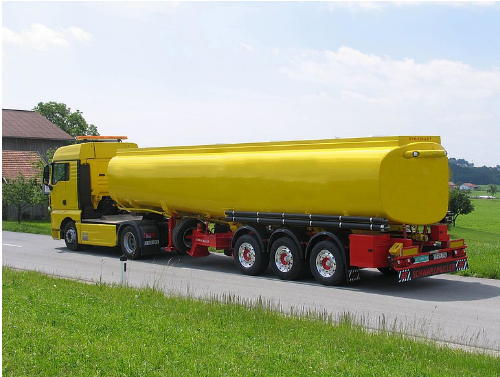
Modern design and maximum vehicle functionality