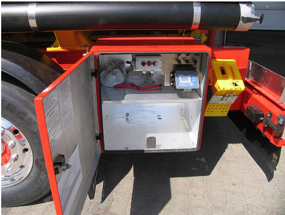
Accessories box with side-opening door offers plenty of storage space