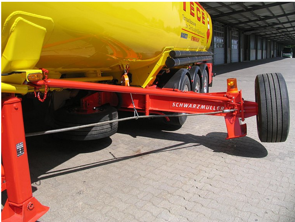
Arm with anti-kink device including anti-kink cables and revolving beacon on the left in the direction of travel