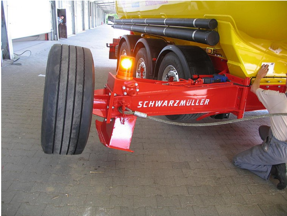
Arm with anti-kink device including anti-kink cables and revolving beacon on the right in the direction of travel