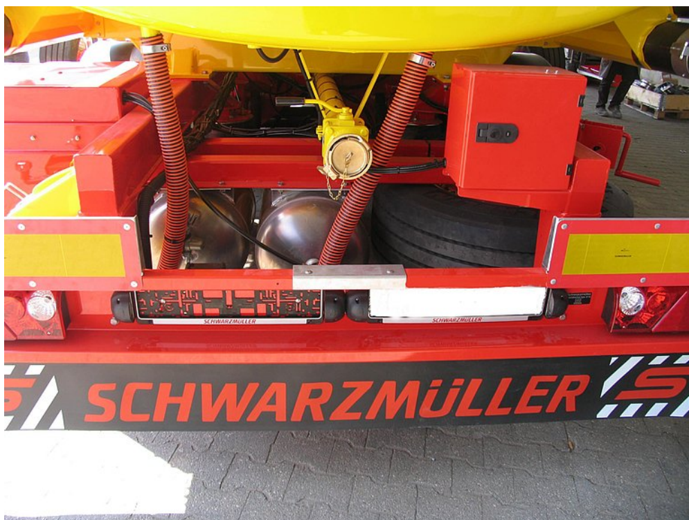
OPTIONAL: Aluminium bumper