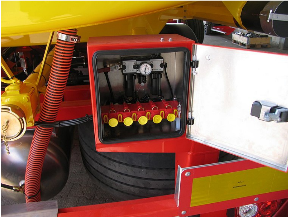
Box for pneumatic valve control to protect valves