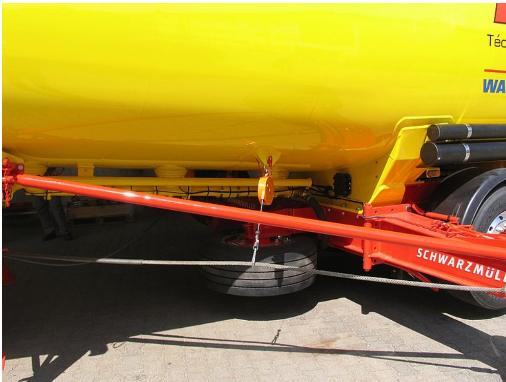
Anti-kink cables around the arm support towards the tank