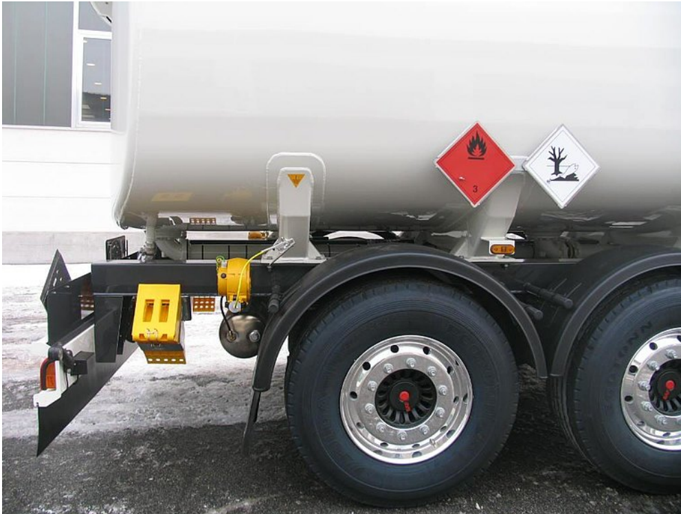
Ideal arrangement of equipment