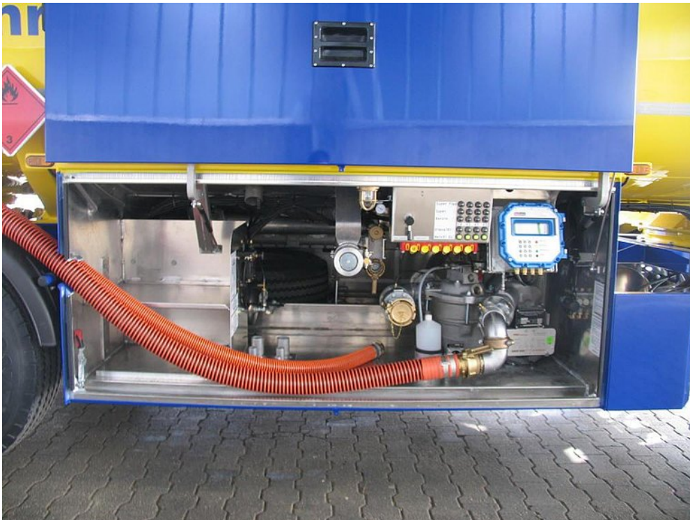
Structured and clear arrangement of fittings for efficient and fault-free operation