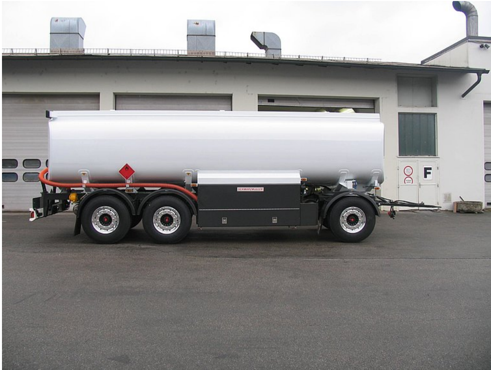
Modern design and maximum vehicle functionality