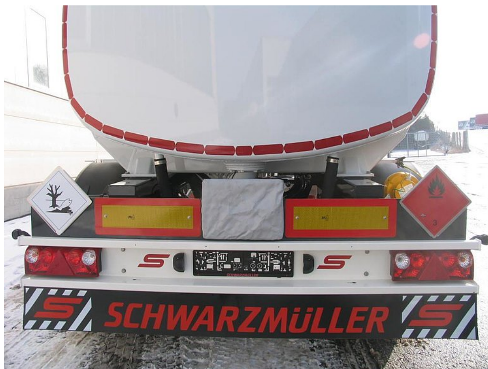
OPTIONAL: Choice of aluminium or steel bumper