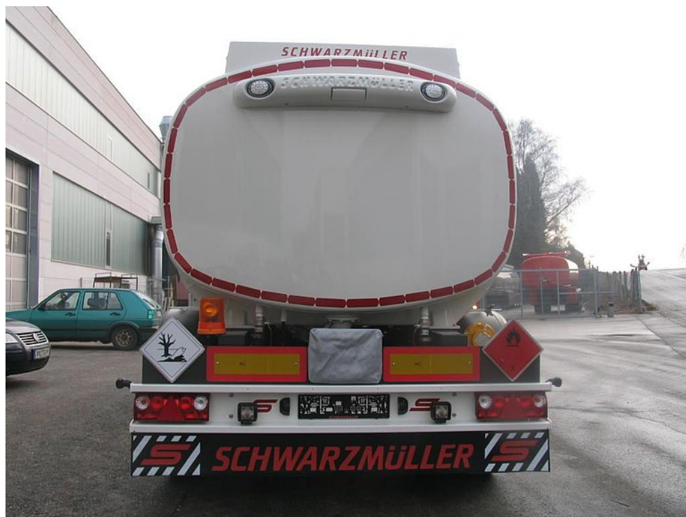
OPTIONAL: High-set LED light holder with optional integration of reversing camera