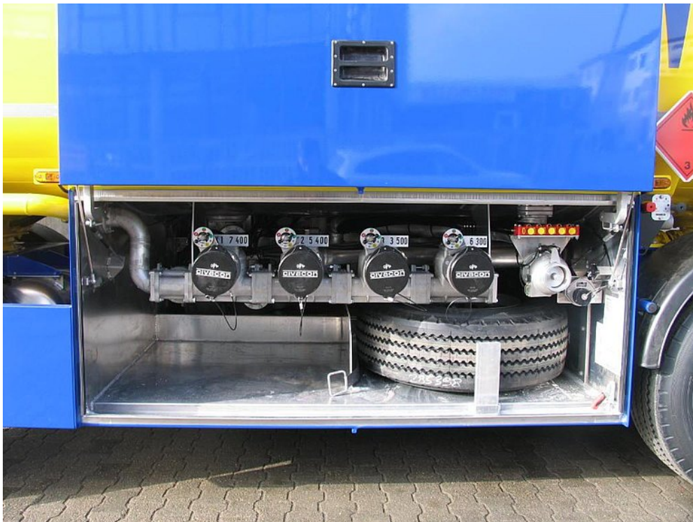
Fittings cabinet with parallel sliding cabinet doors and storage option for spare wheel