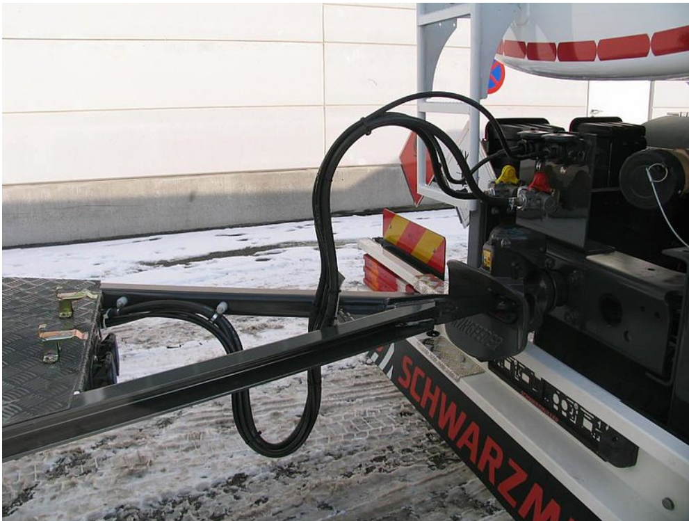
Drawbar with connection cables to the truck