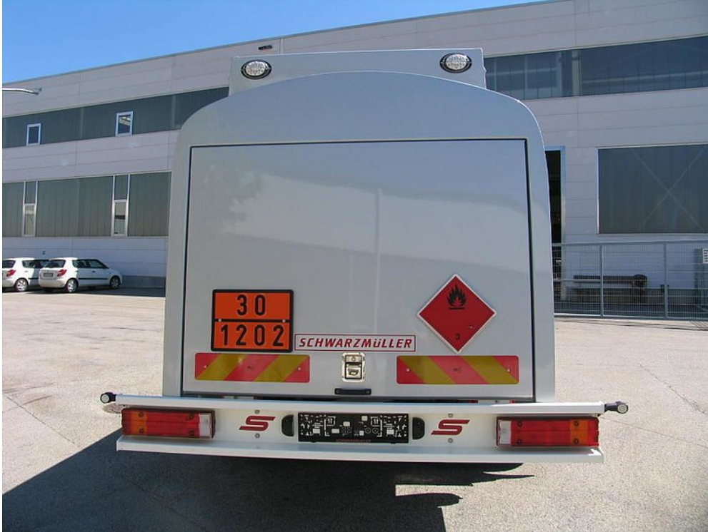
OPTIONAL: 2 high-set tail lights recessed in rear cabinet