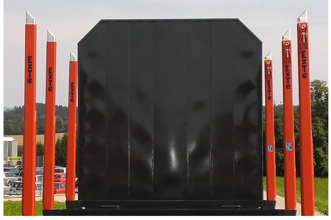
OPTIONAL: Extra-strong steel profile front wall, approx. 2,500 mm high with centre supports