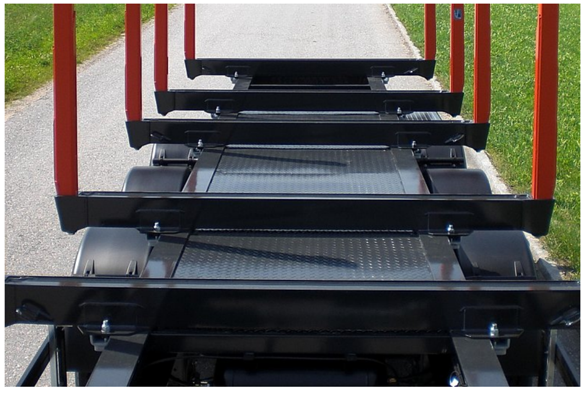
Chequered steel plate cover between frame side members over the chassis and at the front