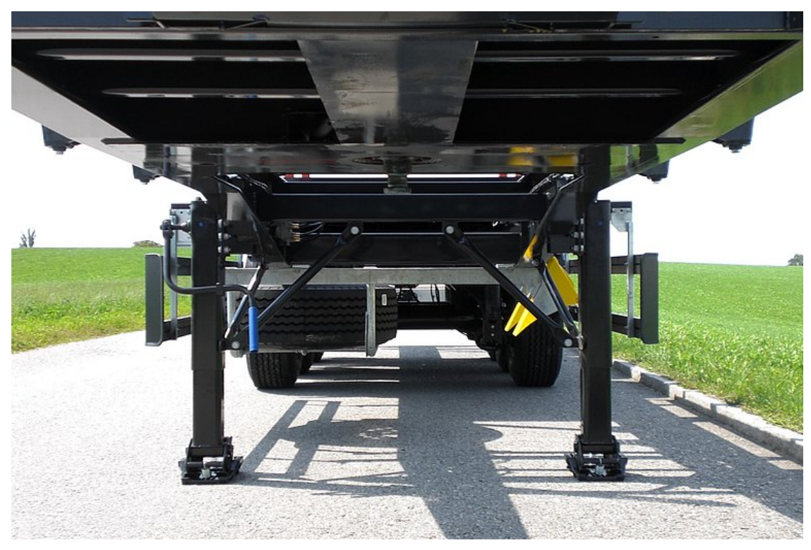
Lightweight frame made from special high-strength NAXTRA steel provides payload advantage of up to 500 kg