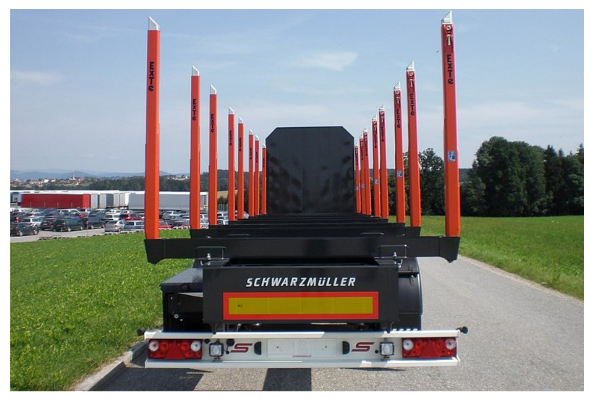
Rear closing element incl. fitted aluminium underride protection