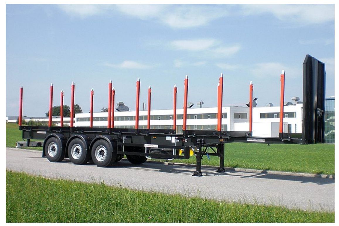
3-axle stanchion semitrailer - without platform