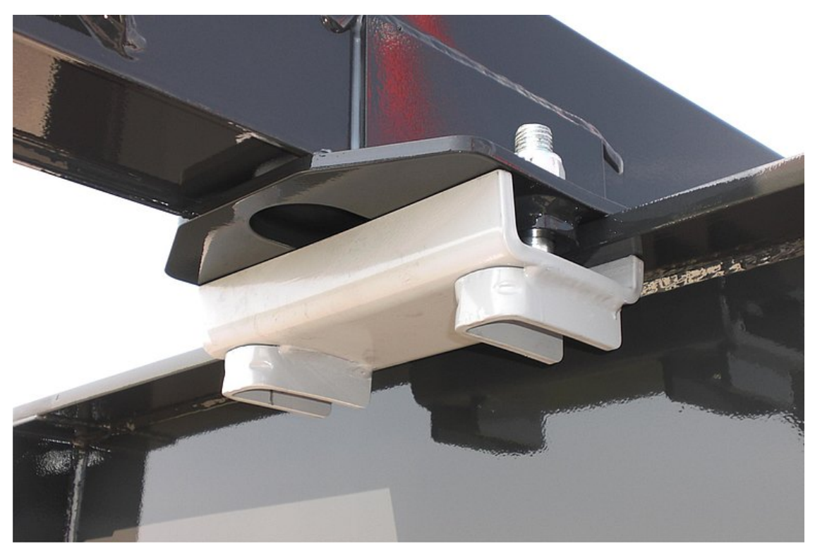
Stanchions mounted via welded clamps = can be moved