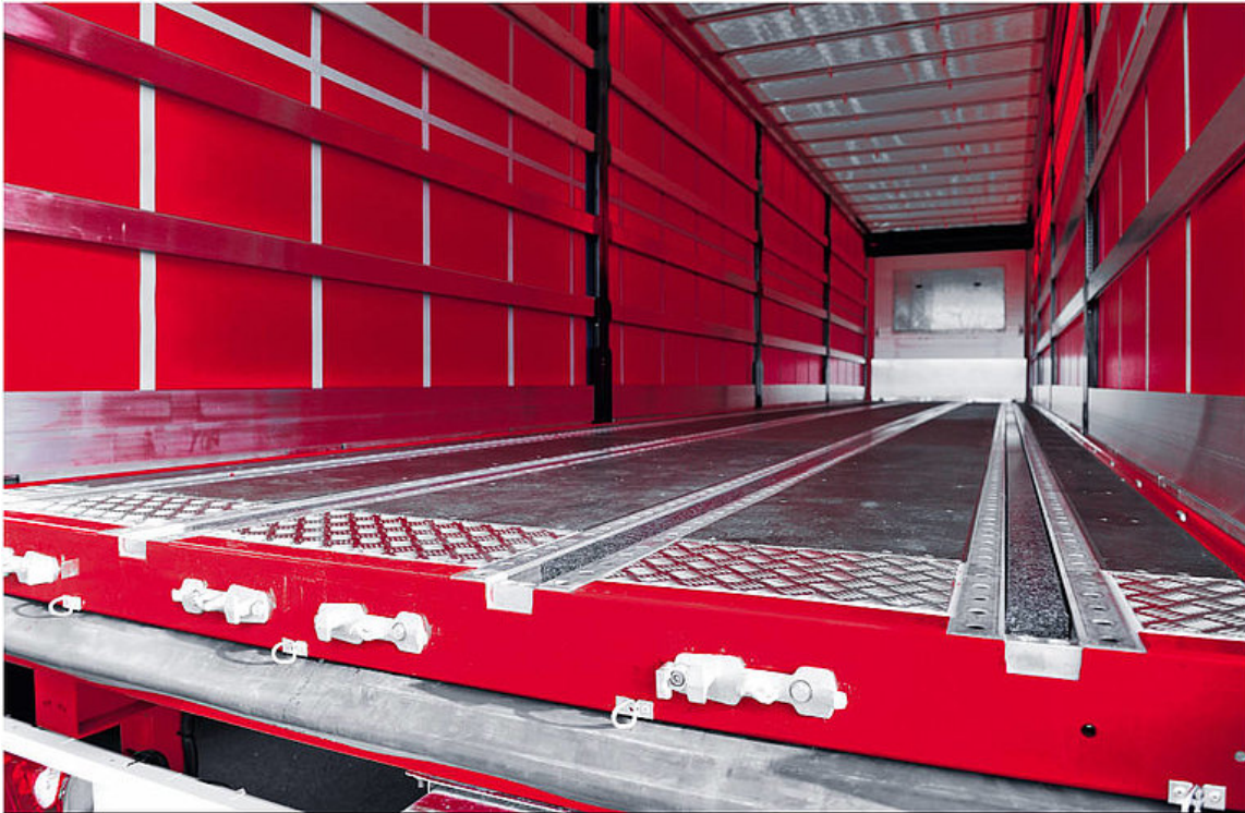
OPTIONAL: Inserts for Joloda rails: In general cargo use, the rails are covered or filled with plastic profile inserts.