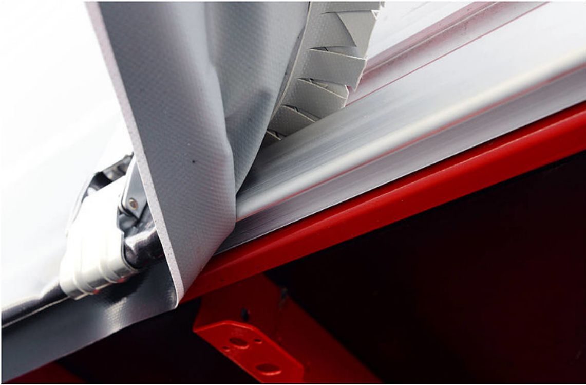
Tarpaulin hooking rack: Vertically attaches the side tarpaulin to the outer frame. Ensures a perfect connection without the tensioners standing aslant.