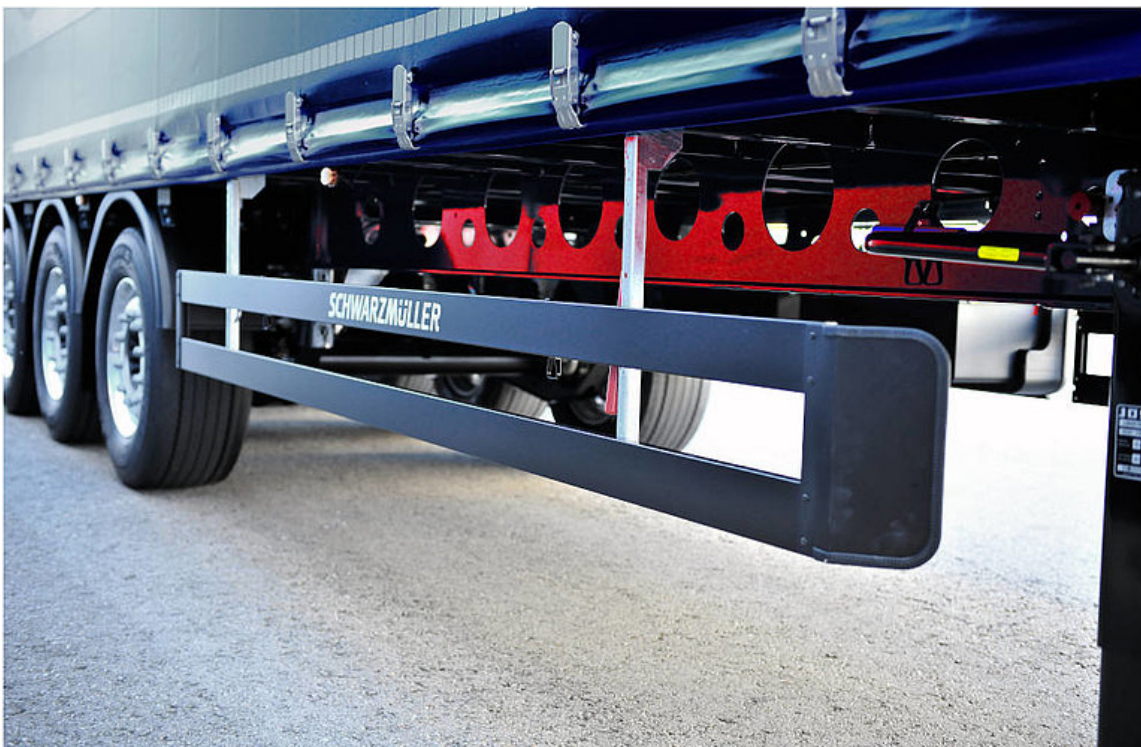
Side impact protection: Statutory cyclist protection to prevent persons from falling down in front of the wheels.