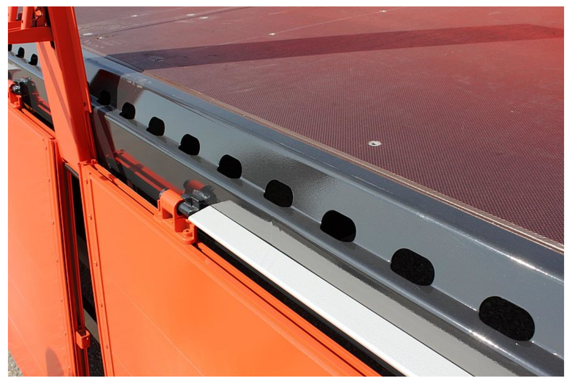
OPTIONAL: Perforated external frame with approx. 100 mm hole spacing, 50/30 mm slot, for securing 2 t per lashing point