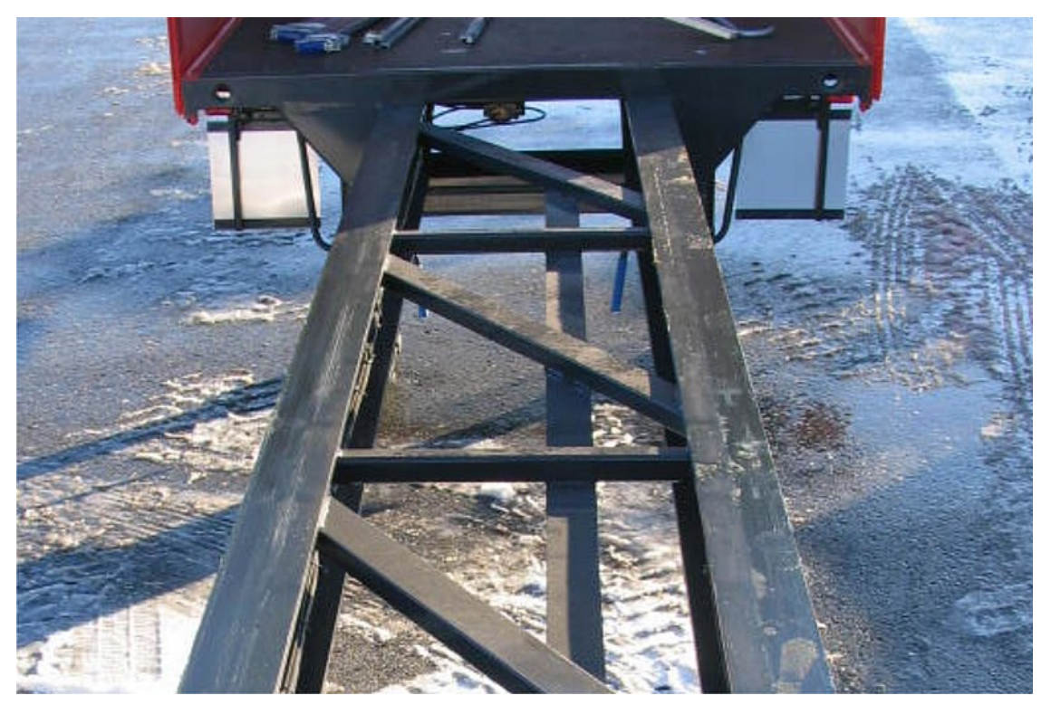
Extendible lightweight frame with an extension length of 6 m for long materials transport up to 22 m