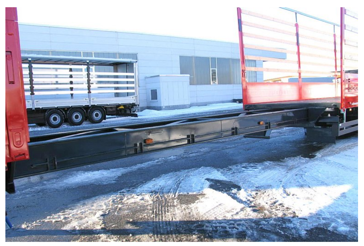
Torsionally rigid, pull-out welded steel frame design, with 7-step pneumatic locking