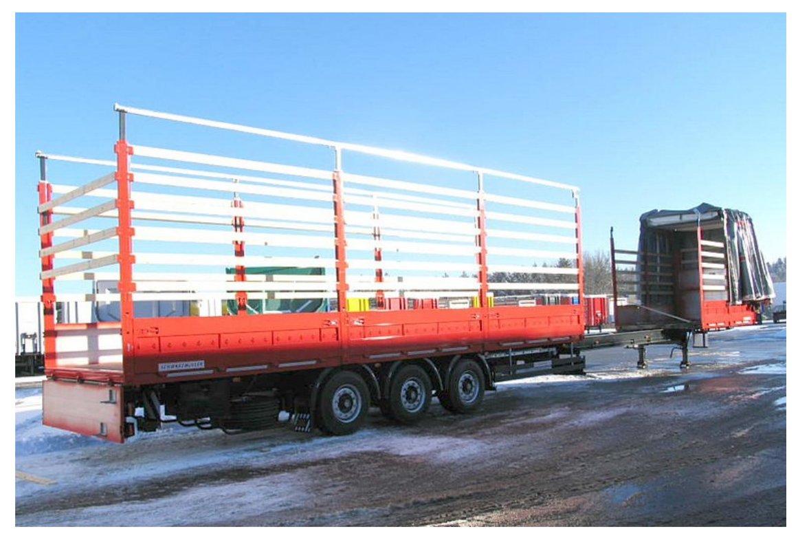
3-axle platform semitrailer - extendible