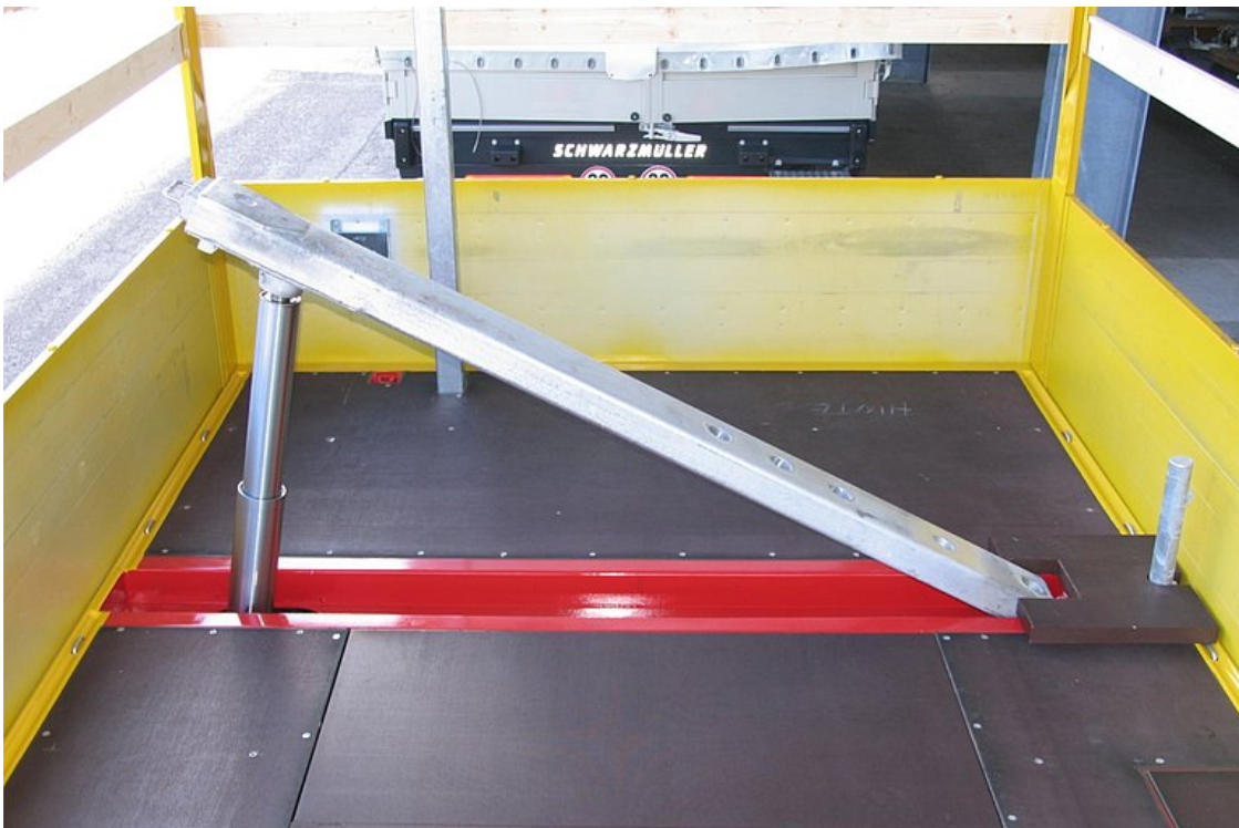
Recessed tubular supports, extendible with hydraulic 4-step lifting cylinder