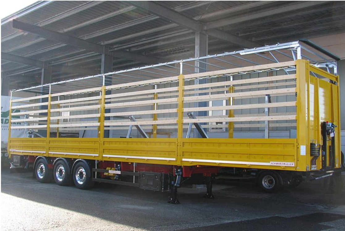
3-axle lightweight platform semitrailer - coil - inclined loader