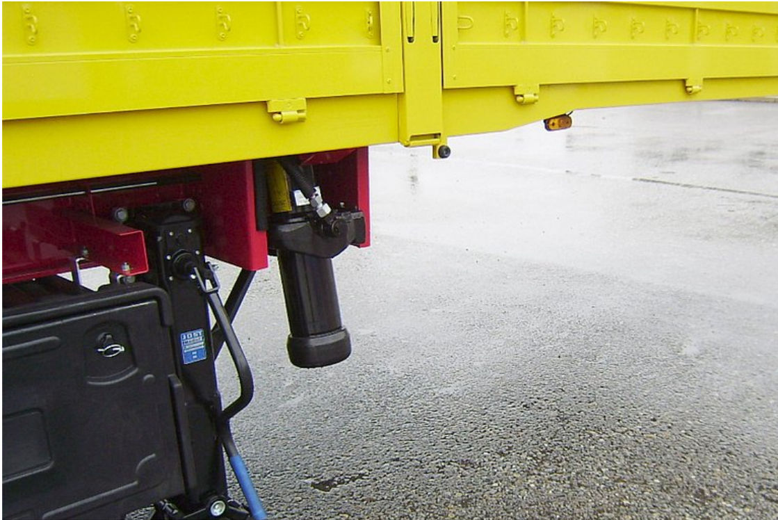
Electrohydraulic pump unit for independent operation of the inclined loading device on the semitrailer