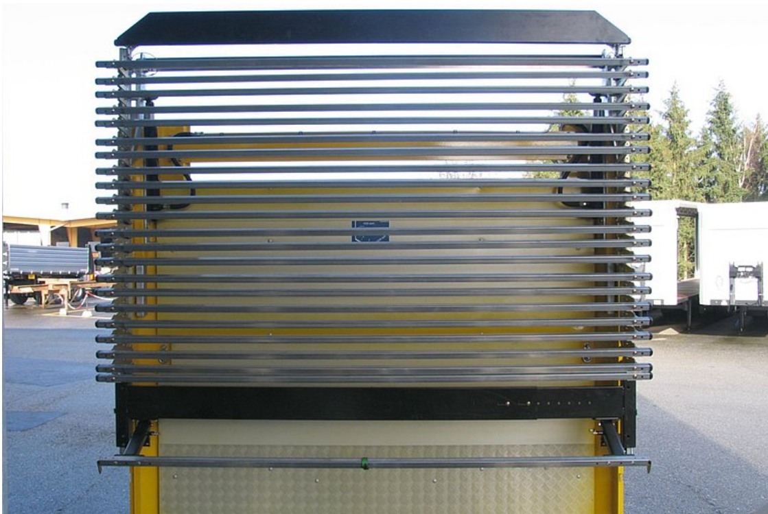
Sliding cover, hydraulically foldable against inside of front wall for open plate transports