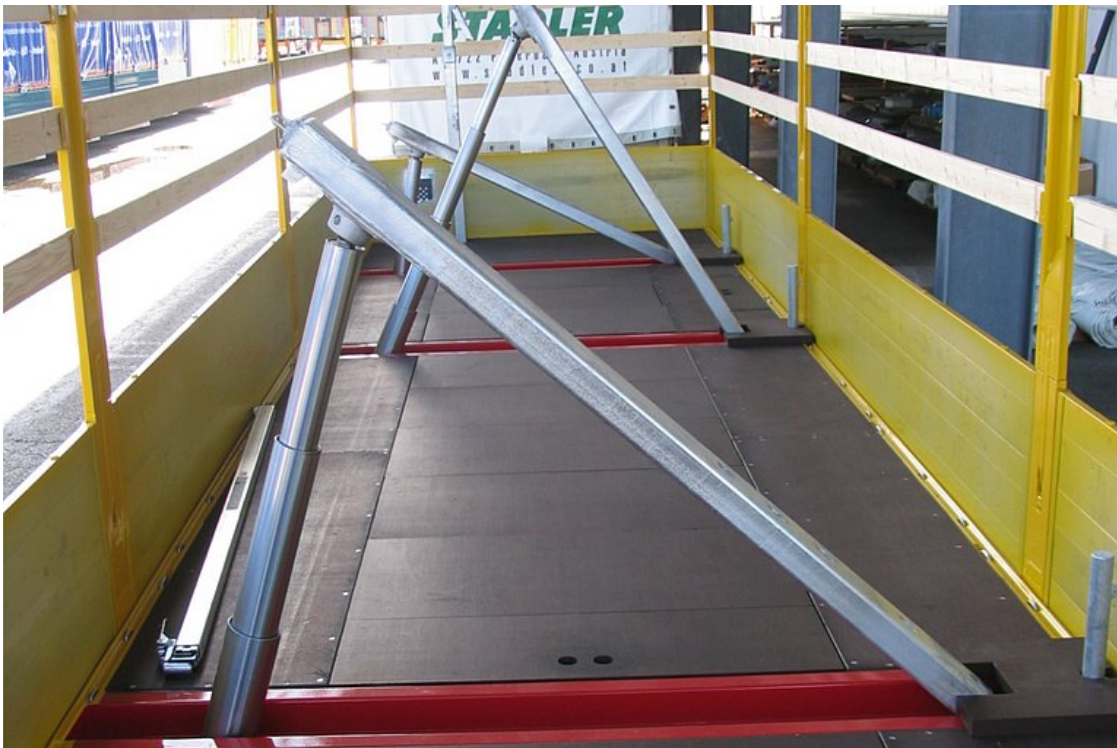
Hydraulic inclined loading device to transport large-format sheet metal up to 3,300 mm wide