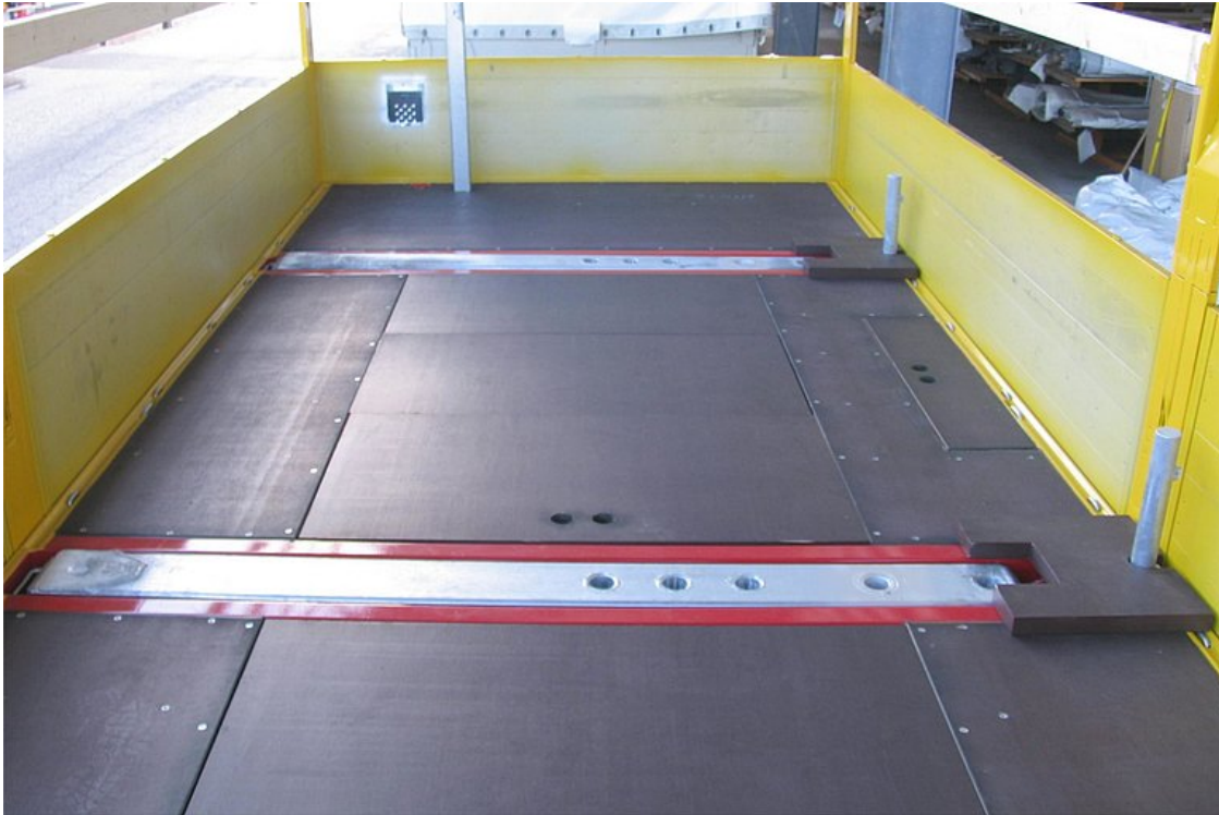
Load area with retracted inclined loading device