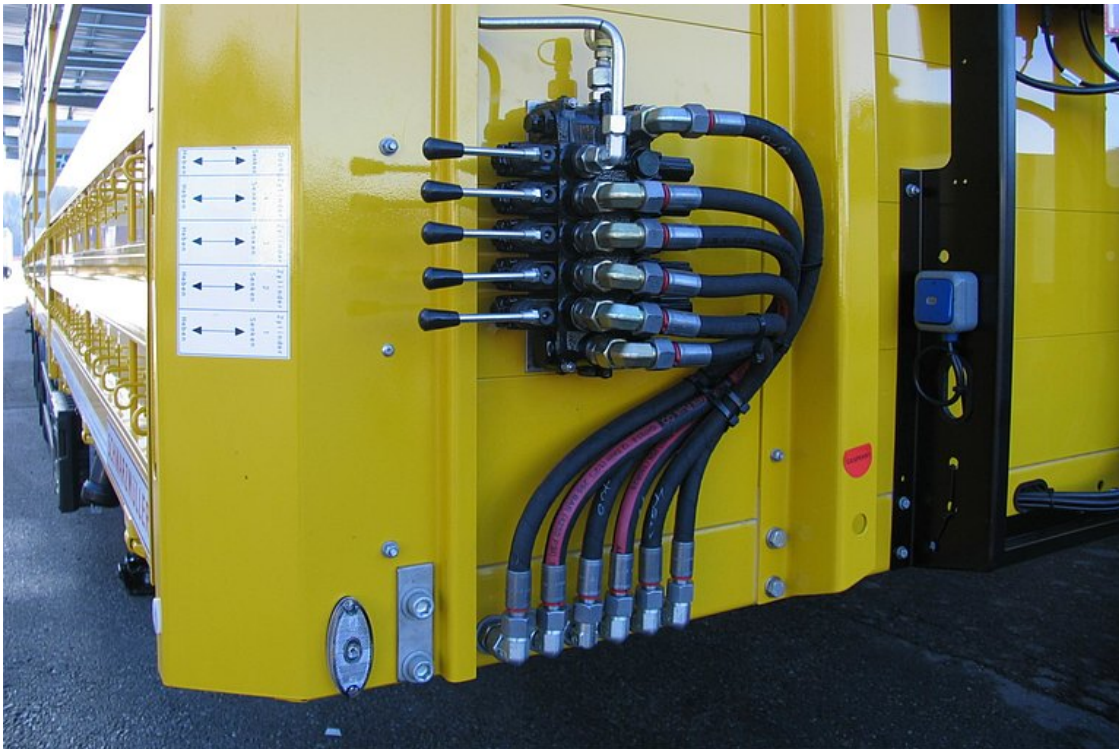
Hydraulic control unit for inclined loading system