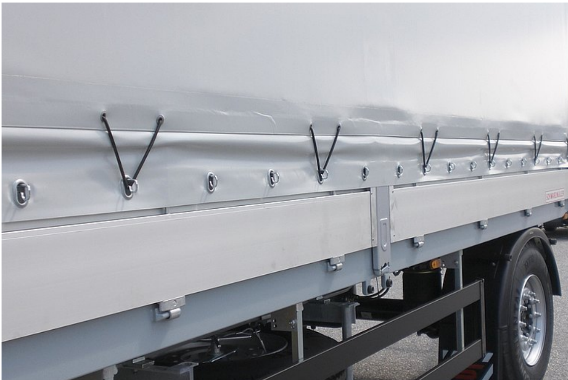
OPTIONAL: Version with sliding tarpaulin + side walls