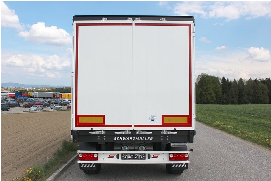
Bolted portal at rear with aluminium corner posts and fully opening double door in profile design