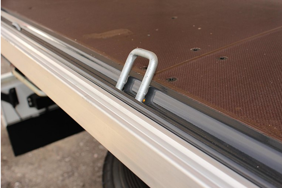
Additional protection in the form of aluminium combination bumper strip, bolted on both sides, with integrated tarpaulin mounting and pole fixation