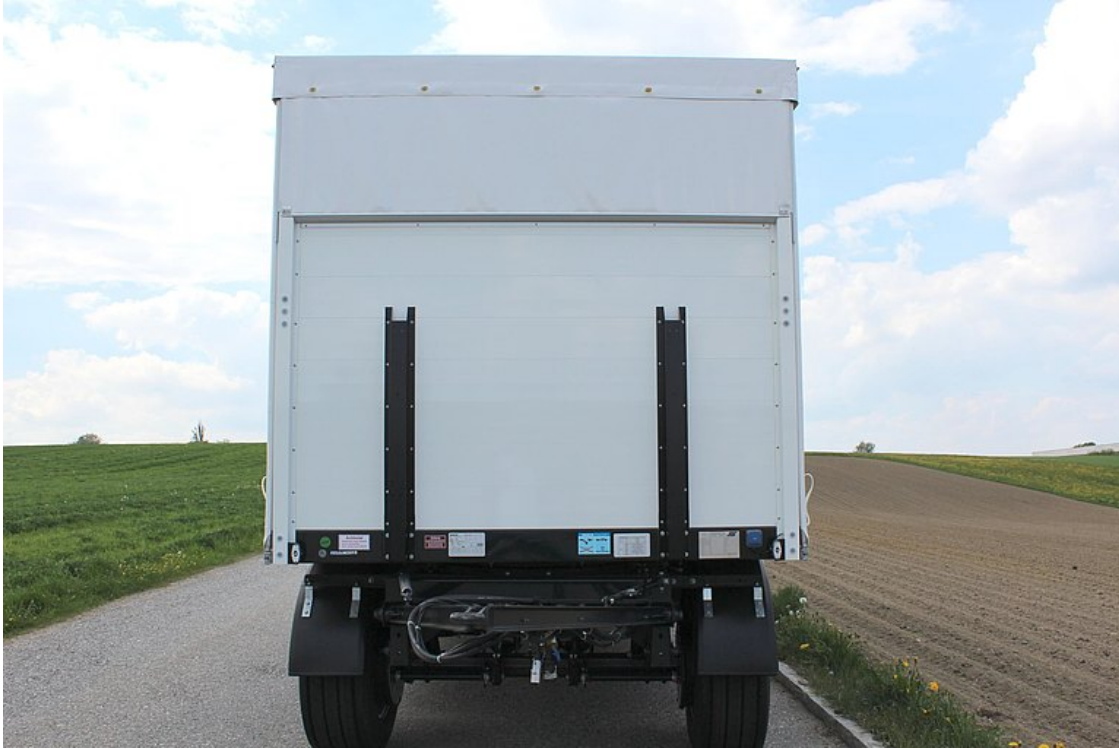
Reinforced aluminium hollow profile front wall with integrated equipment bracket