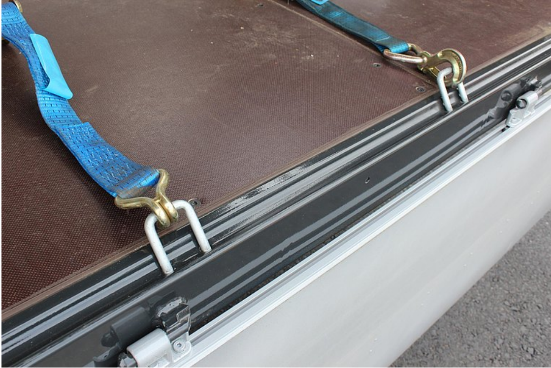
External frame with 15 pairs of recessed 2.5 t lashing points for load securing