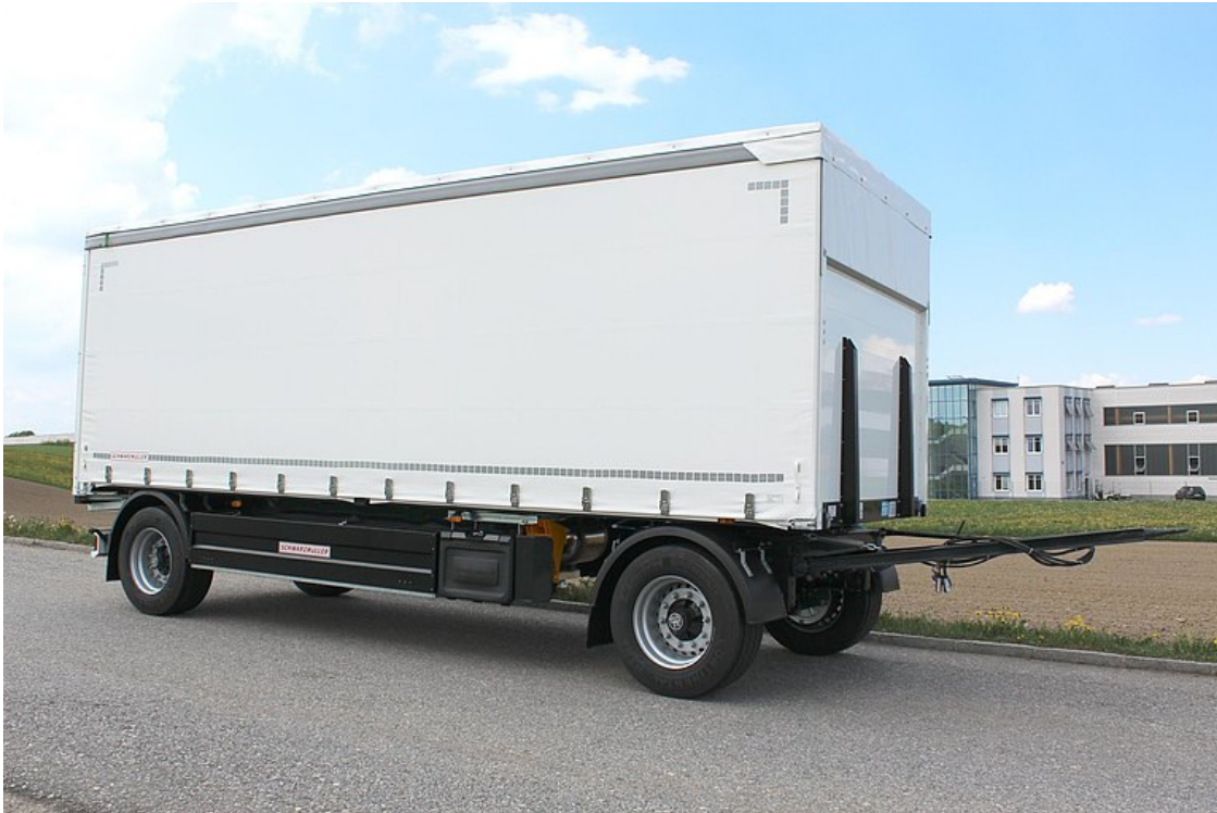
2-axle sliding tarpaulin platform trailer