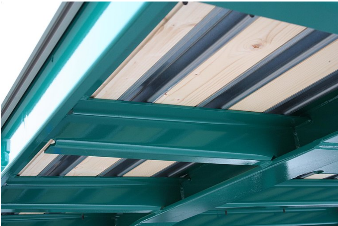
Double floor consisting of subfloor with integrated steel omega profiles beneath resin-coated wear floor