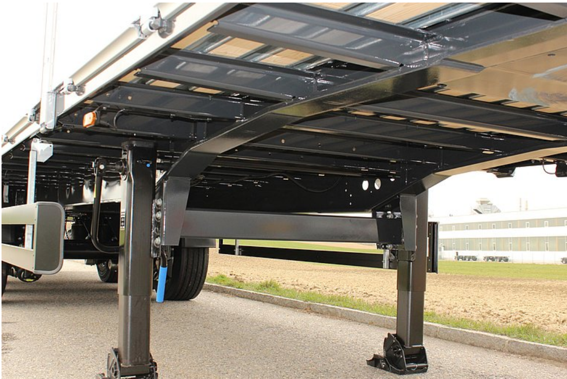
Reinforced frame design for point loading 20 t on 4 m in the centre of gravity