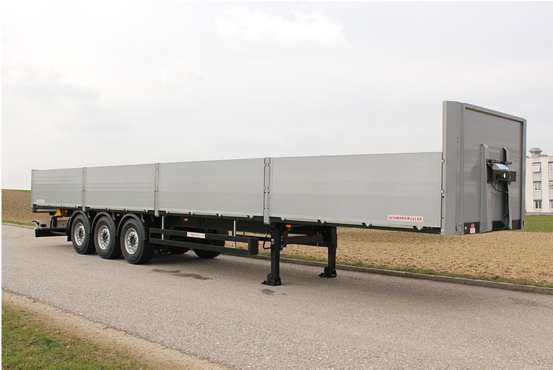
Reinforced body design with load securing certificate in accordance with DIN EN 12642 Code XL