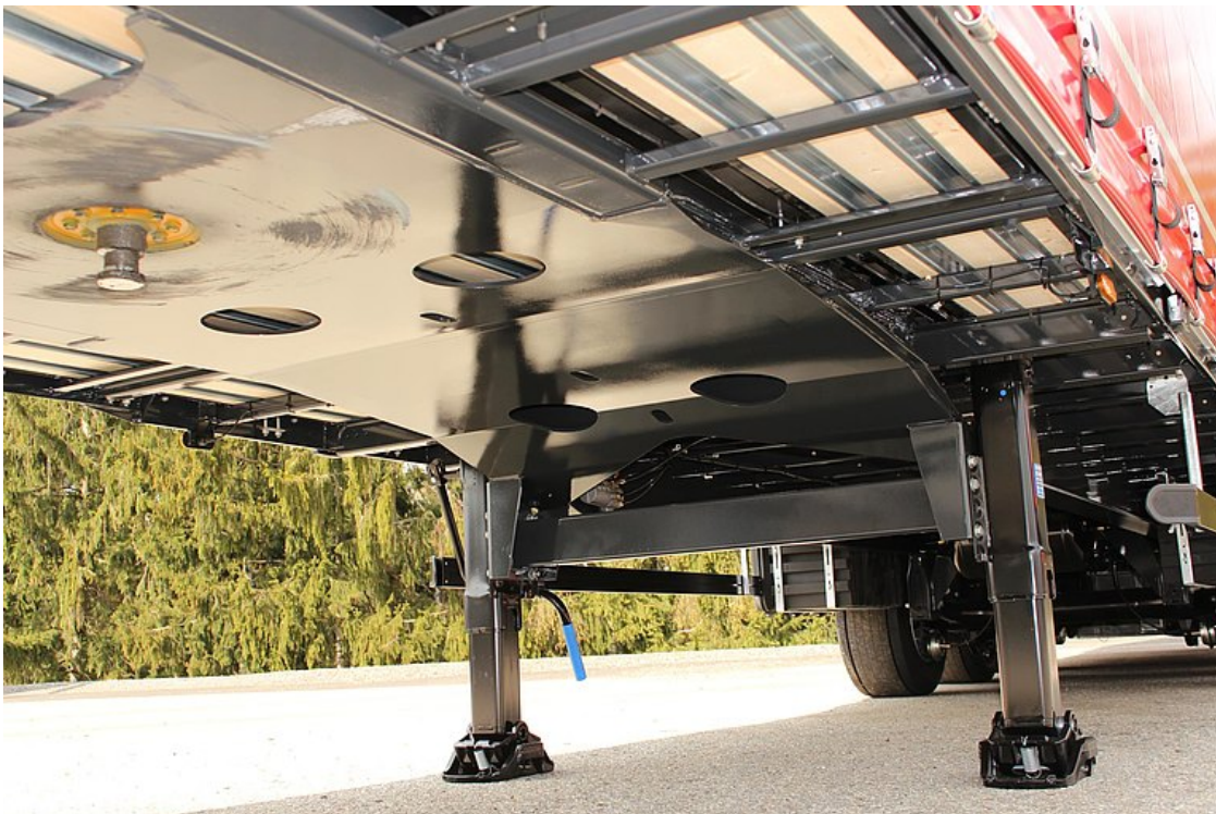
Low frame design height of 80 mm for up to 3,000 mm internal height