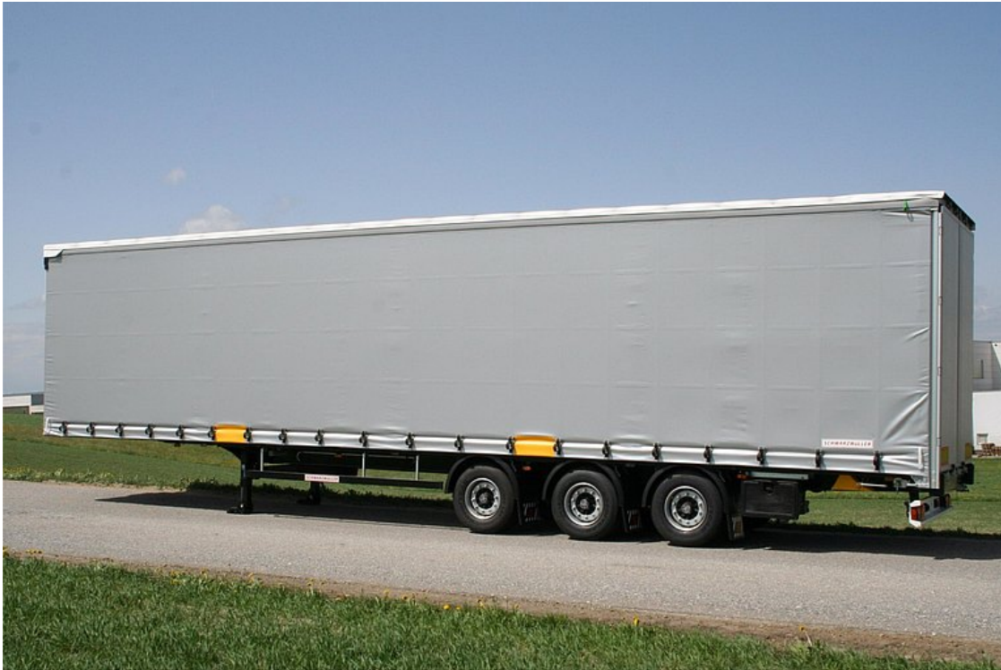
Low corrosion, high-quality aluminium body components, tested according to EN 12642 XL