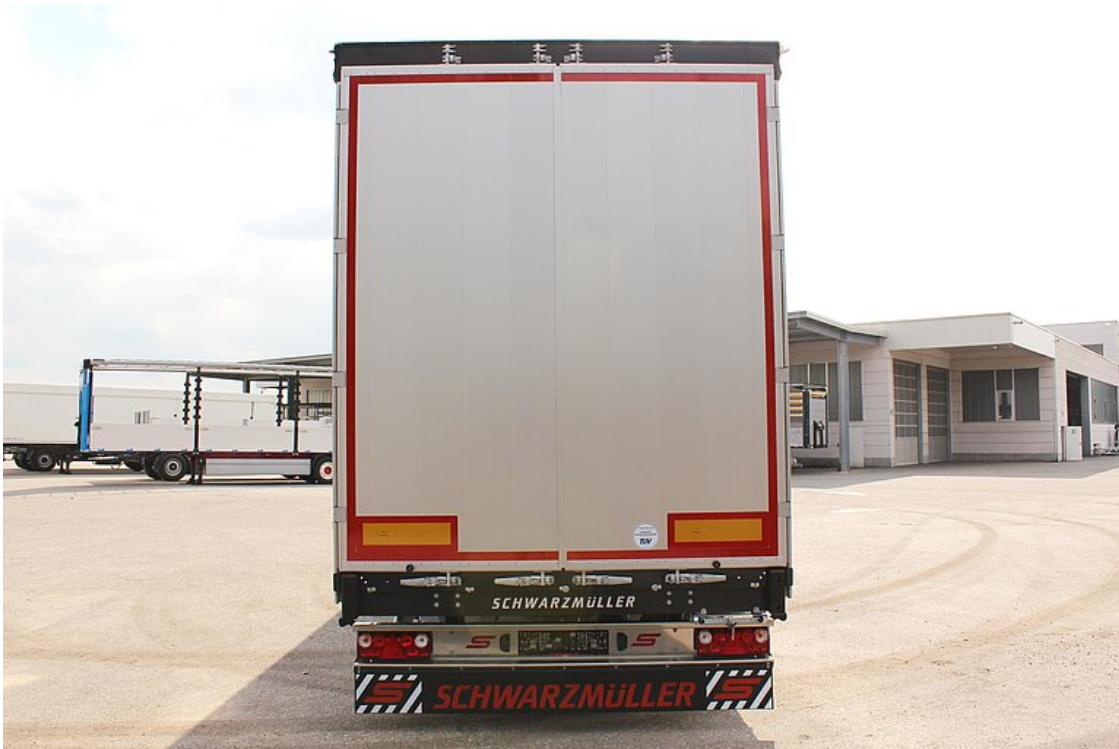
Portal bolted onto the rear with aluminium corner posts incl. fully opening double door in profile design