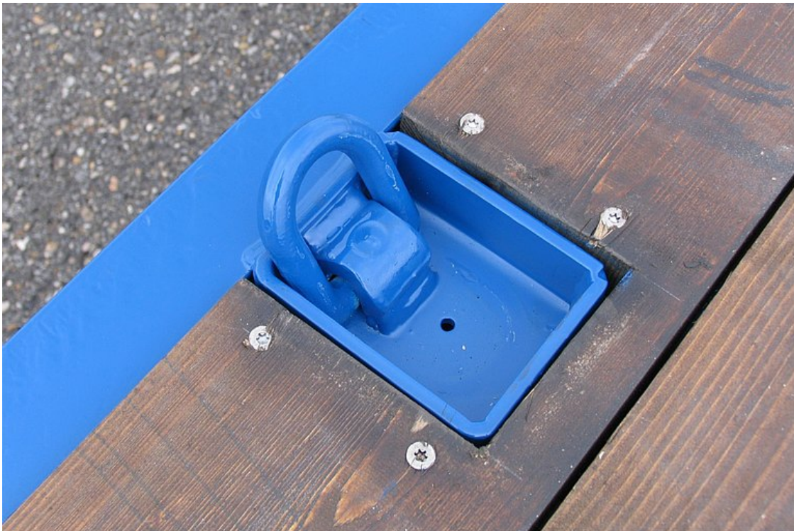
Floor-recessed lashing rings as well as lashing points on external frame for optimised load securing