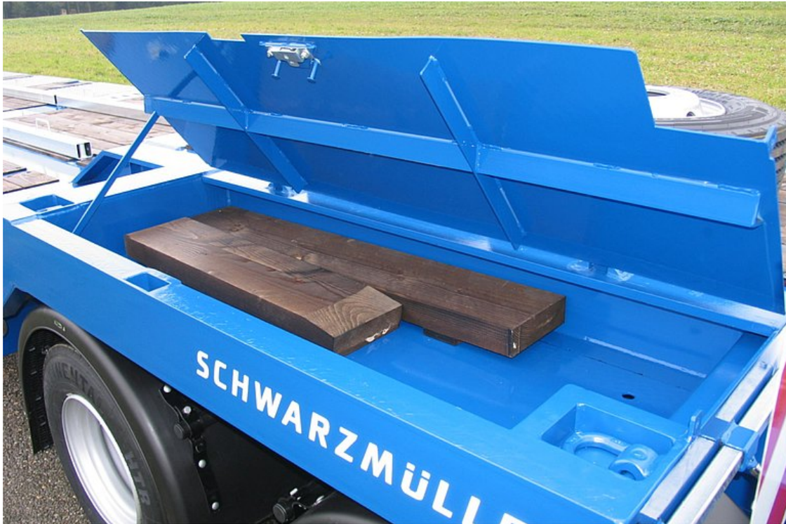
Raised platform at the front with 2 lockable accessory compartments