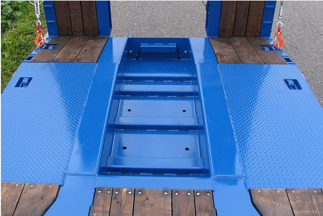
Excavator shovel recess between side members at rear