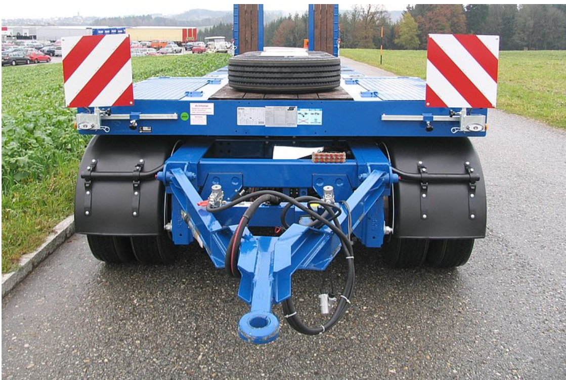
Front offset platform with accessory compartments and pull-out warning signs for transporting wide loads