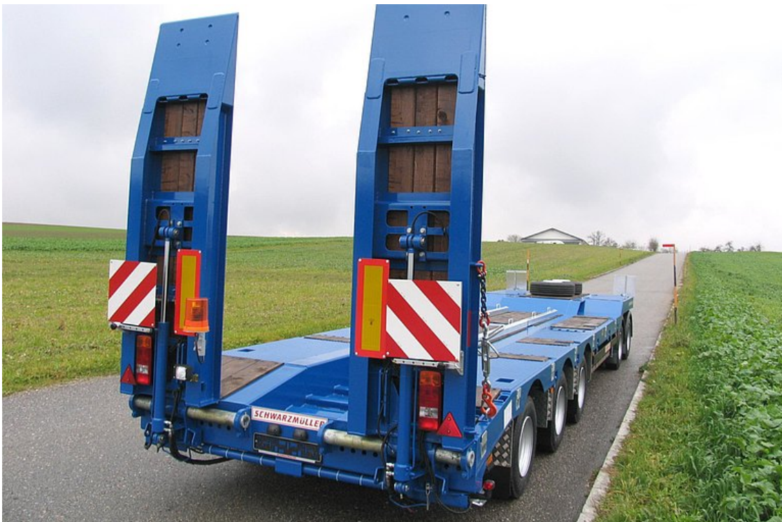
2 folding single-part loading ramps with hardwood flooring