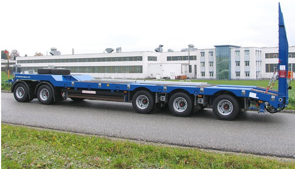
5-axle low loader trailer with offset platform