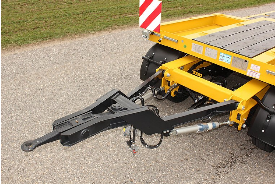
OPTIONAL: Offset drawbar with pivoting eye, 40 + 50 mm