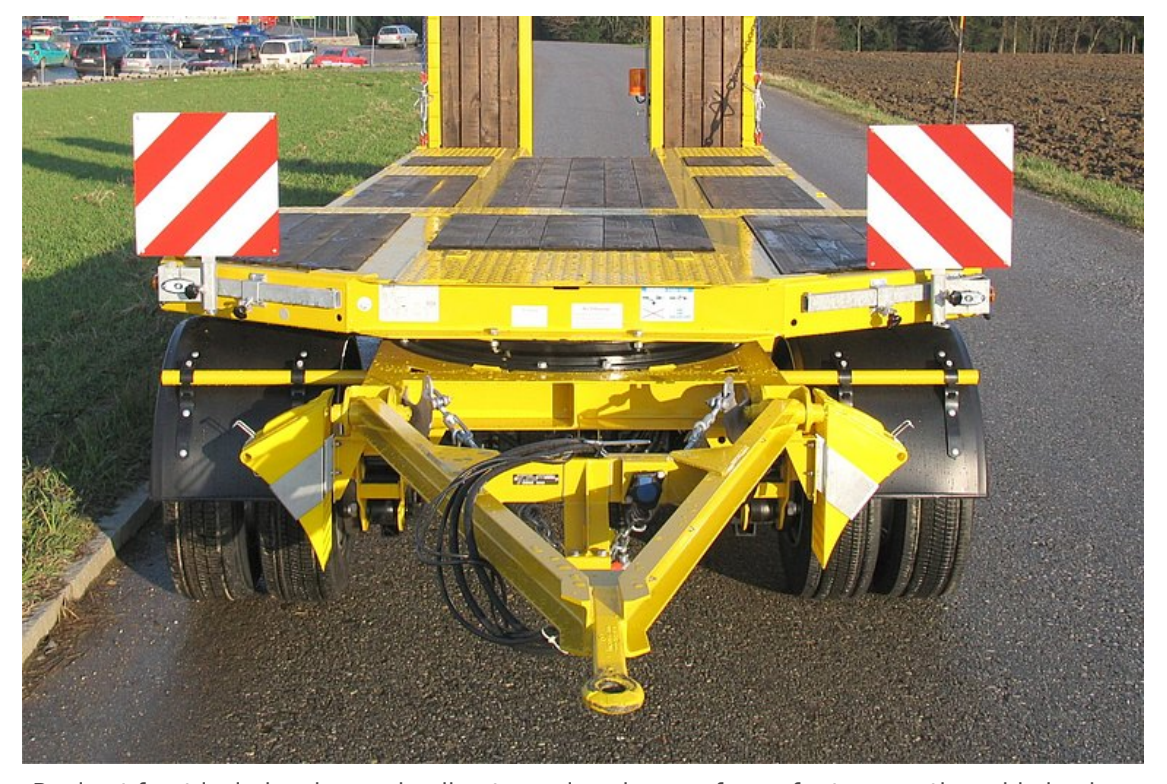
Bogie at front incl. drawbar and pull-out warning signs on frame for transporting wide loads