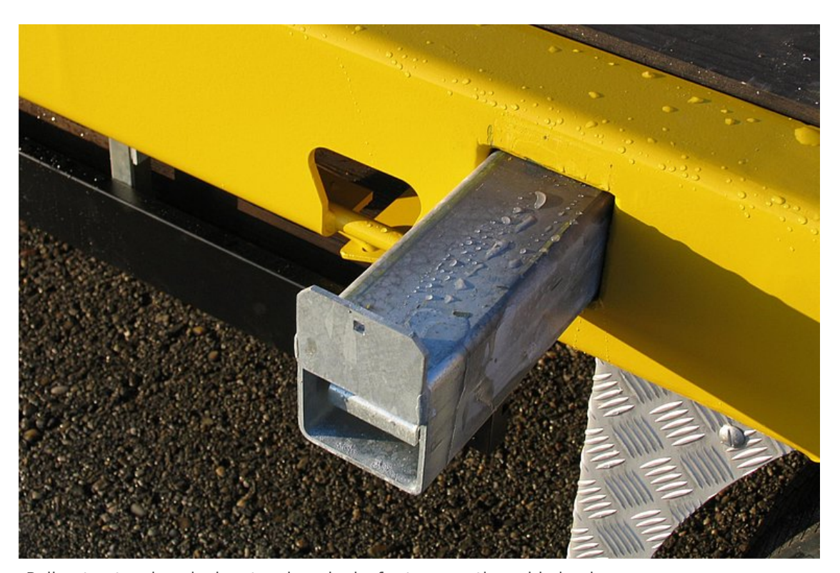
Pull-out extensions incl. extension planks for transporting wide loads