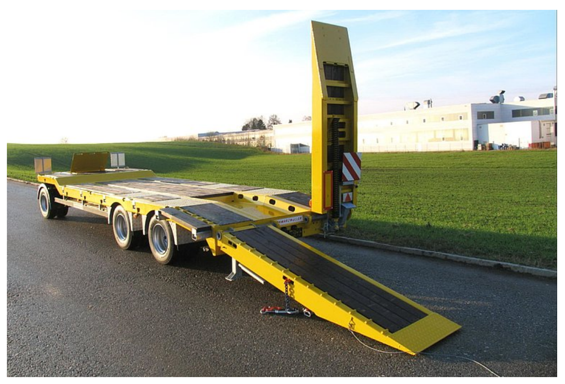
2 folding single-part loading ramps with hardwood flooring