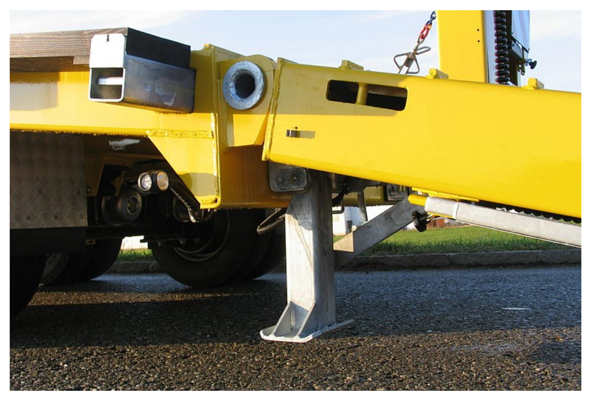
1 automatic folding support per ramp and frame end at rear end