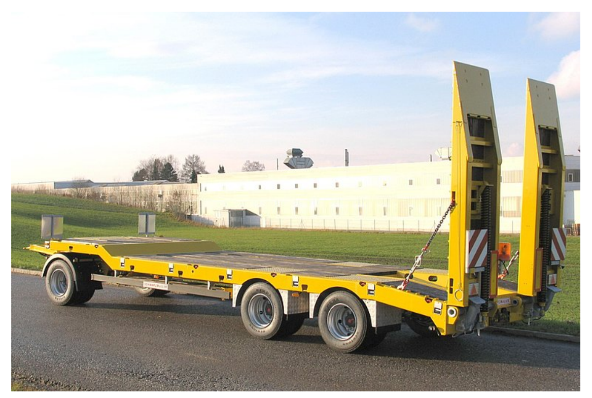
3-axle low loader trailer