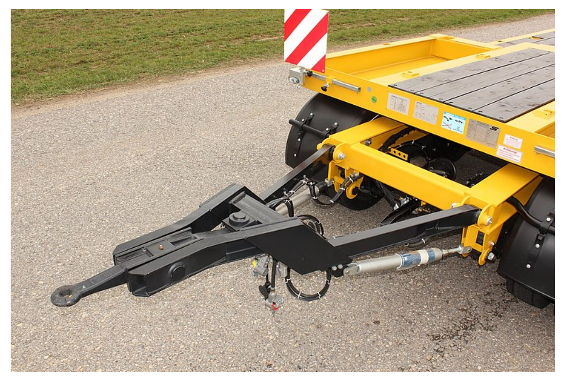
Offset drawbar with pivoting eye, 40 + 50 mm