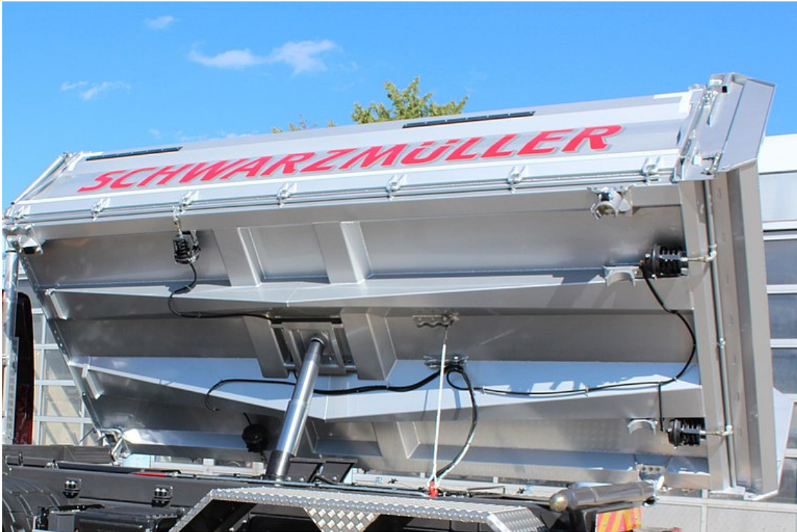
Tipper body design with conical trapezoidal profile side members in high-strength, lightweight design with small bottom panels for high dent resistance and shock absorption