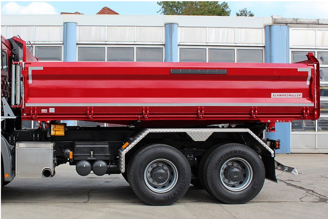
OPTIONAL: Reinforced side walls with material-repellent membrane construction made from fine-grained special steel panels