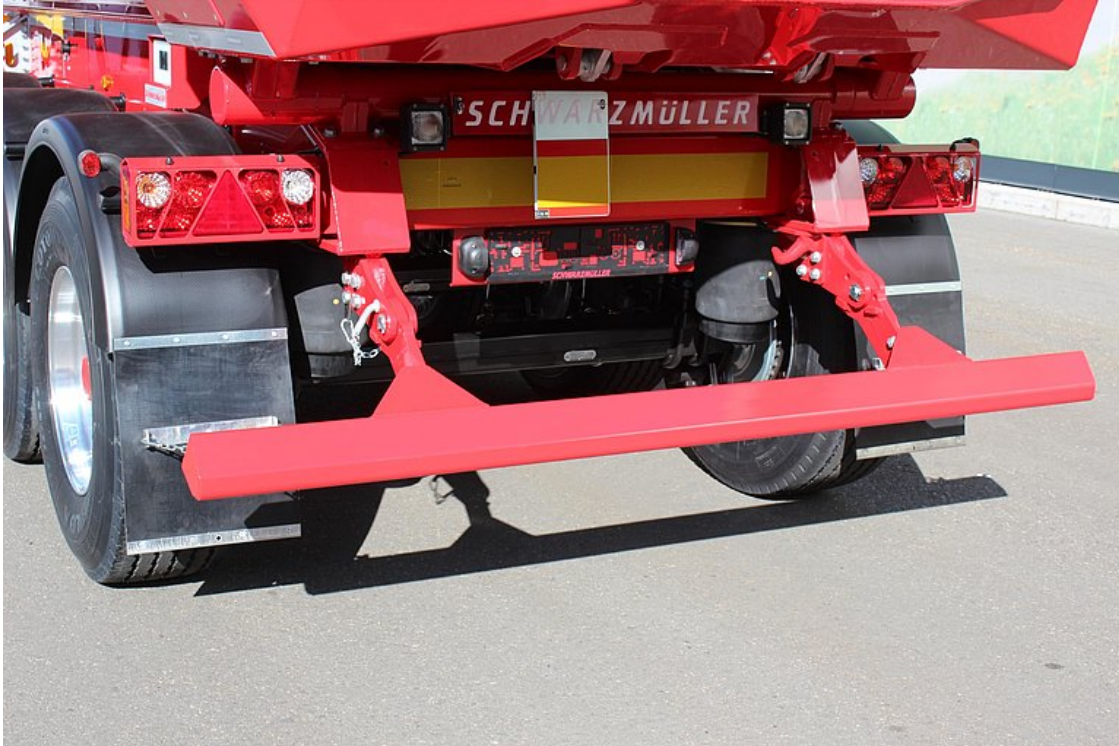
Folding aluminium trapezoidal underride protection, can be folded up pneumatically as an option