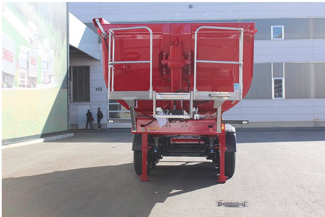
Insulated front wall with hard chrome-plated, high-grade front tilt cylinder